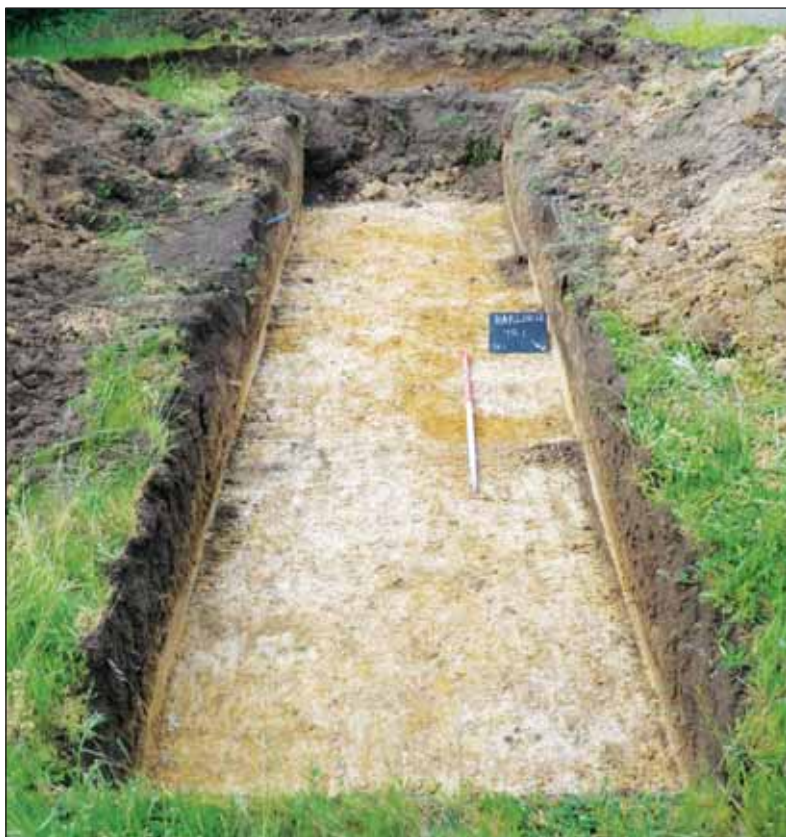
Plate 1: Trench 1, taken from north-east