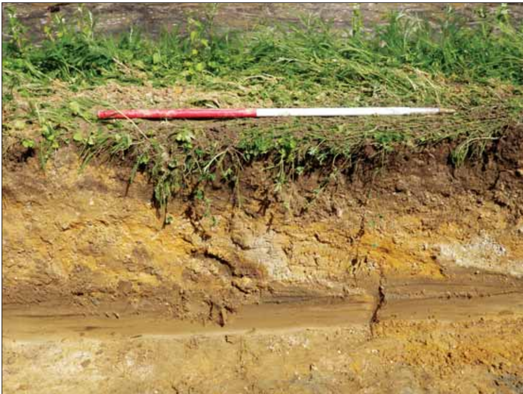
Plate 4: North-west facing section, Trench 5