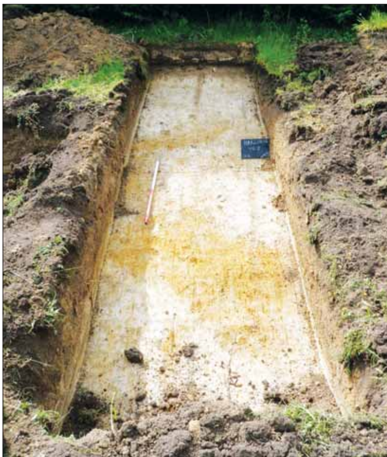
Plate 2: Trench 2, taken from north-west