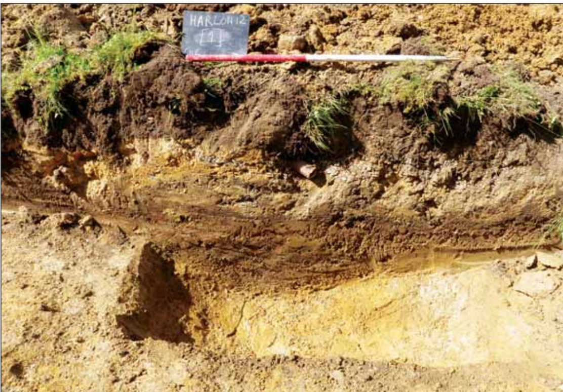
Plate 6: Ditch 01, Trench 4, taken from north-east