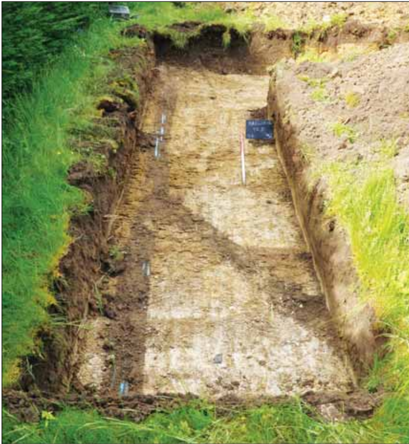
Plate 3: Trench 3, taken from north-east