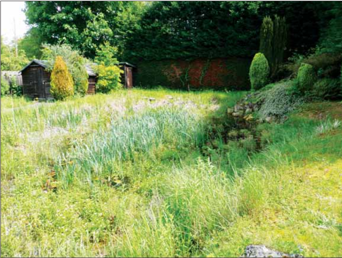
Plate 5: Large pond at rear of the garden