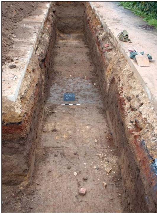
Plate 1: Trench 1, looking north