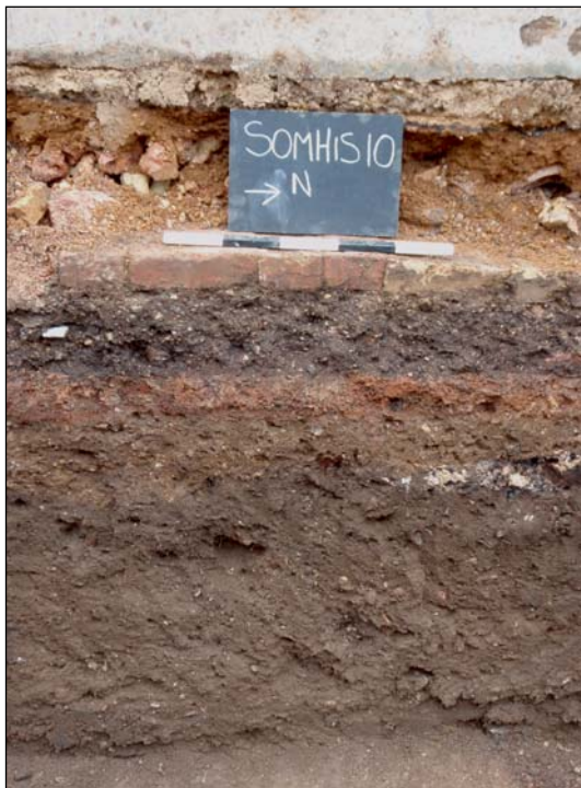
Plate 3: Trench Section