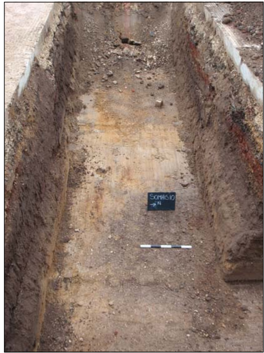
Plate 2: Trench 1, looking west