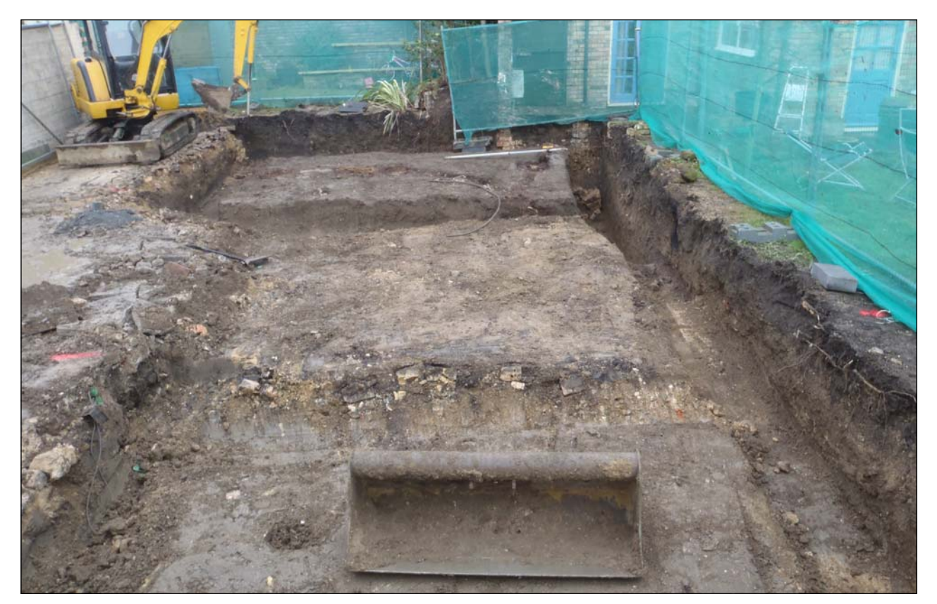
Plate 3: Extent of extraction from south