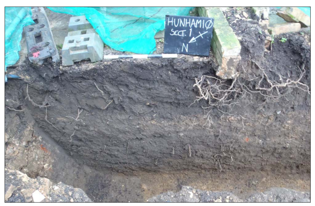
Plate 1: Section and feature at the NE end of trench 1