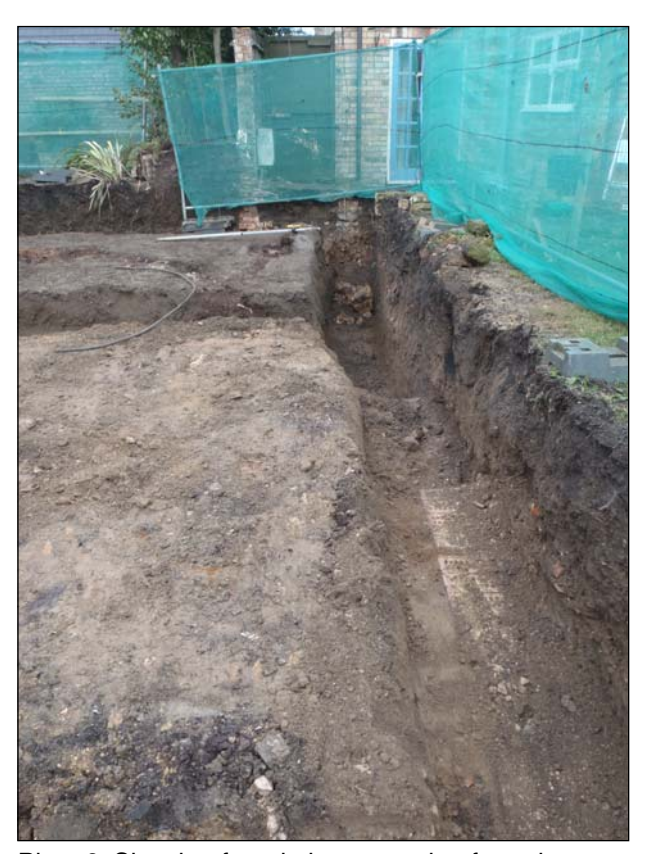
Plate 2: Showing foundation extraction from the west