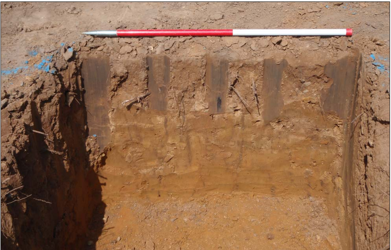
Plate 2: Section of foundation pad showing pale brown subsoil (02) and natural sand (03)