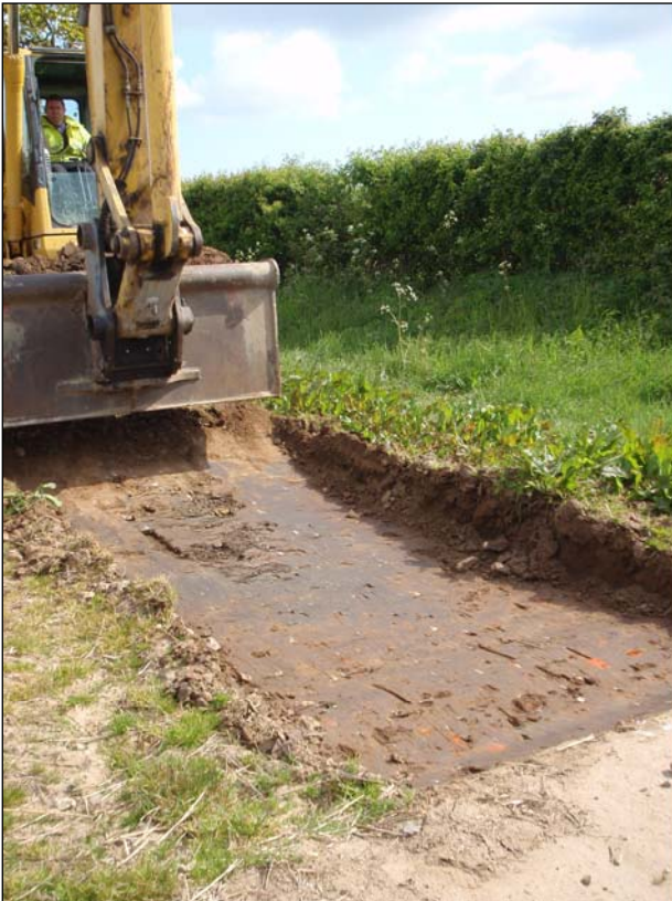
Plate 1: Working Shot showing topsoil strip