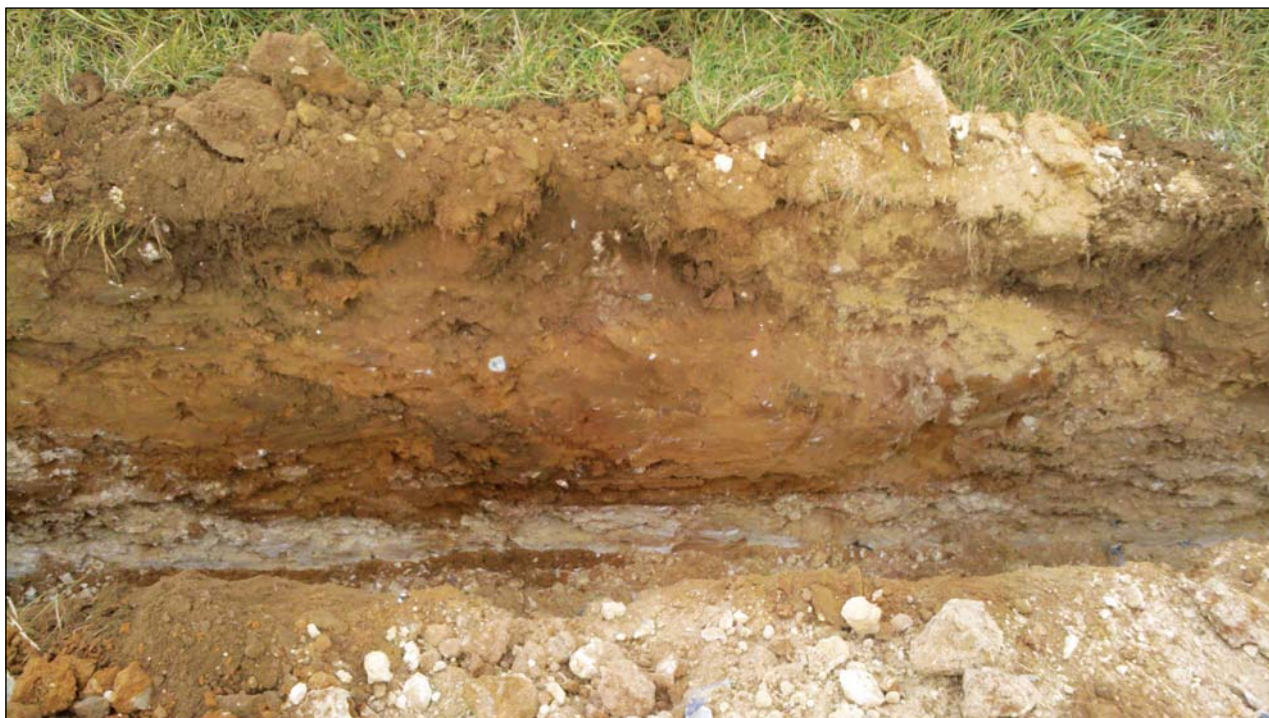
Plate 1: Section of pipe trench