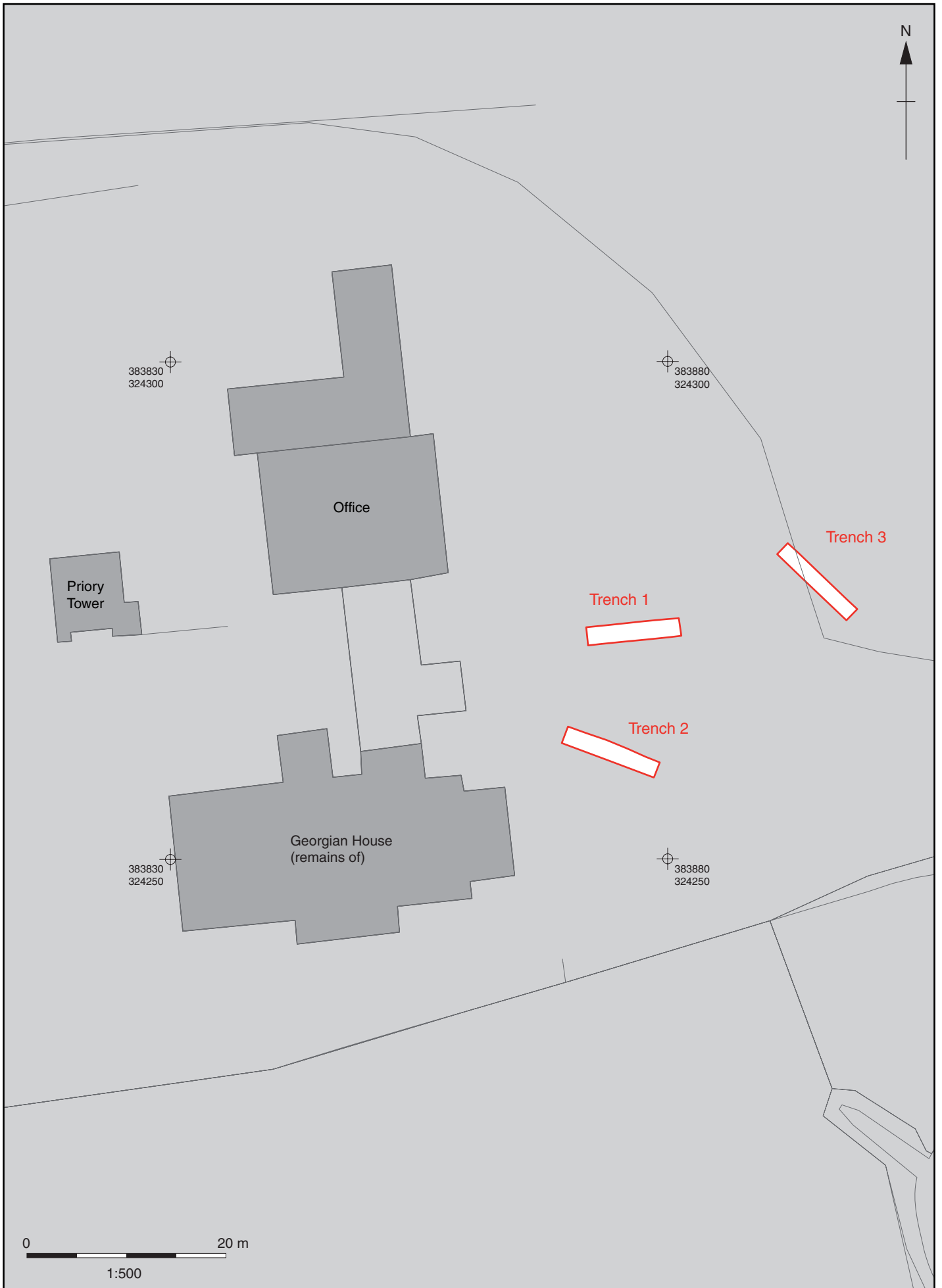
Figure 2: Trench location plan