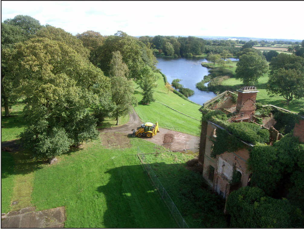
Plate 1: View of Ranton Estate from Priory tower