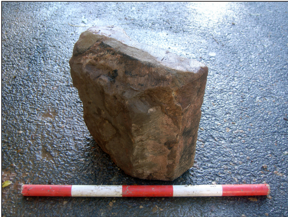
Plate 2: Worked stone from context 303