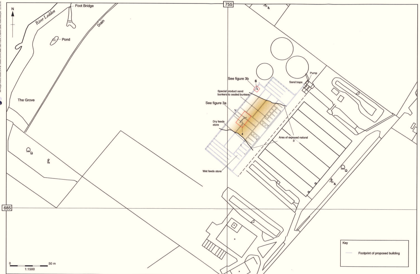
Figure 2: Location of area of new buildings