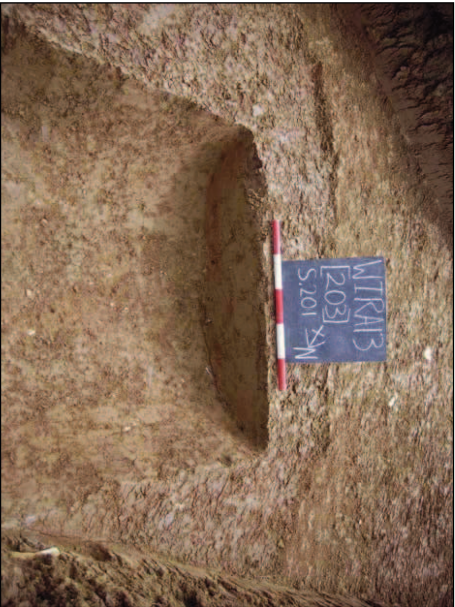
Plate 1: Ditch 203 looking southwest