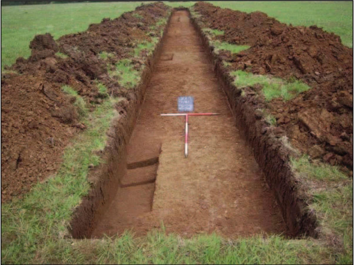
Plate 3: Furrow 402 looking east