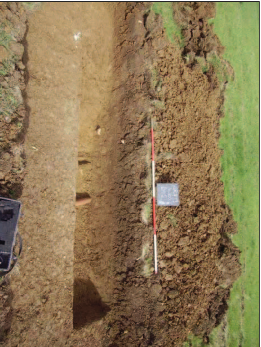
Plate 2: Furrow 303 looking north