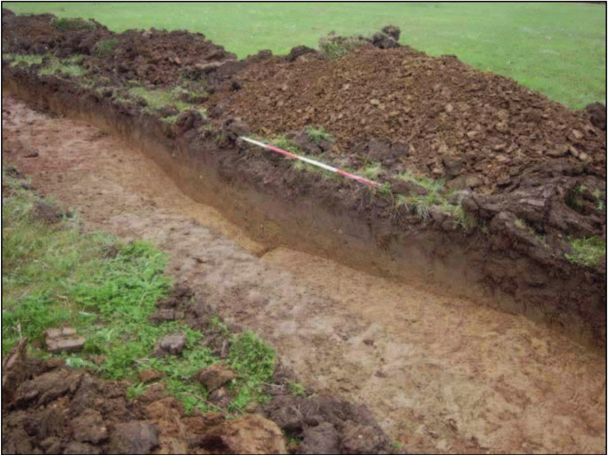
Plate 4: Furrows 408 and 410 looking northwest