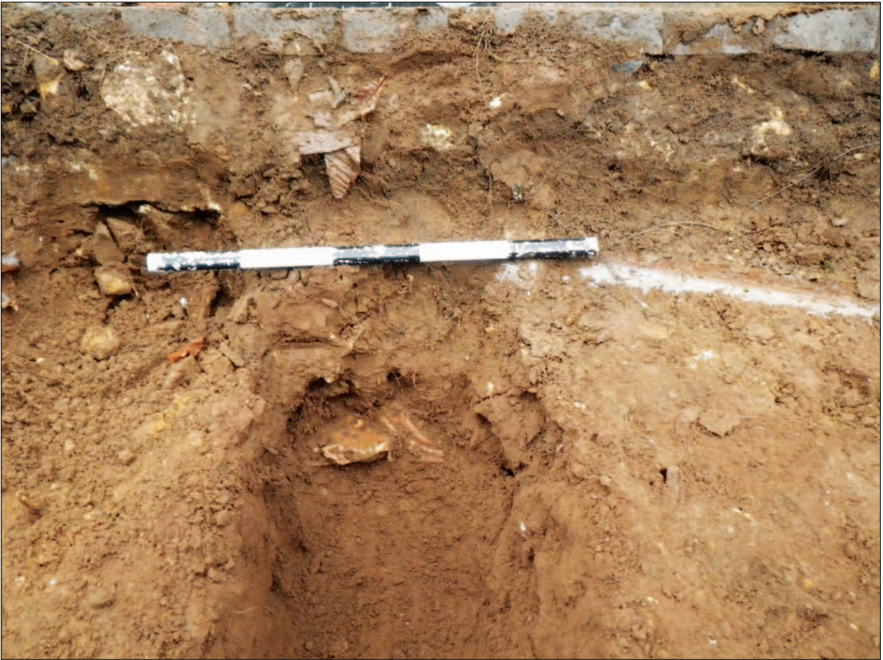
Plate 3: In situ Human Remains looking south