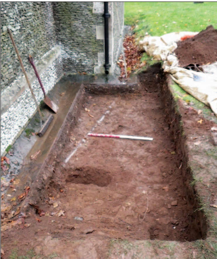
Plate 2: Trench Overview looking east