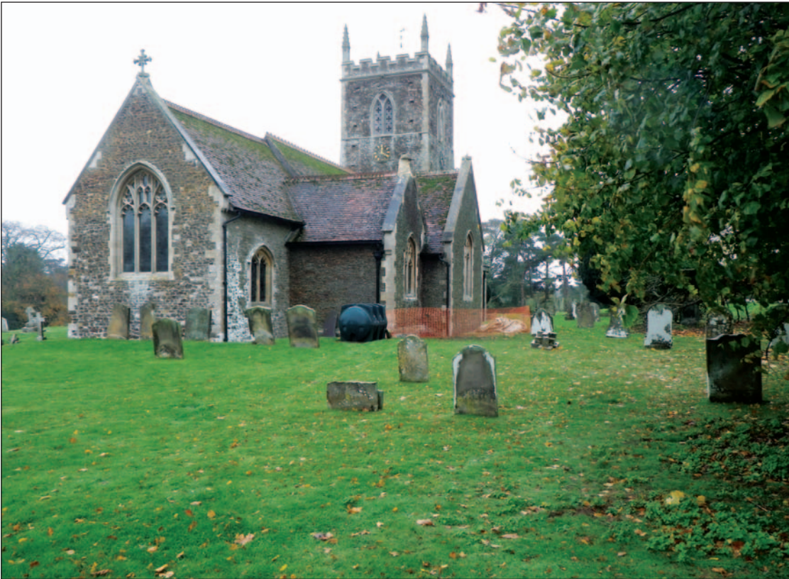
Plate 1: Site Overview looking east south east