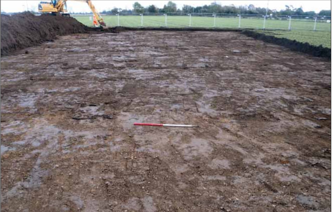
Plate 1: View of the stripped area from the west