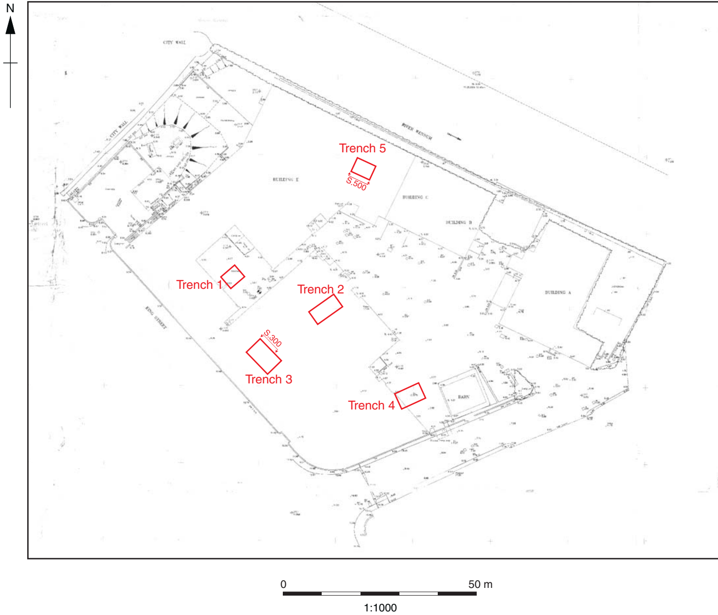
Figure 2: Trench location