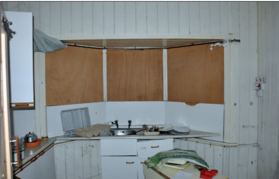
Plate 10: Kitchen area showing tongue and groove panelling