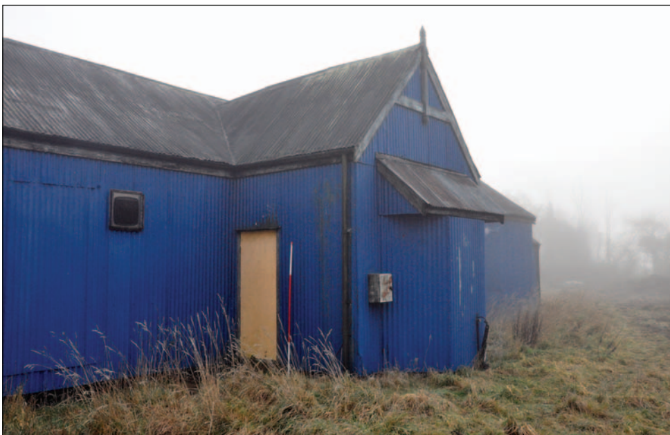
Plate 8: Western office wing showing doorway