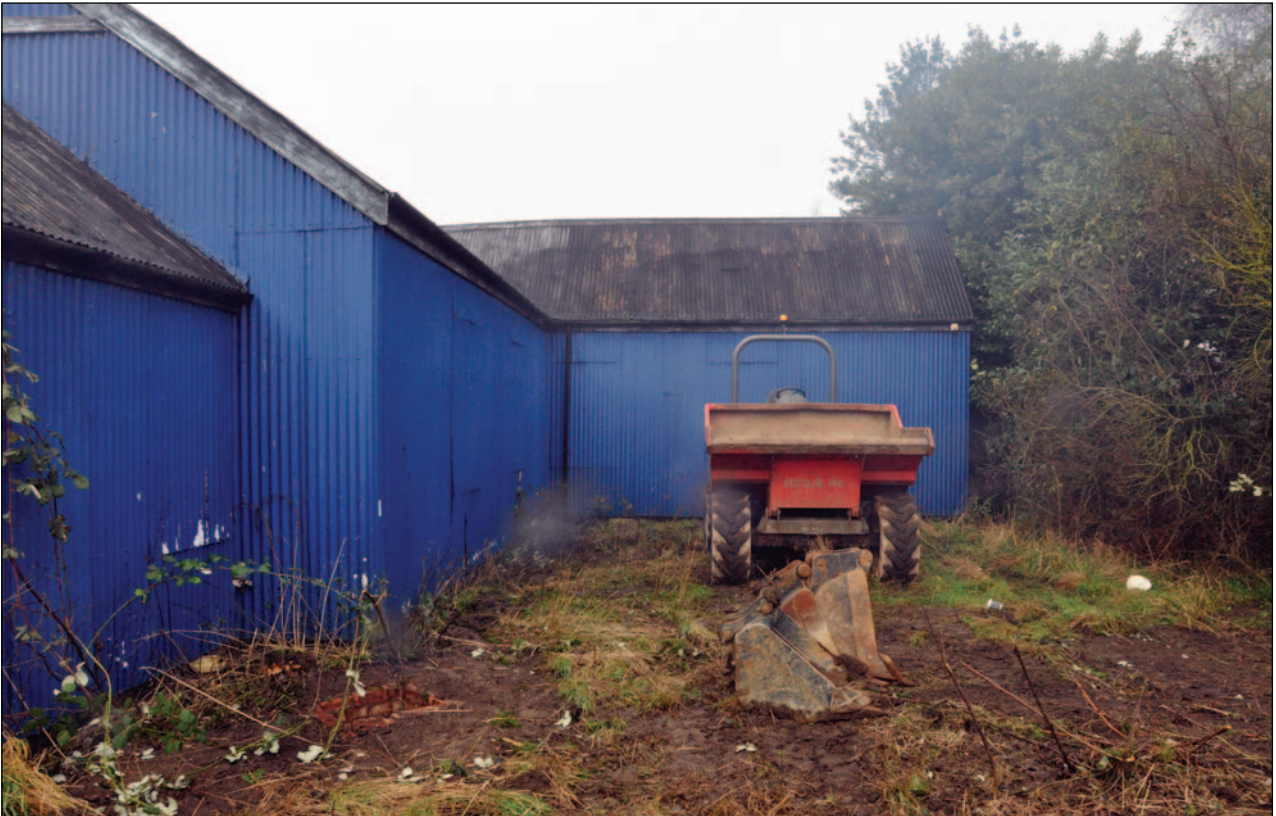
Plate 3: Eastern wing from the south