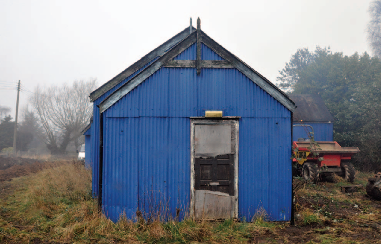
Plate 5: Southern elevation