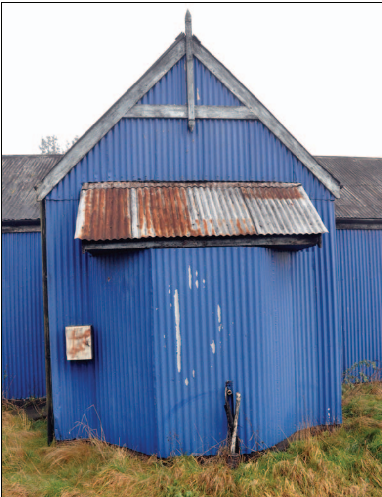
Plate 7: Western office wing