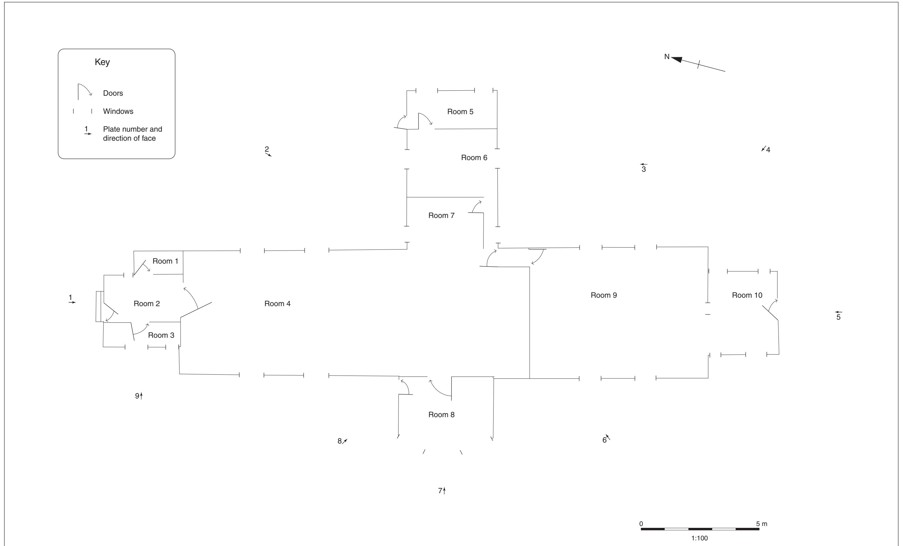
Figure 2: Floor plan and direction of report plates