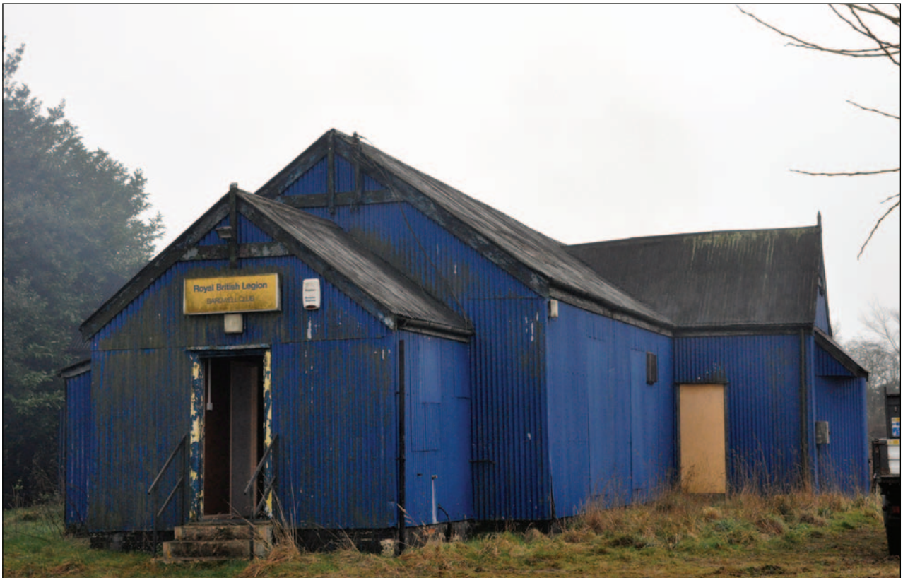
Plate 1: Northern elevations