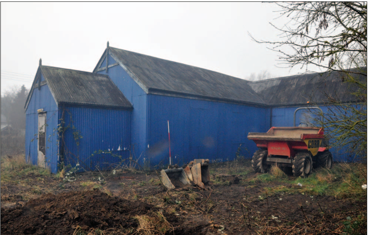
Plate 4: Eastern elevation