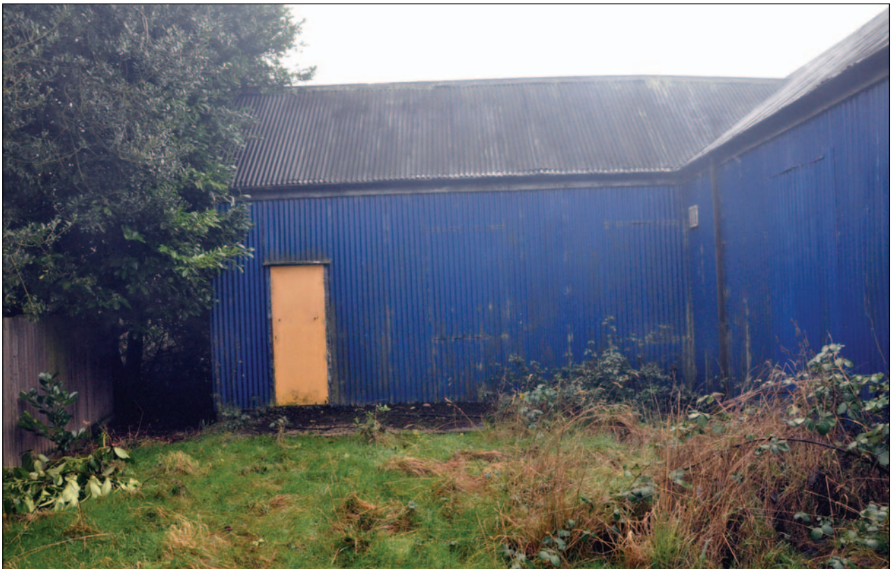
Plate 2: Eastern wing from the north