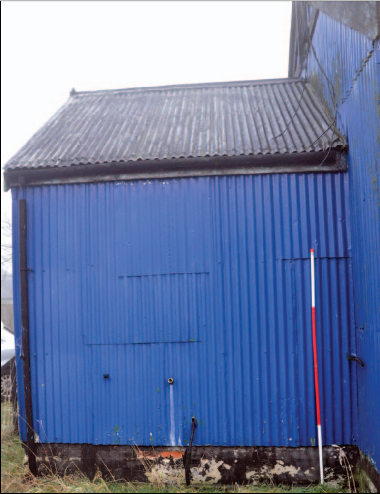
Plate 9: Entrance lobby from the west