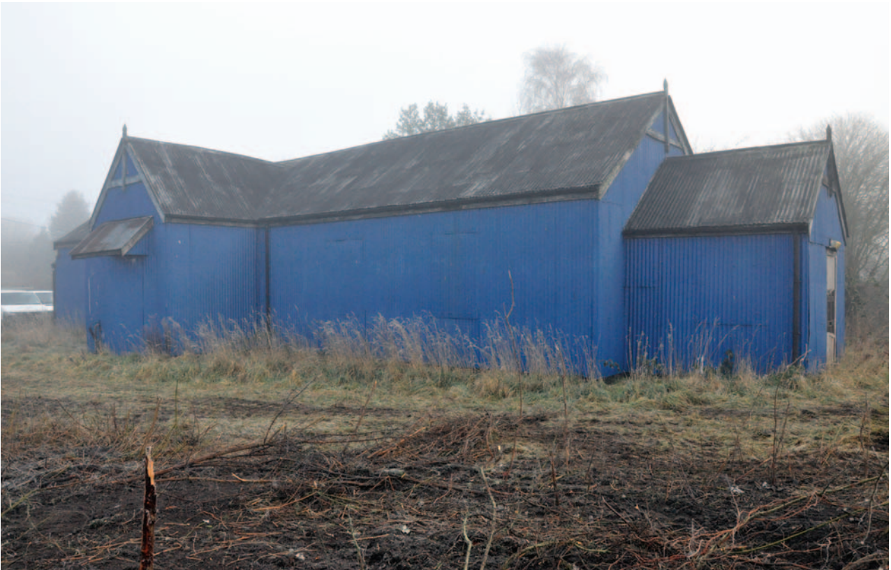
Plate 6: Western elevation