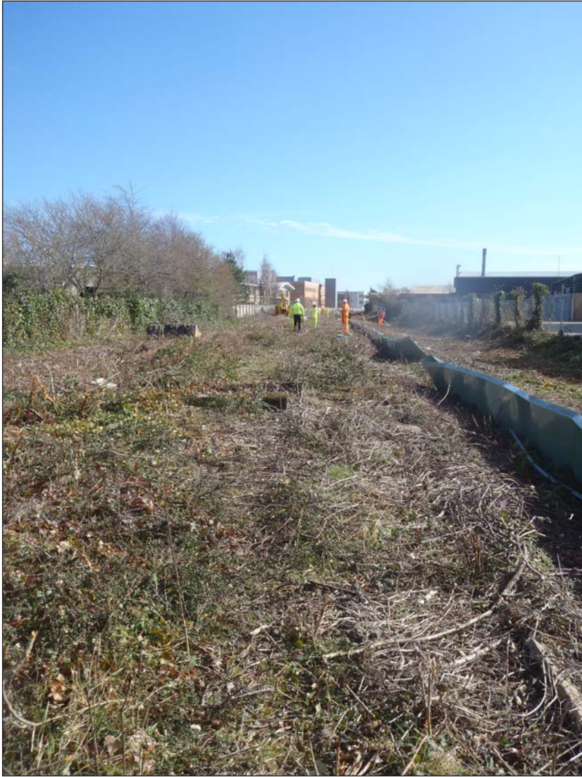
Plate 1: View down site (looking south-east)