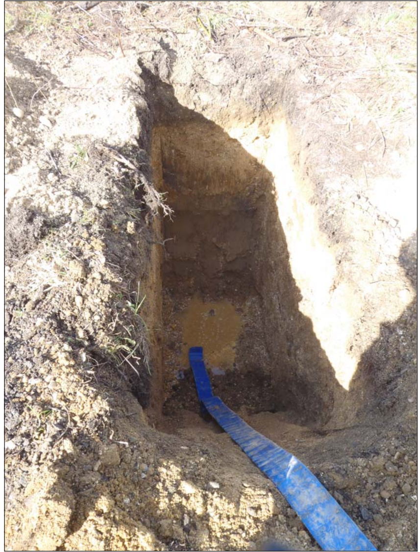
Plate 2: Slip Trench 4