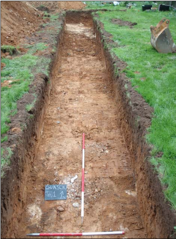
Plate 1: Trench 1