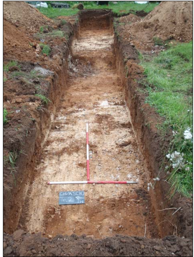
Plate 2: Trench 2