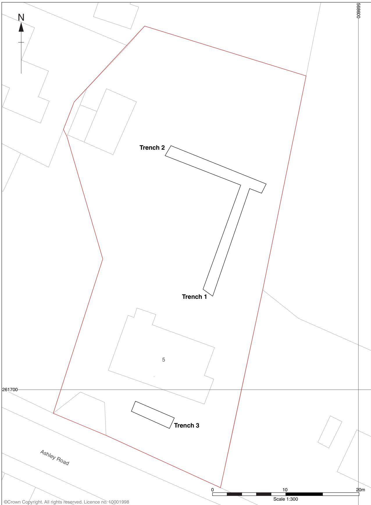
Figure 2: Trench plans