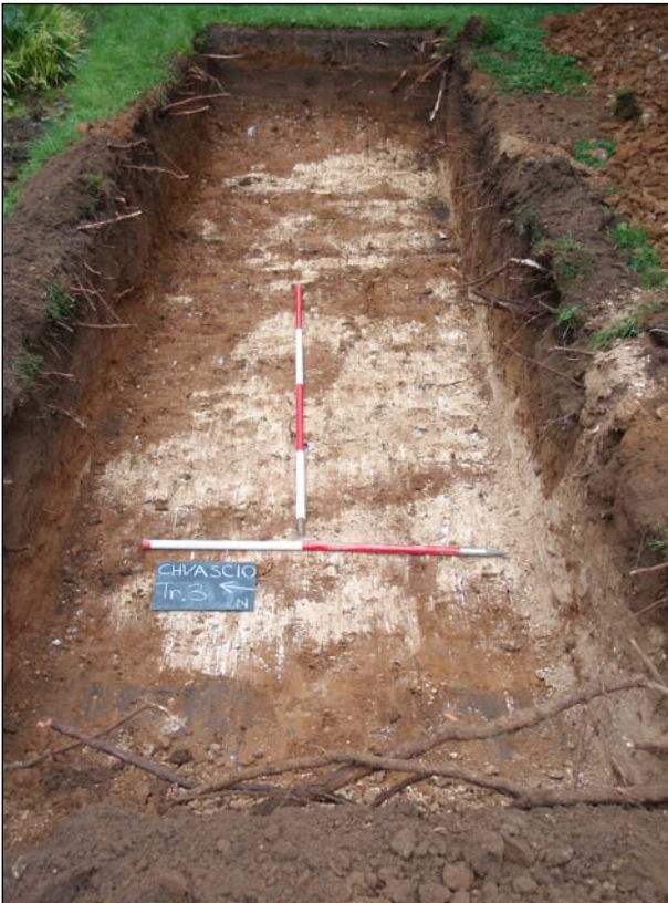
Plate 3: Trench 3