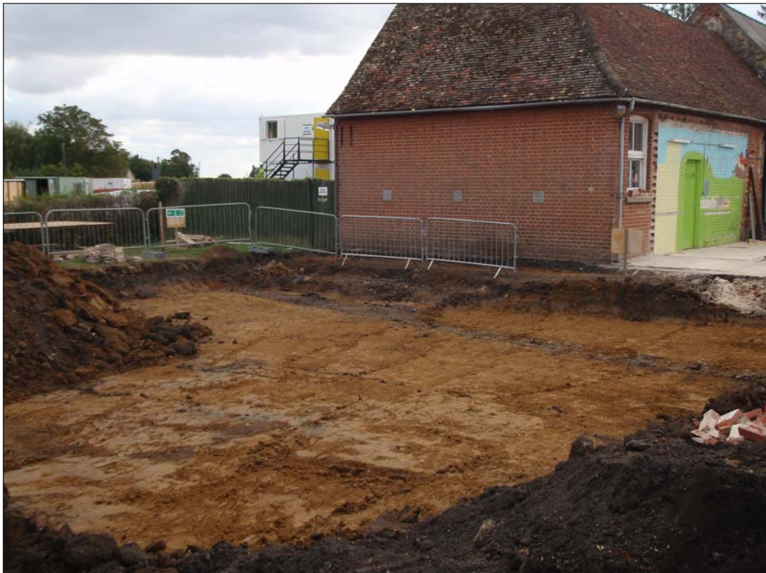
Plate 2: Area B Excavation Area