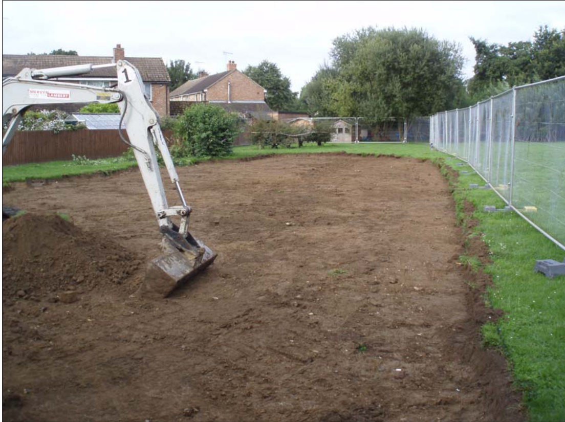
Plate 1: Area A Top soil strip