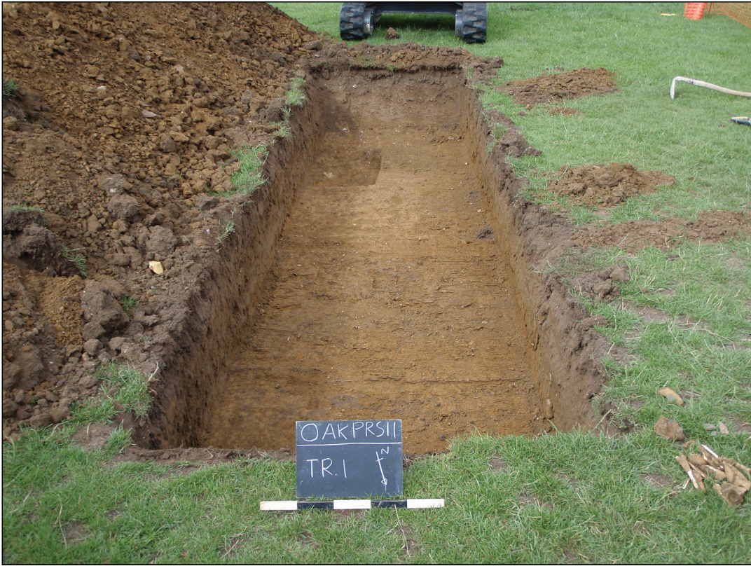
Plate 1: Trench 1 from the north east