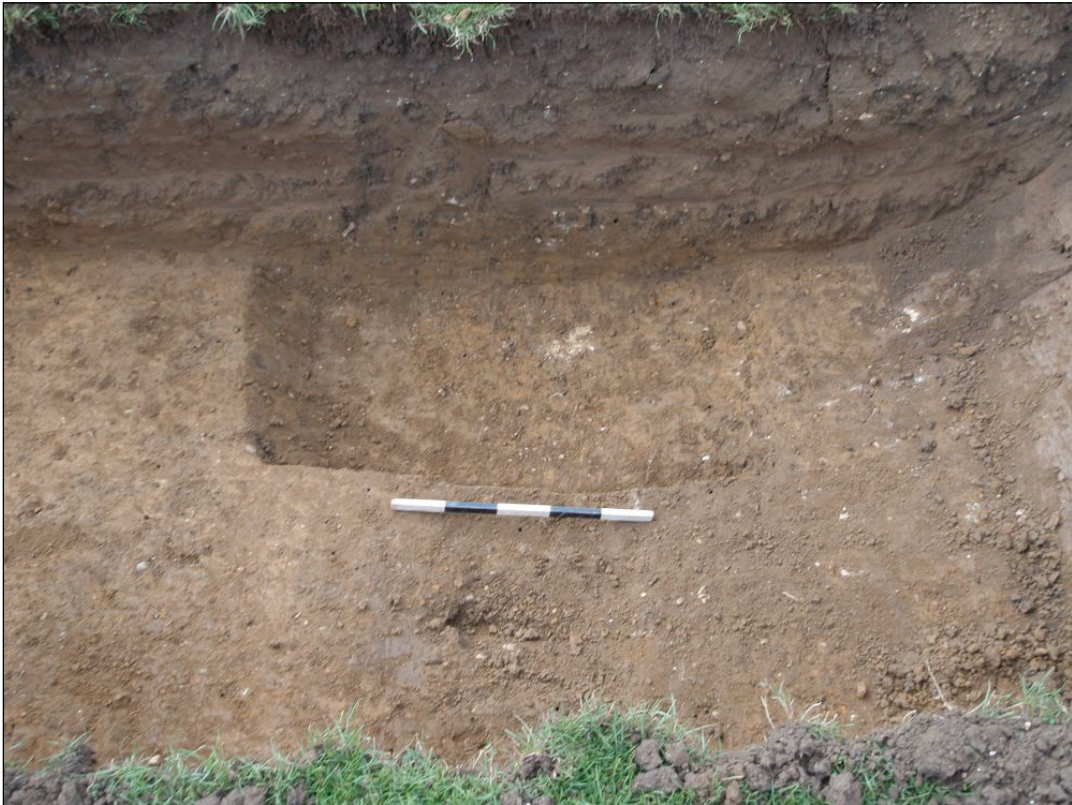
Plate 2: Furrow 6 from the north west