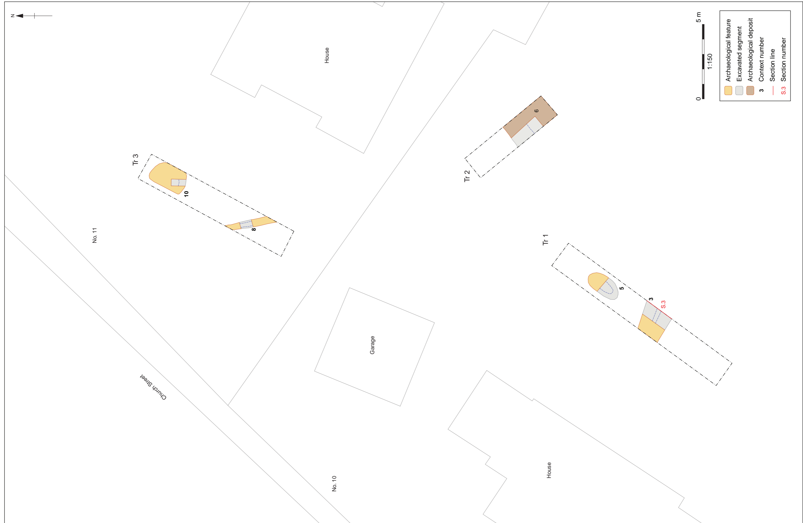
Figure 2: Trench Plan