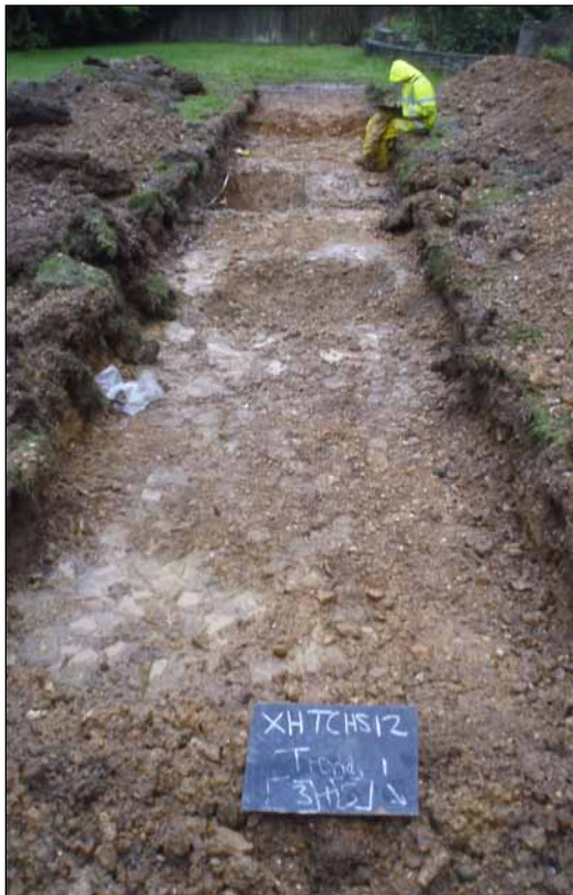
Plate 1: Trench 1