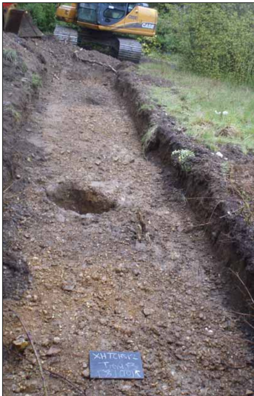
Plate 3: Trench 3