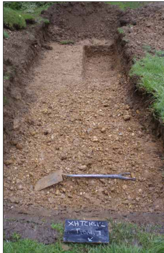
Plate 2: Trench 2