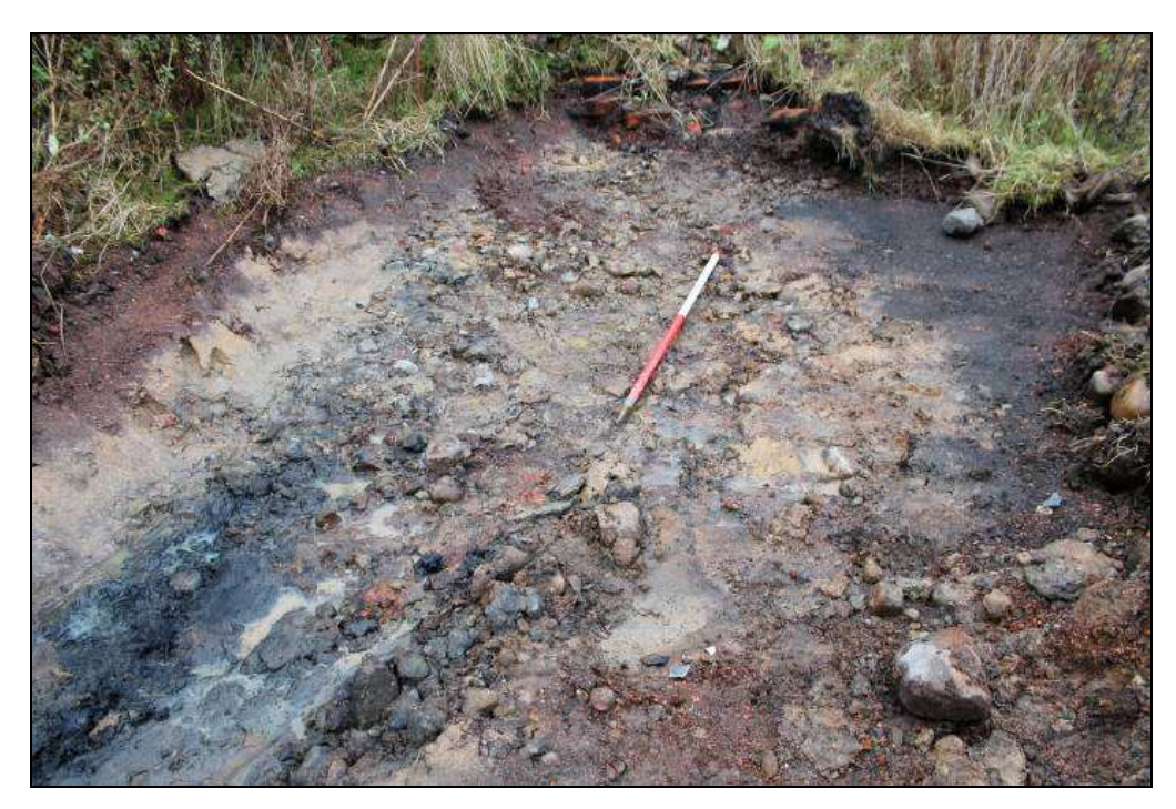
Plate 6: Metalled surface 206, looking west

3.3.4 A later feature encountered in this trench was a stretch of brick walling (203; Plate 8). The fabric of the wall comprised hand-made bricks, bonded with white lime mortar, and was one header- and one stretcher-course wide. It had been cut into natural boulder clay (207), and appeared to be the foundation for the northern wall of the cartshed/stables. As such it probably dates to midnineteenth century (Section 1.3.9).