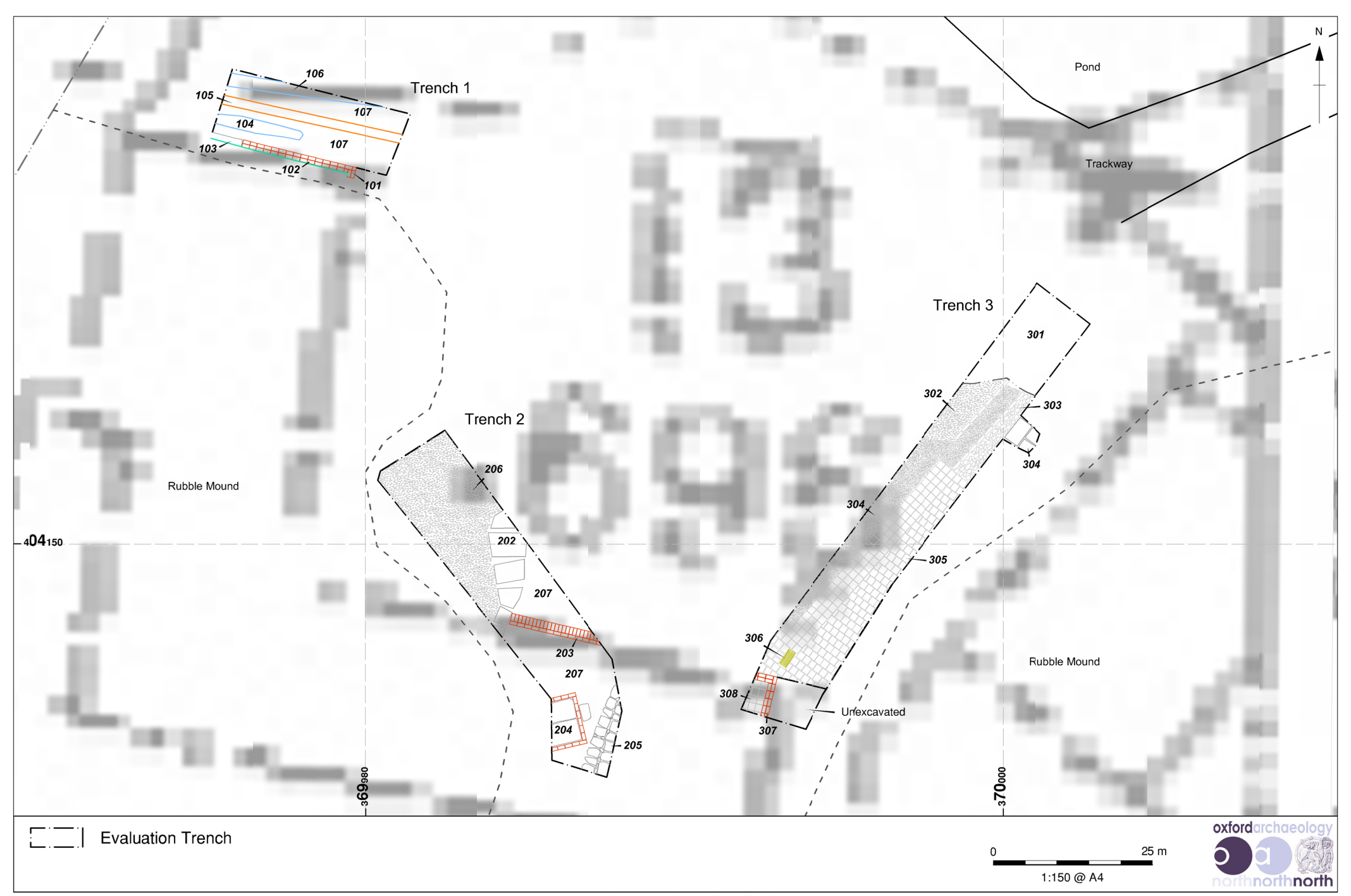
Figure 3: The evaluation trenches superimposed on the Ordnance Survey 25":1 mile map of 1893