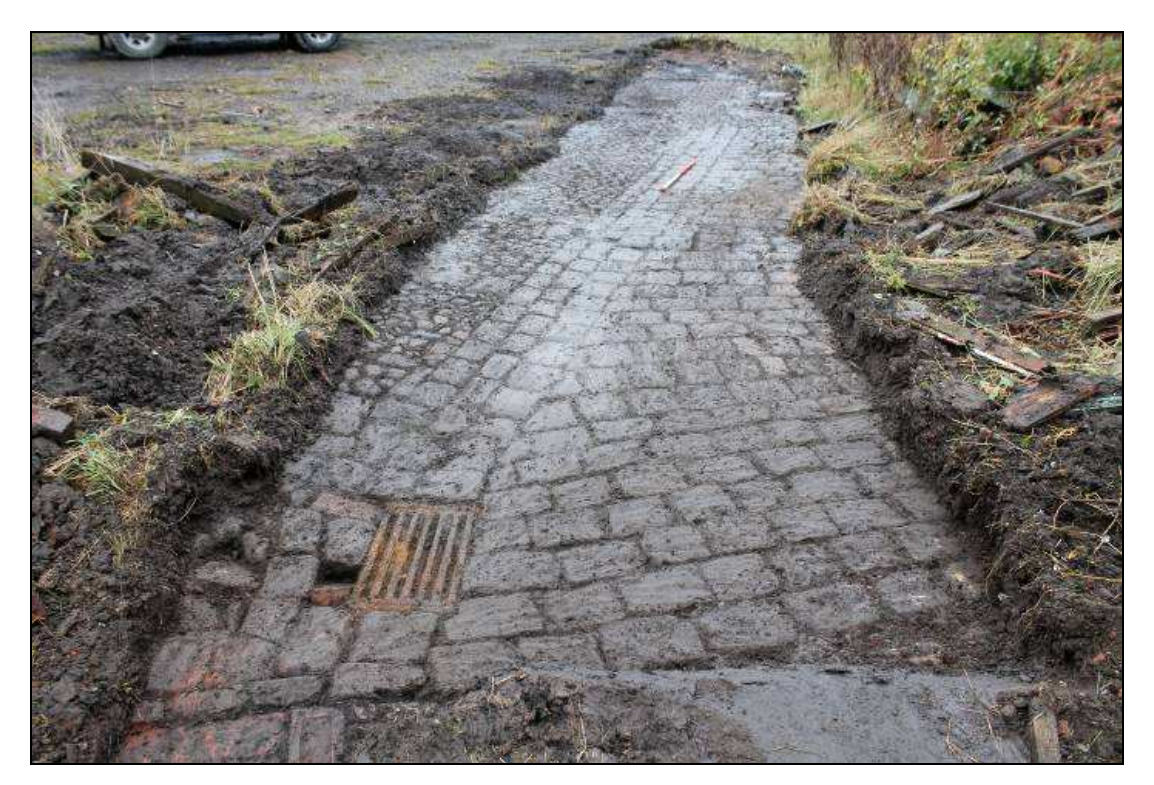
Plate 10: Set surface 305 with grid 306 at the end of the drainage run, looking north-east