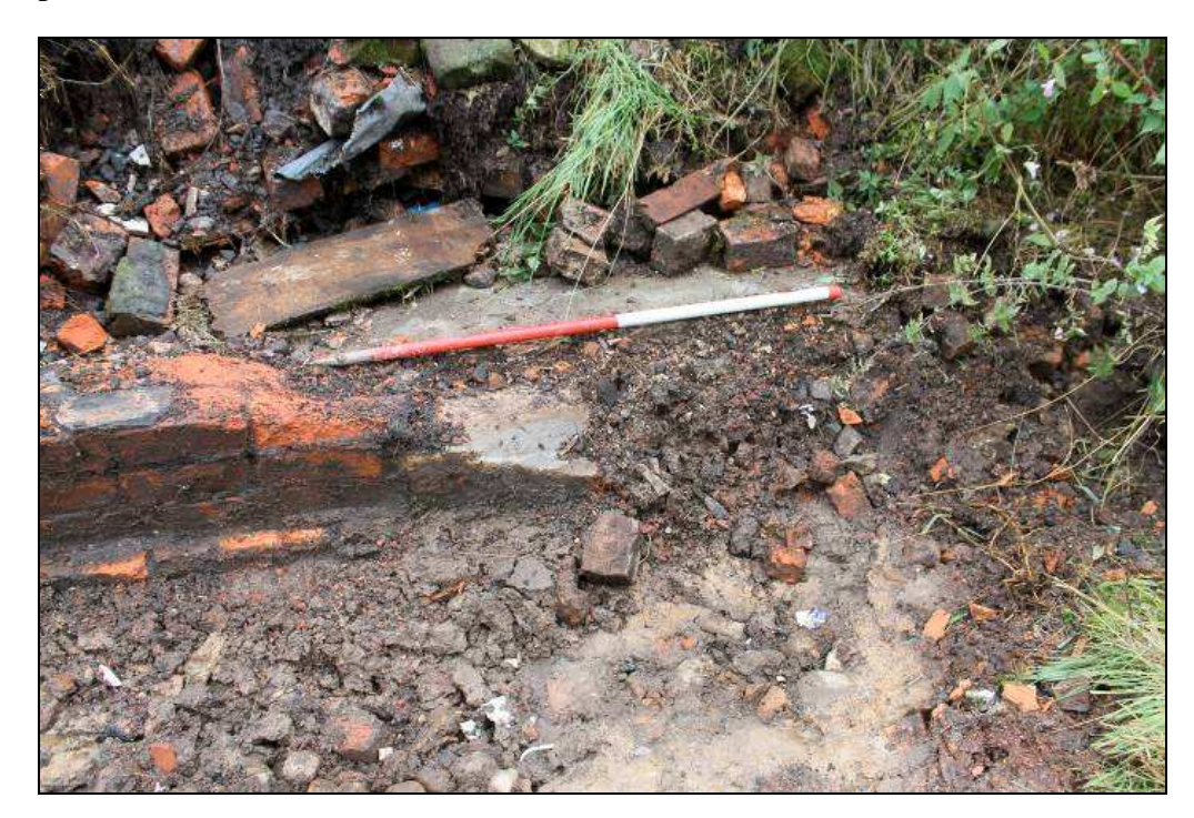
Plate 5: Stone block 103, looking south

3.2.4 This possibly formed part of a wall foundation or was perhaps a threshold, denoting the position of a doorway at the end of the later addition to the barn. To the south of these features was a concrete floor surface (102), which was positioned within the interior of the later addition to the barn.