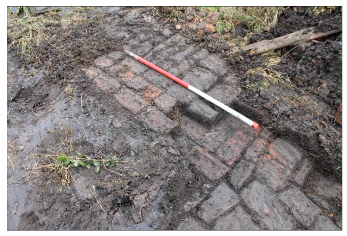
Plate 11: Brick wall 307 with set surface 308 in background, looking north-west