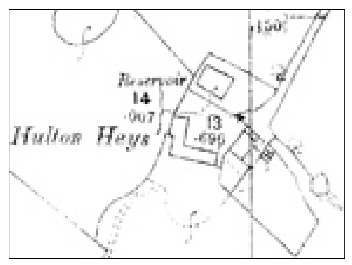
Plate 3: Hulton Heys as depicted on the 1893 OS 25":1mile map