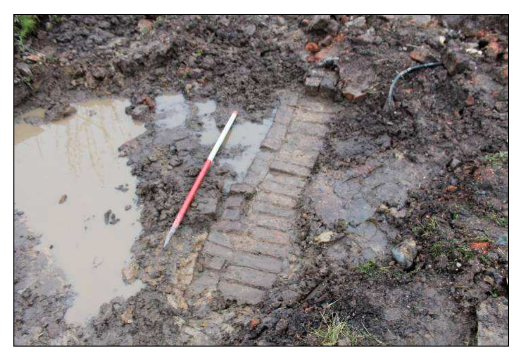
Plate 8: Hand-made brick, wall 203, looking west