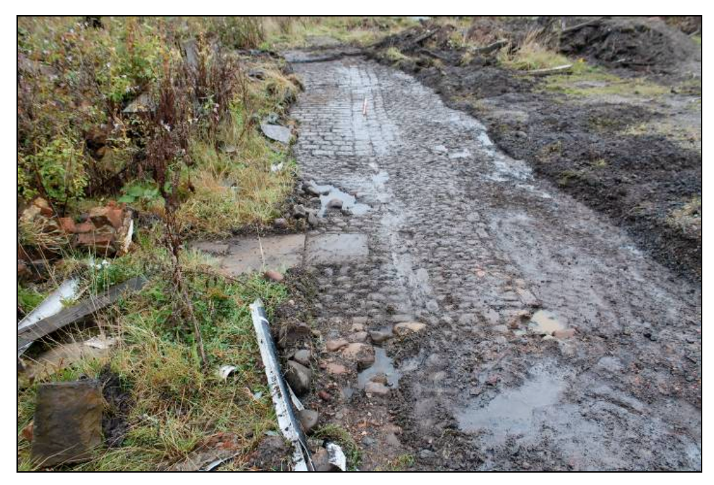
Plate 9: Cobbled surfaces 302, 303 and 304, with flags to left, looking south-west