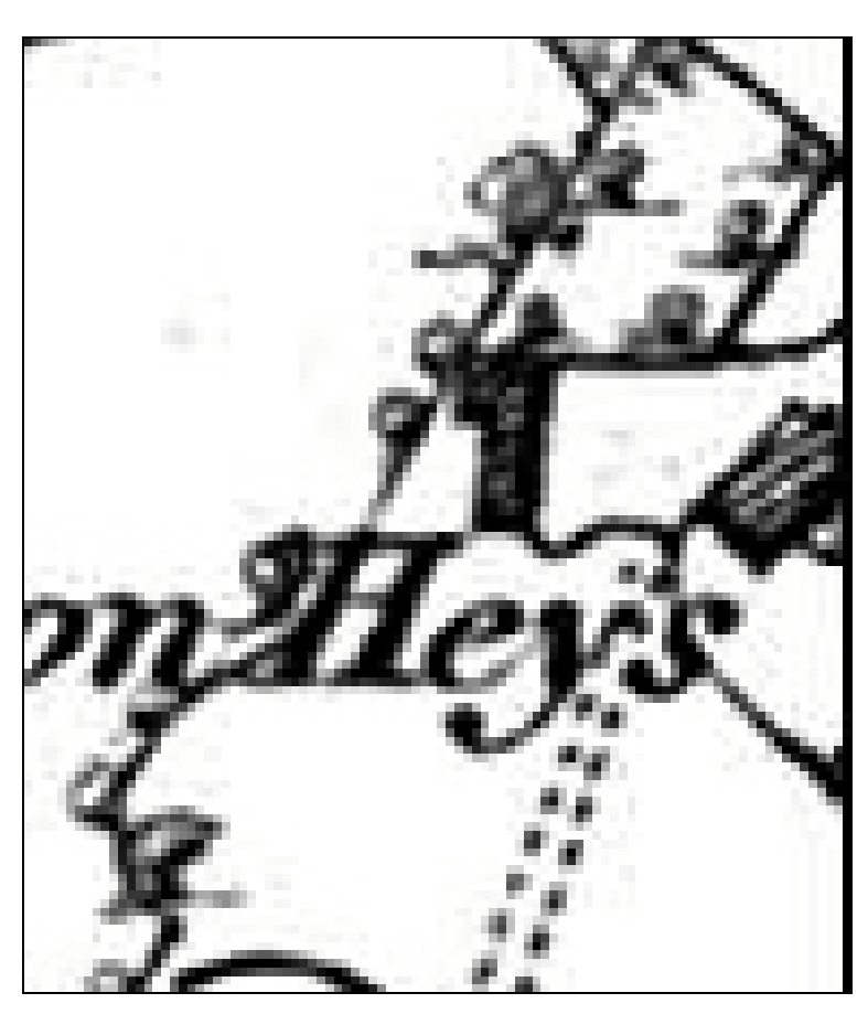
Plate 2: Hulton Heys as depicted on the 1849 OS 6":1mile map (Lancashire sheet 94)