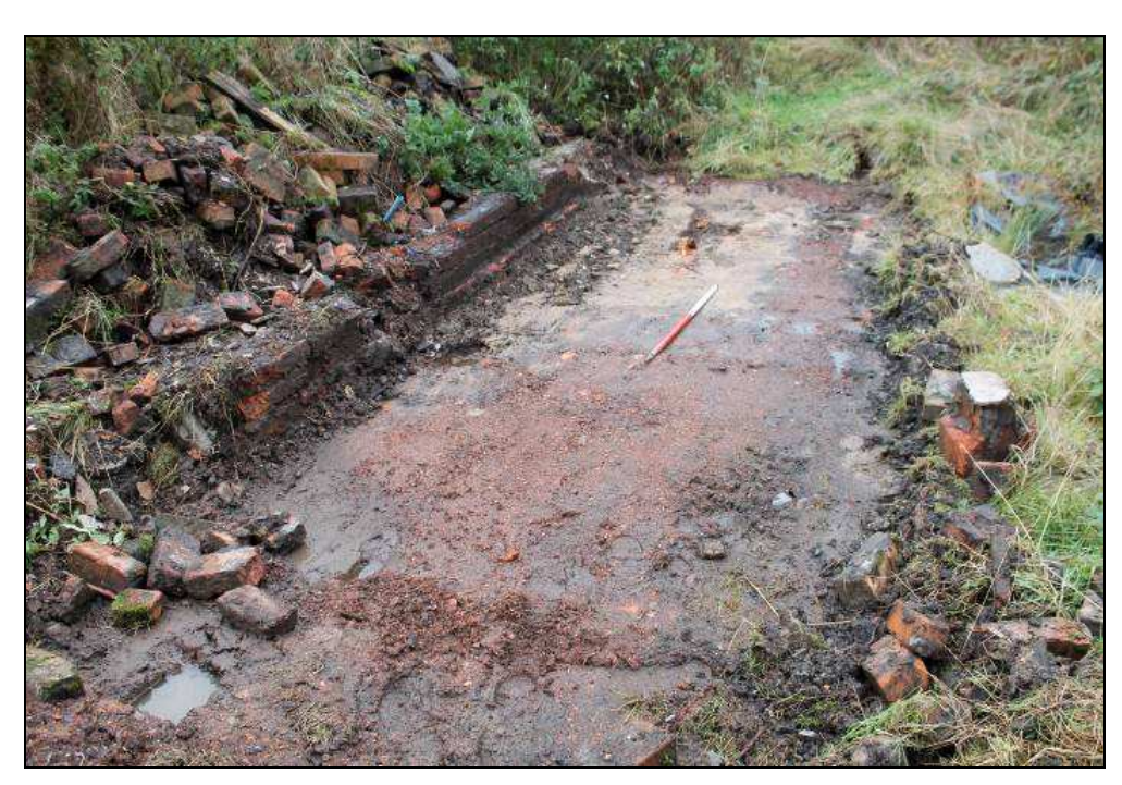
Plate 4: Trench 6 general view, wall 101 on left, looking south-west

3.2.3 The position of wall 101 indicates that it represents the northern wall of the former barn. Moreover, its location indicates that it formed the exterior wall of a later addition to the original late eighteenth-century barn, which was noted when the extant building was described in 1991 (bay 4; Section 1.3.10 ). At the western end of the wall was a stone block ( 103 ; Plate 5).