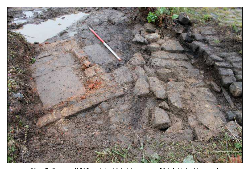
Plate 7: Stone wall 205 (right) with brick structure 204 (left), looking north