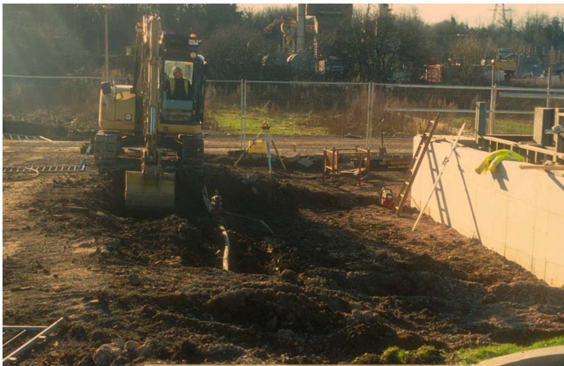
Plate 2: High pressure water pipe exposed cutting across the watching brief area