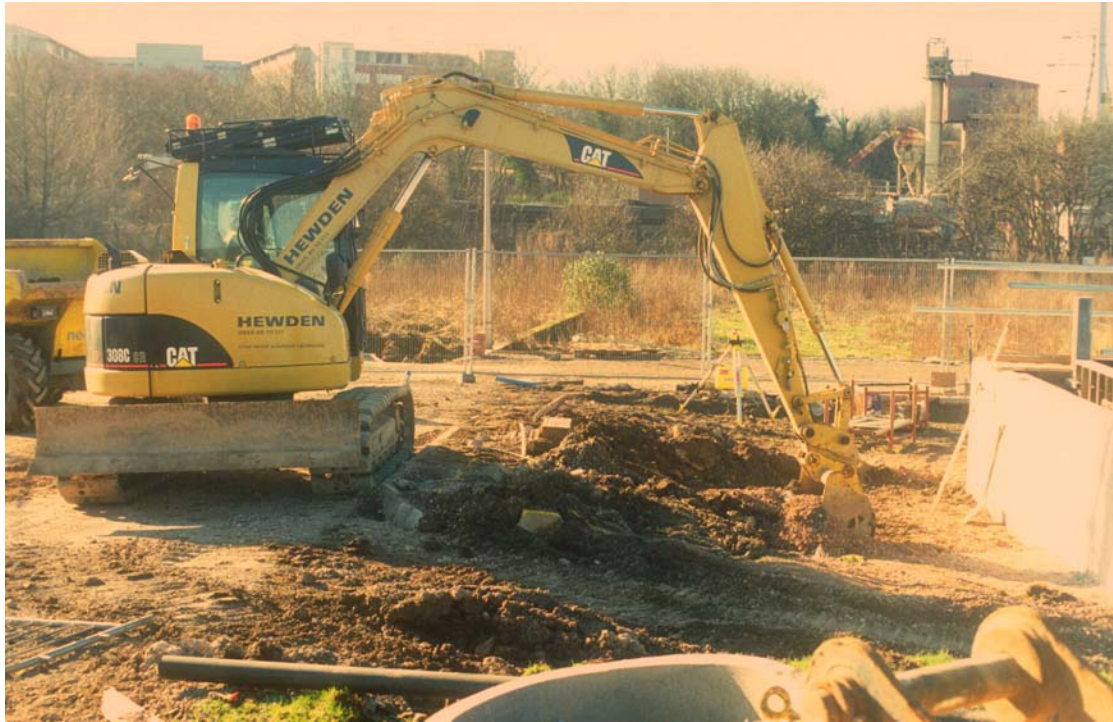
Plate 1: Working shot