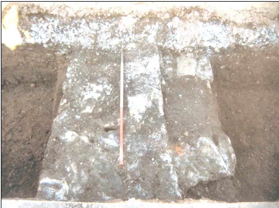
Plate 2: South-east-facing image of Trench 3, showing walls 309 , 311 and, 313