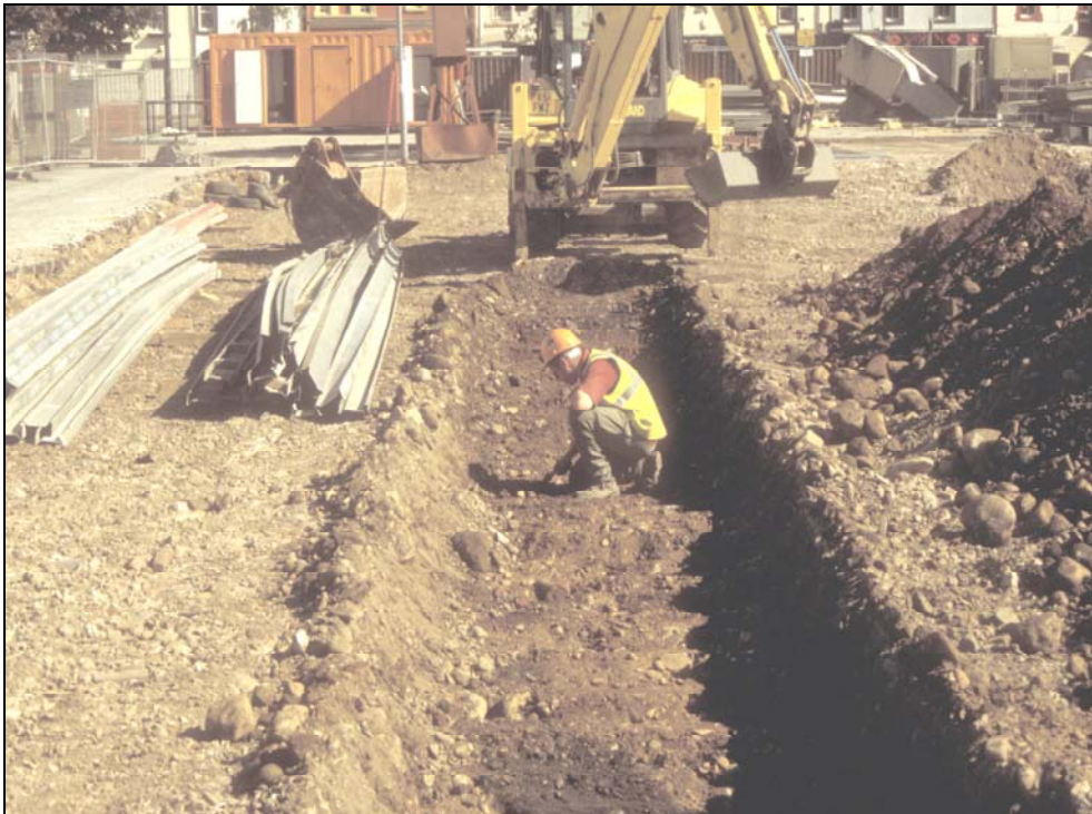
Plate 4: Working shot of excavation, Trench 9