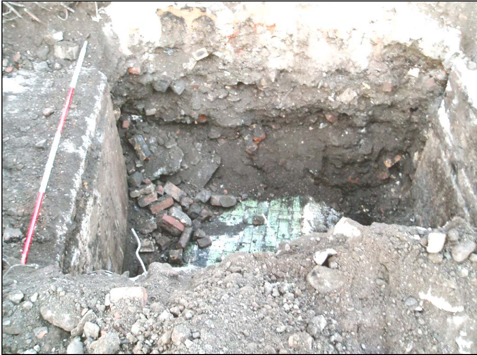
Plate 5: Trench 14, showing the green tiled floor, 1410 , between two concrete beams