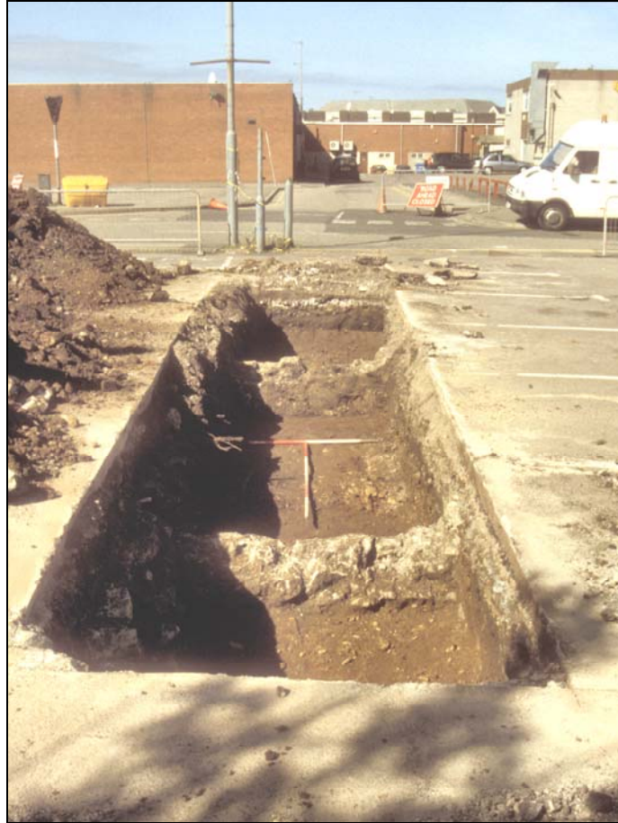
Plate 1: South-west-facing view of Trench 2, showing walls 206 and 208