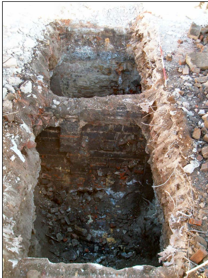
Plate 6: Trench 14, facing east, showing wall 1401