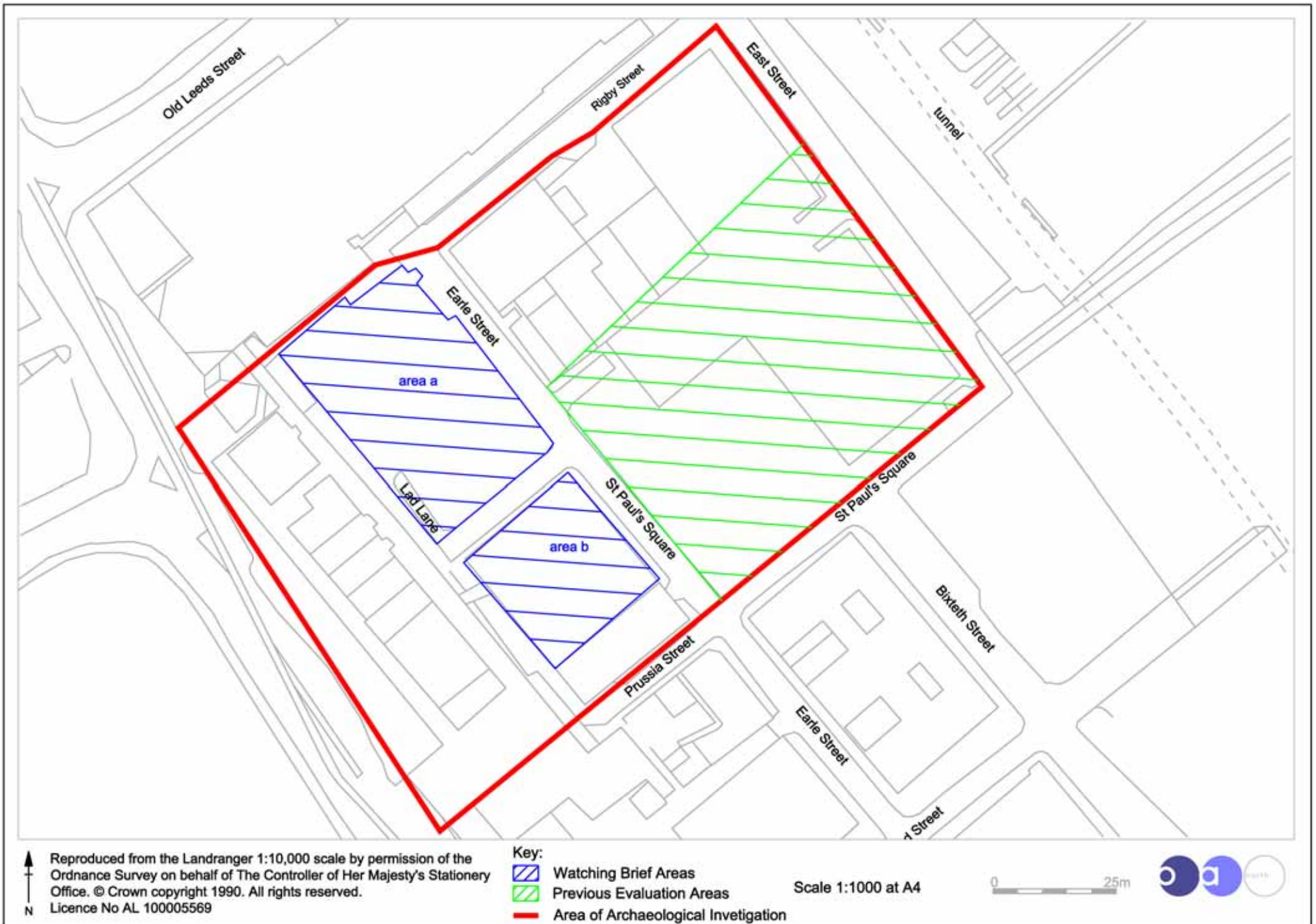
Figure 2: Watching Brief Location Plan