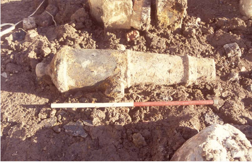
Plate 1: The cannon found during groundworks in Area B, with the iron stand in the background