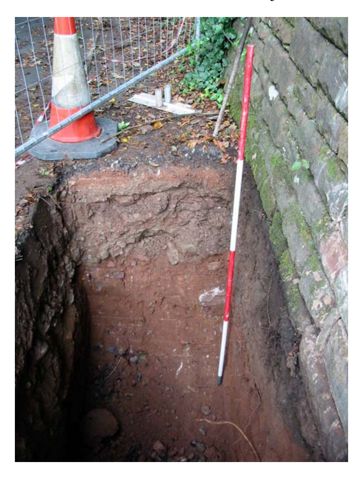
Plate 6: East-facing section of soakaway