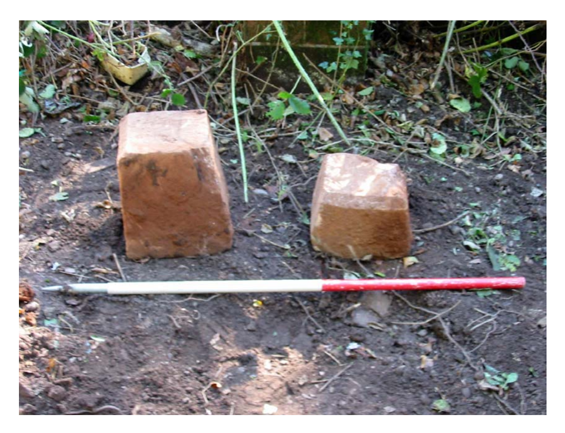
Plate 5: Dressed stone 108 and 109, found adjacent to wall 103