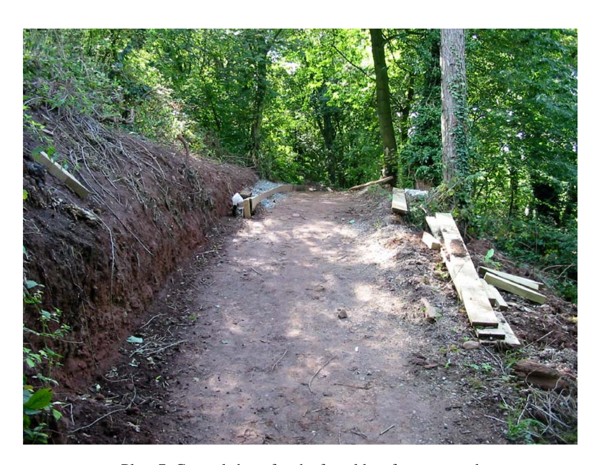
Plate 7: General shot of path after old surface removed