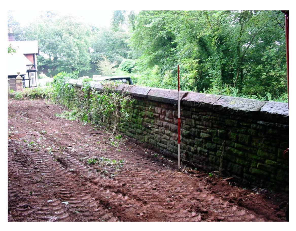
Plate 1: General shot of area on the north side of the boundary wall