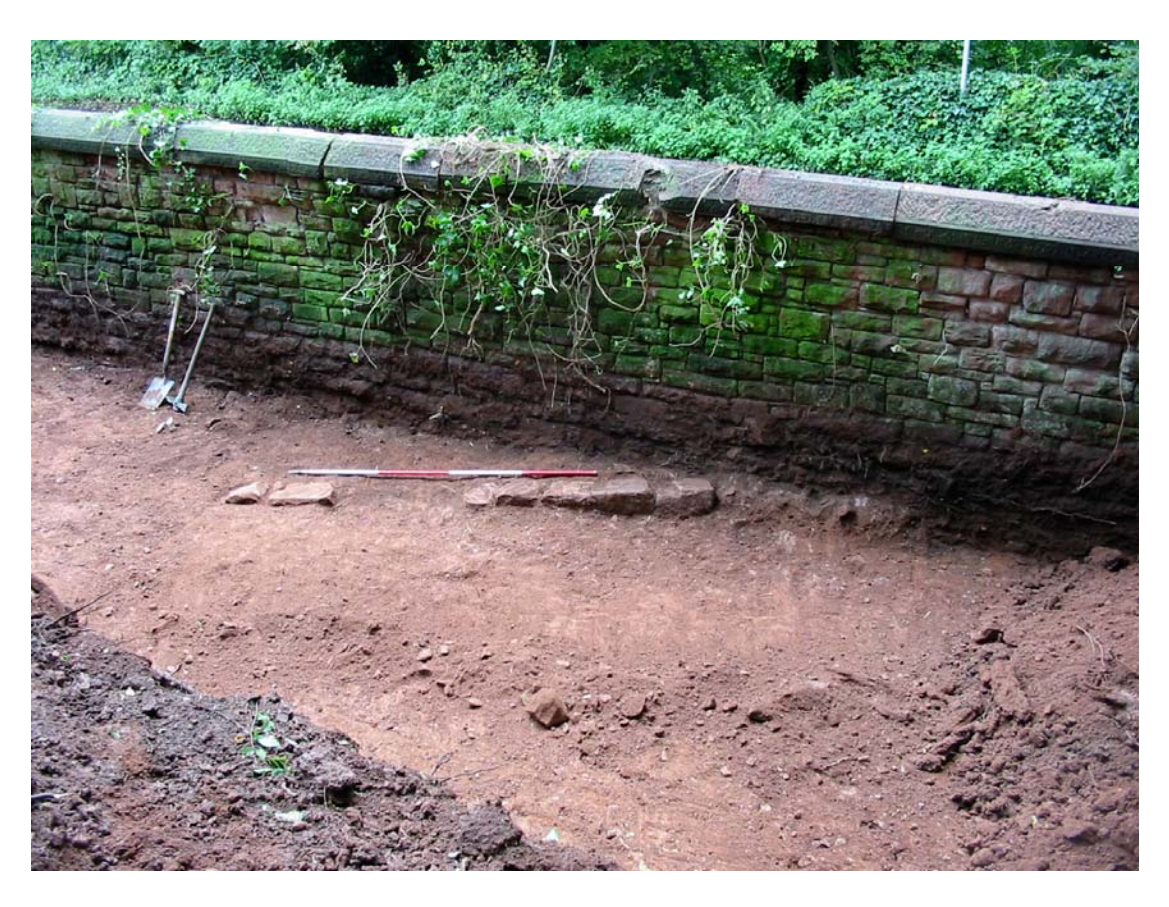
Plate 3: General shot of Sandstone wall 102