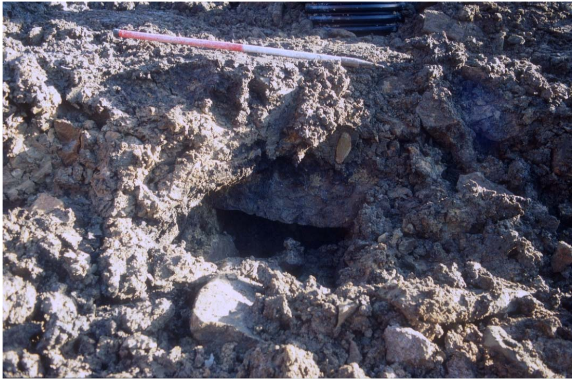
Plate 1: Stone-lined culvert, facing east