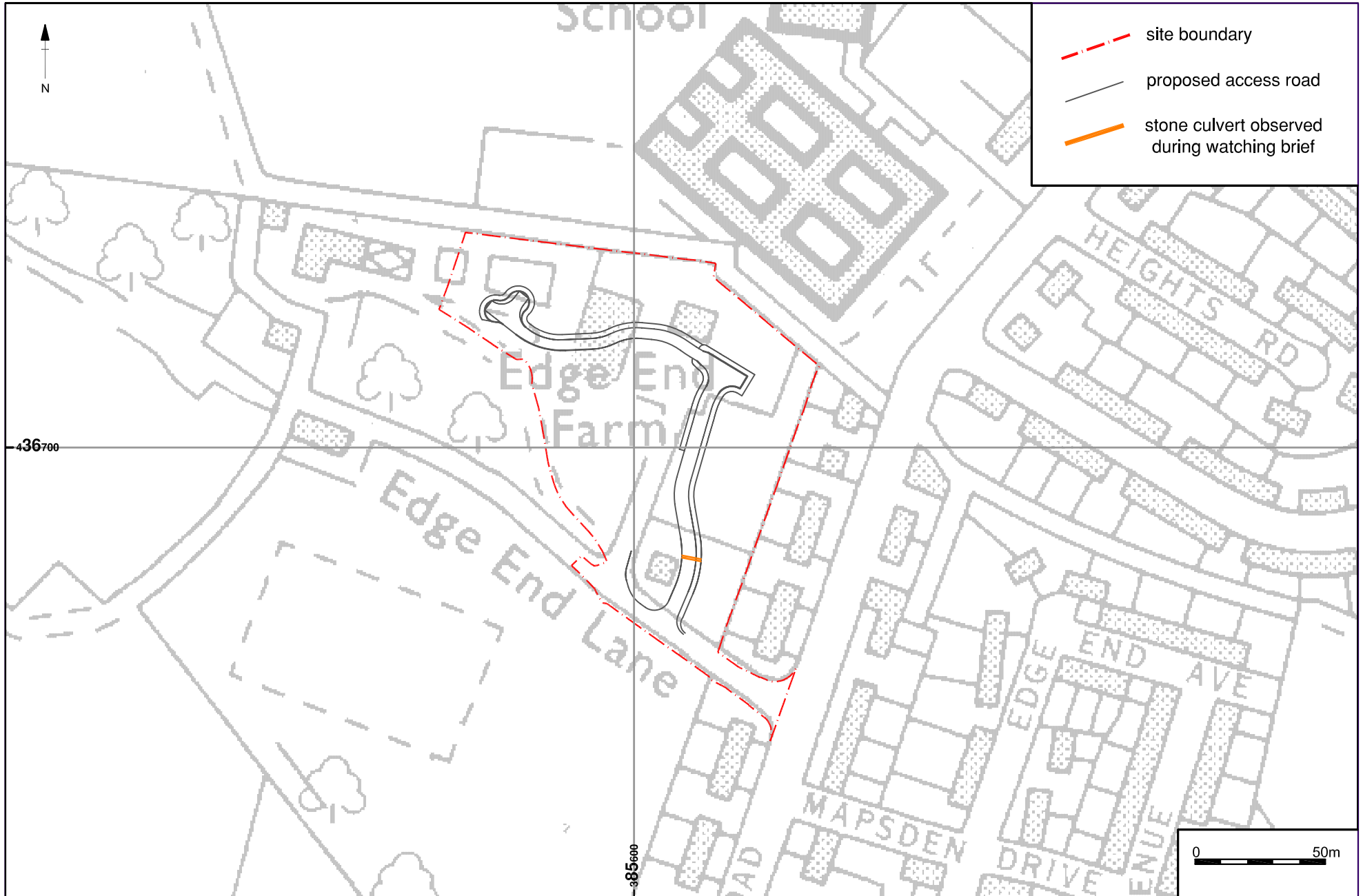
Figure 2: Trench location plan