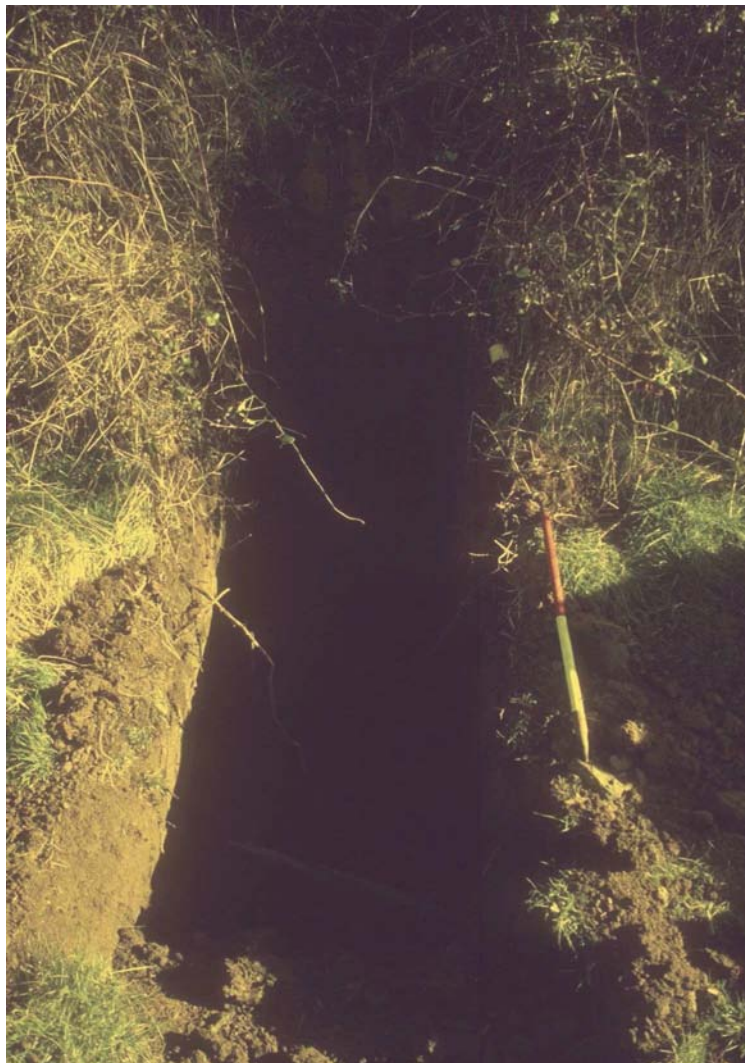
Plate 2: Test Pit 2, Post-Excavation