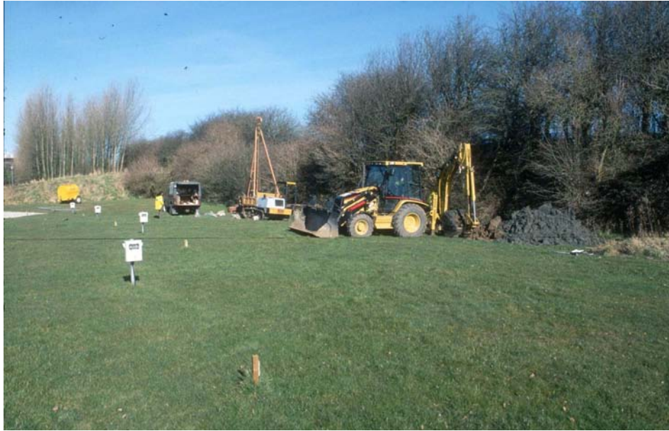
Plate 1: Working Shot