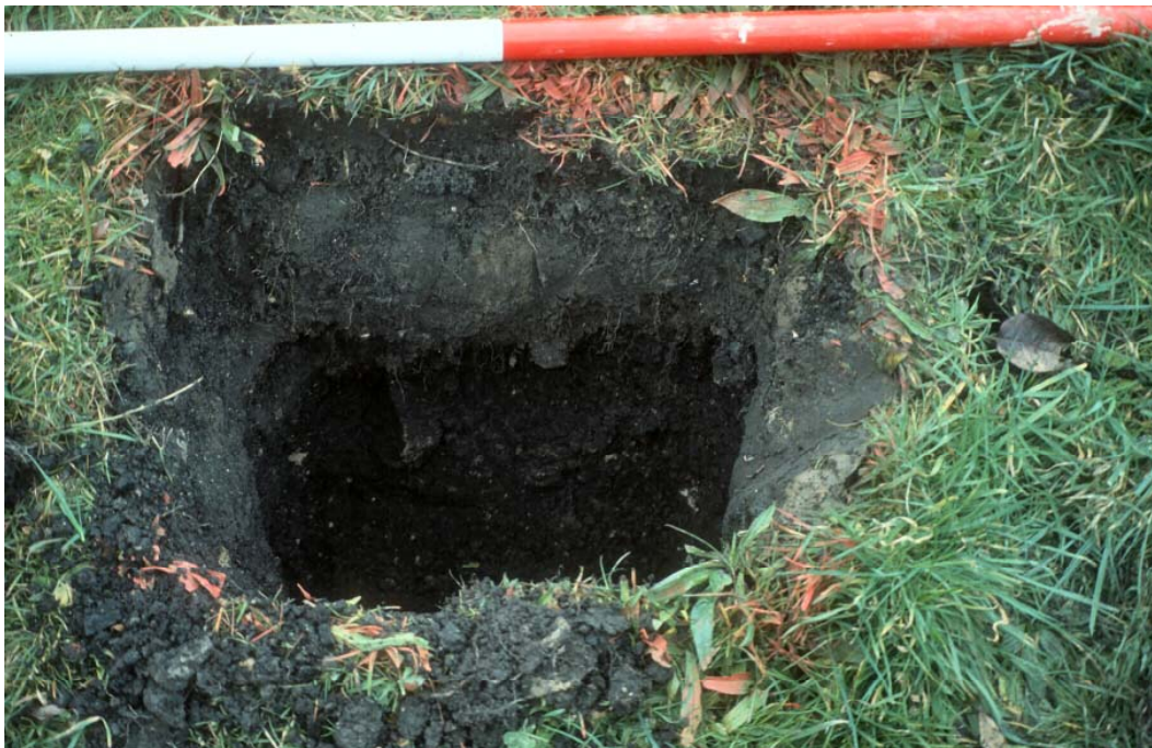
Plate 2: Interpretation panel in position, facing north