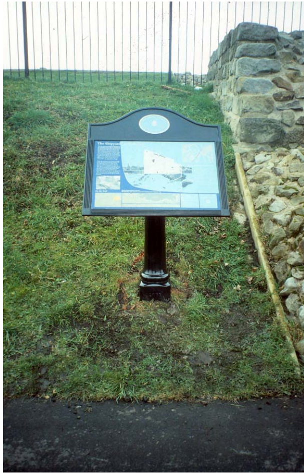
Plate 1: Post-hole, facing north