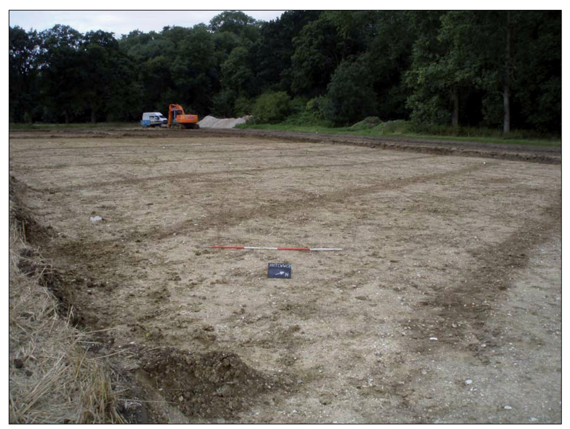
Plate 2: Cultivation Beds, facing south west