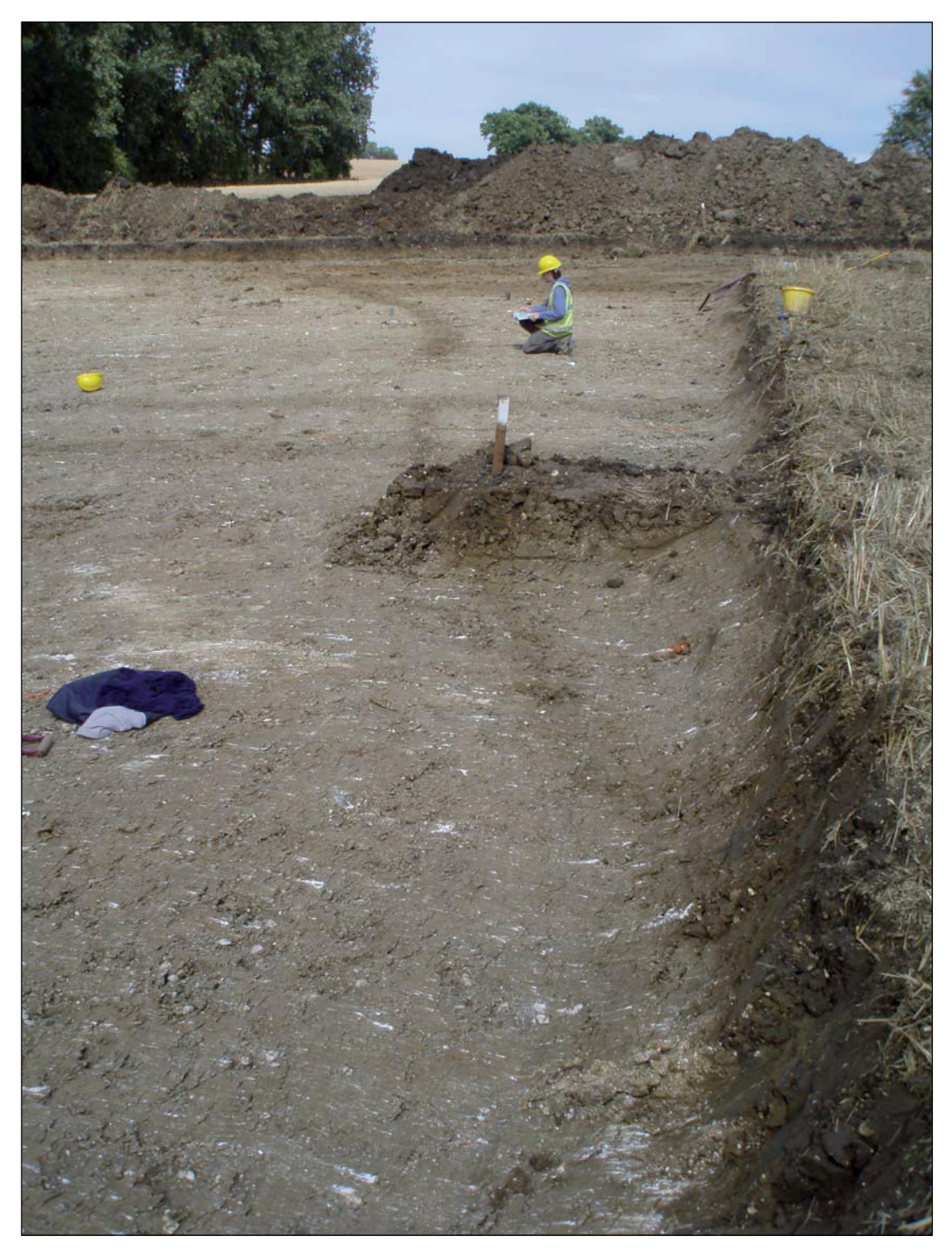
Plate 1: Segmented Ditch, facing north