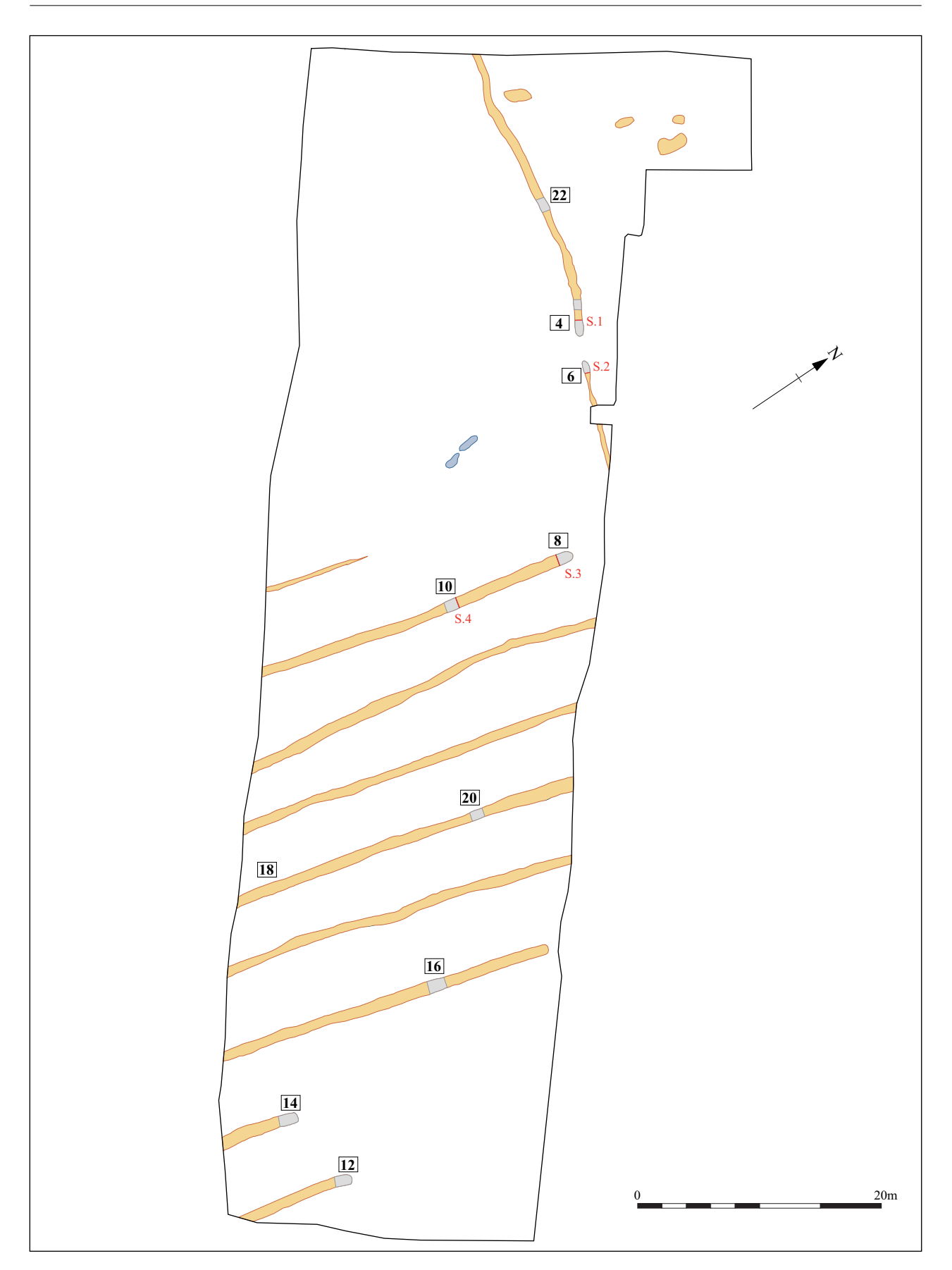
Figure 2: Excavation Plan