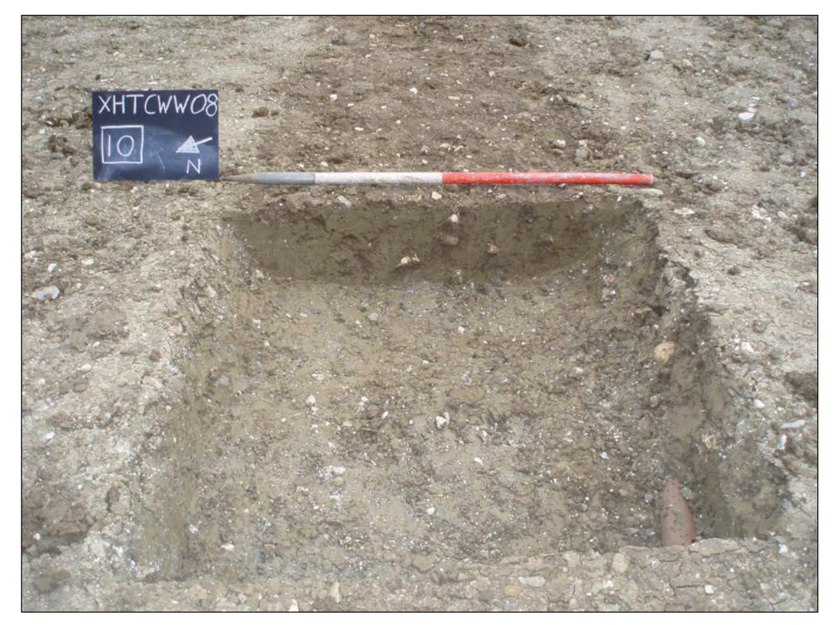
Plate 3: Section through Cultivation Bed (10)