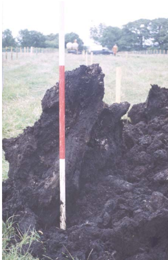
Plate 2: Tree-bole from within peat layer