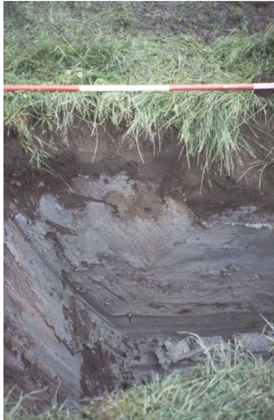
Plate 3: Pit 7, north-west-facing section showing clay only, no peat