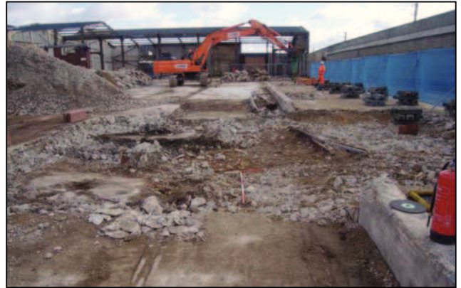
Plate 4: General View to East with Pier 3 in foreground