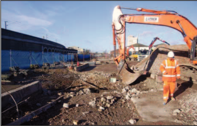
Plate 1: General View to west with Pier 3