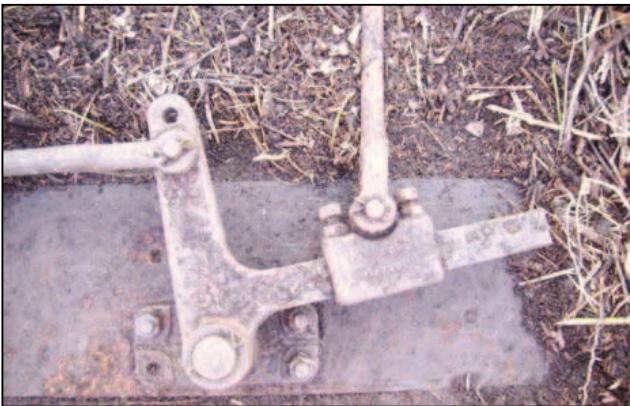
Plate Plate 7: Point operating mechanics on land adjacent to Leemark