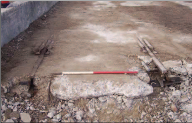
Plate 5: Section across railway track at Pier