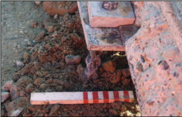
Plate 3: Rail with steel base plate and clamp