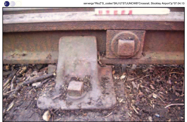
Plate 6: S-facing sample section in Pier 3