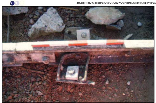
Plate 2: Rail fastening system