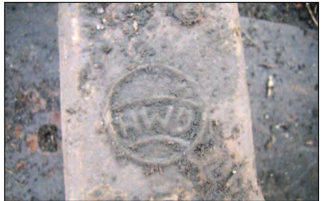
Plate 8: Detail of point operating mechanism showing hallmark