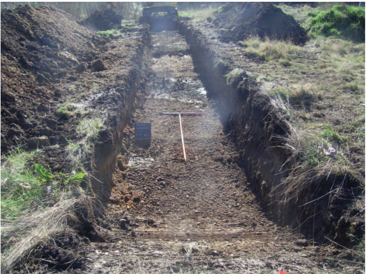
Plate 2: Trench 3 showing modern ditch