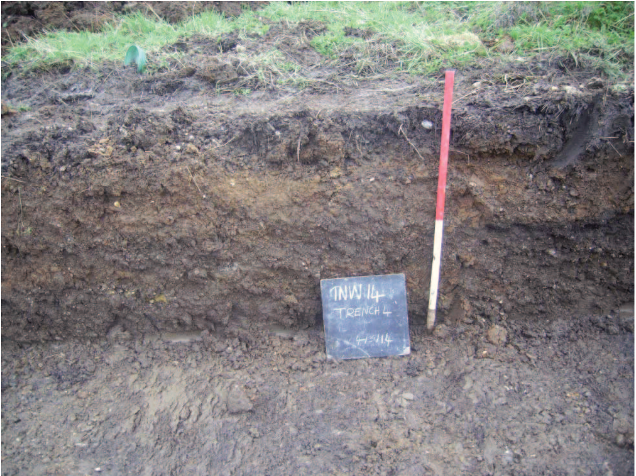
Plate 3: Representative section of Trench 4