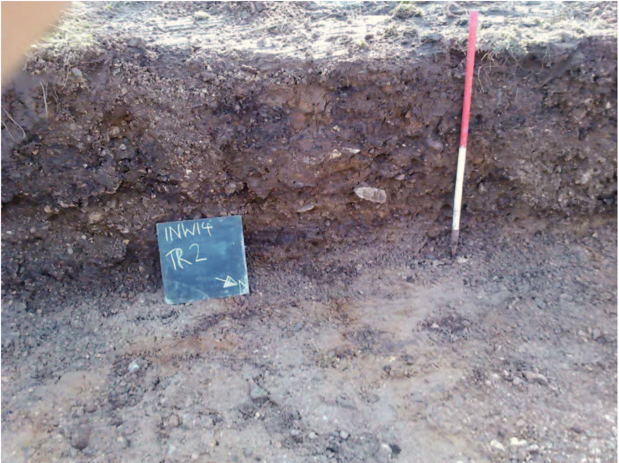
Plate 1: Representative section of Trench 2