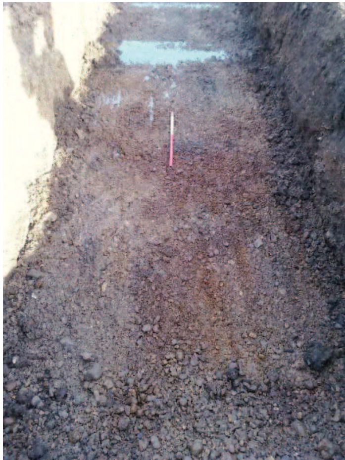
Plate 4: Trench 8 showing gravel natural