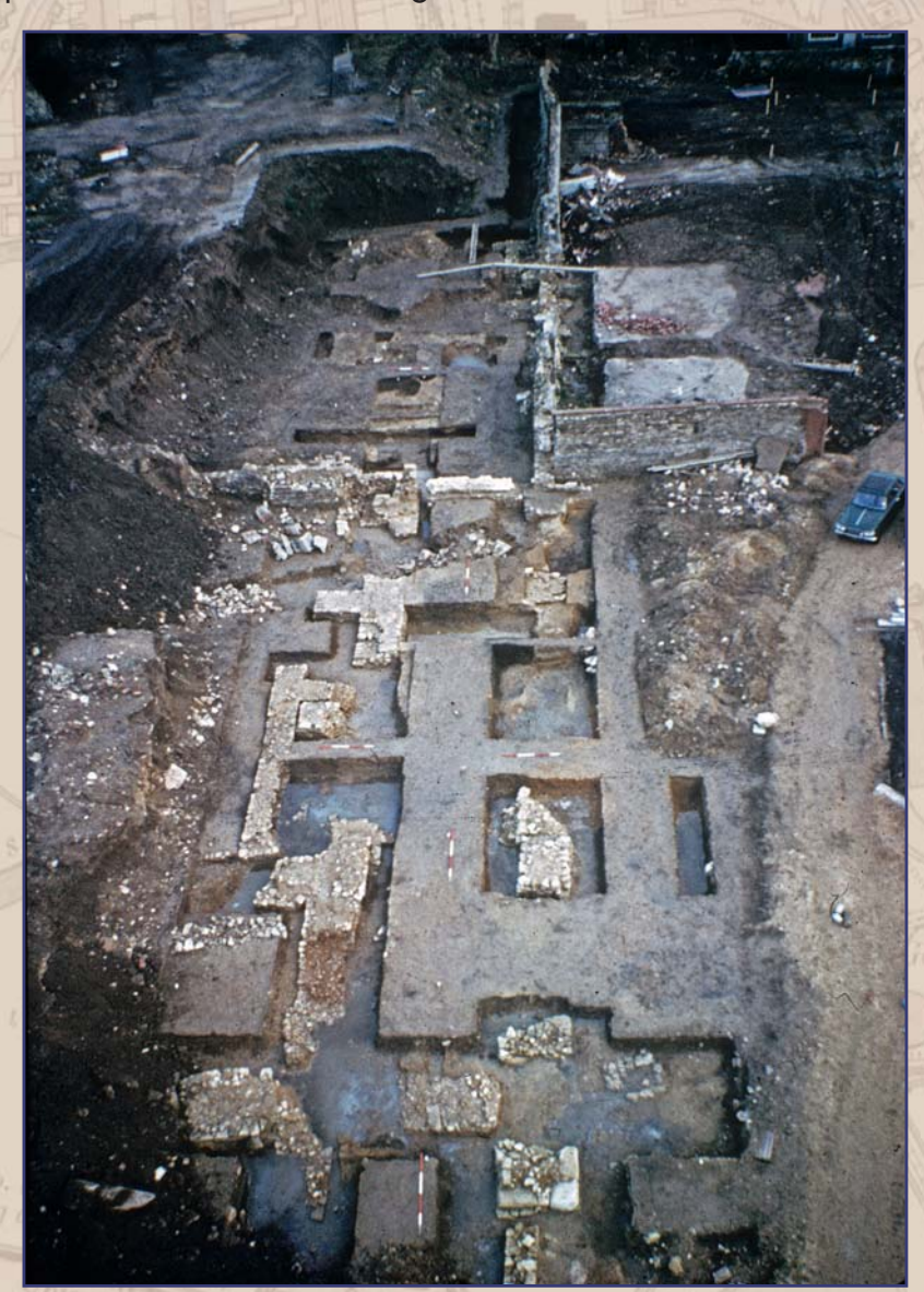
View of the excavation

The first archaeological excavations of the Greyfriars were undertaken between 1967 - 1972, before the construction of the Westgate Shopping Centre. These uncovered the plan of the Church and the different phases of its construction over a period of nearly 300 years from the 1240's. The church's eventual plan was T-shaped plan which provided the largest possible preaching area. Pieces of stained and painted glass, decorated floor tiles and a small statuette, presumably of a saint, were found which give a glimpse of what the church might have looked like. Burials were