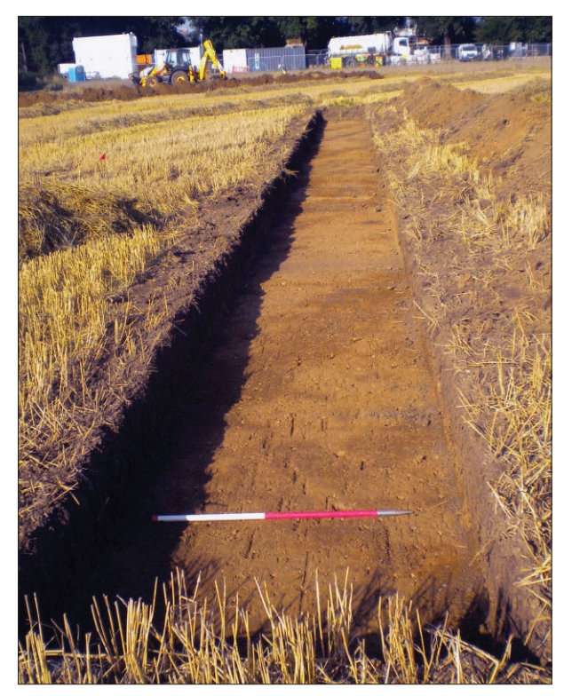
Plate 4: Trench 4, looking west