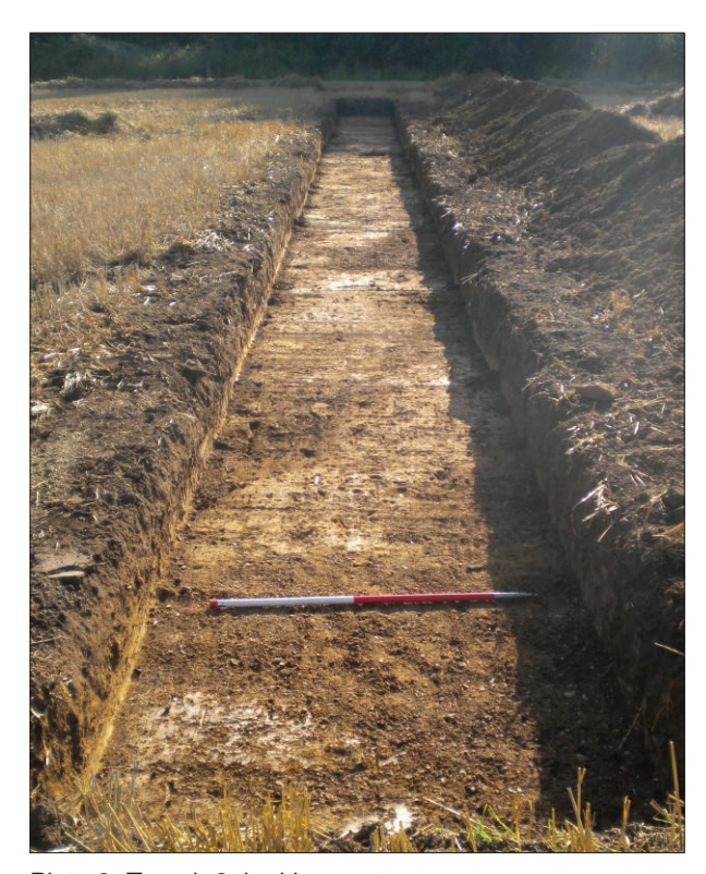
Plate 8: Trench 8, looking east