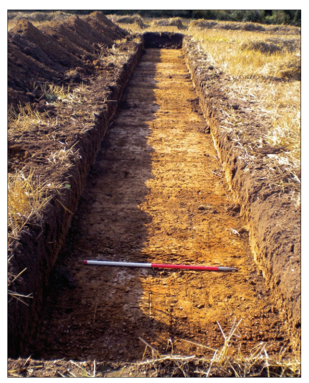
Plate 5: Trench 5, looking south