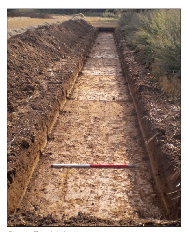
Plate 7: Trench 7, looking east