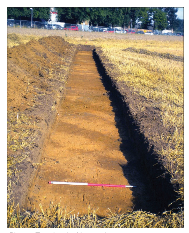
Plate 2: Trench 2, looking north-west