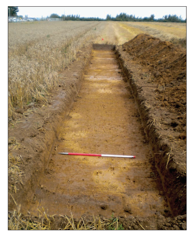
Plate 1: Trench 1, looking north