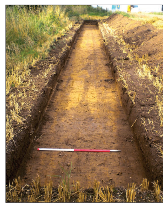
Plate 3: Trench 3, looking west