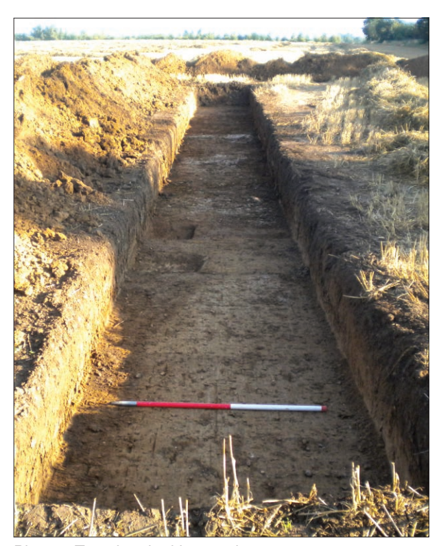
Plate 9: Trench 9, looking north