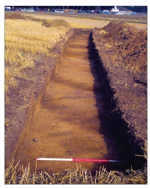
Plate 6: Trench 6, looking north-west