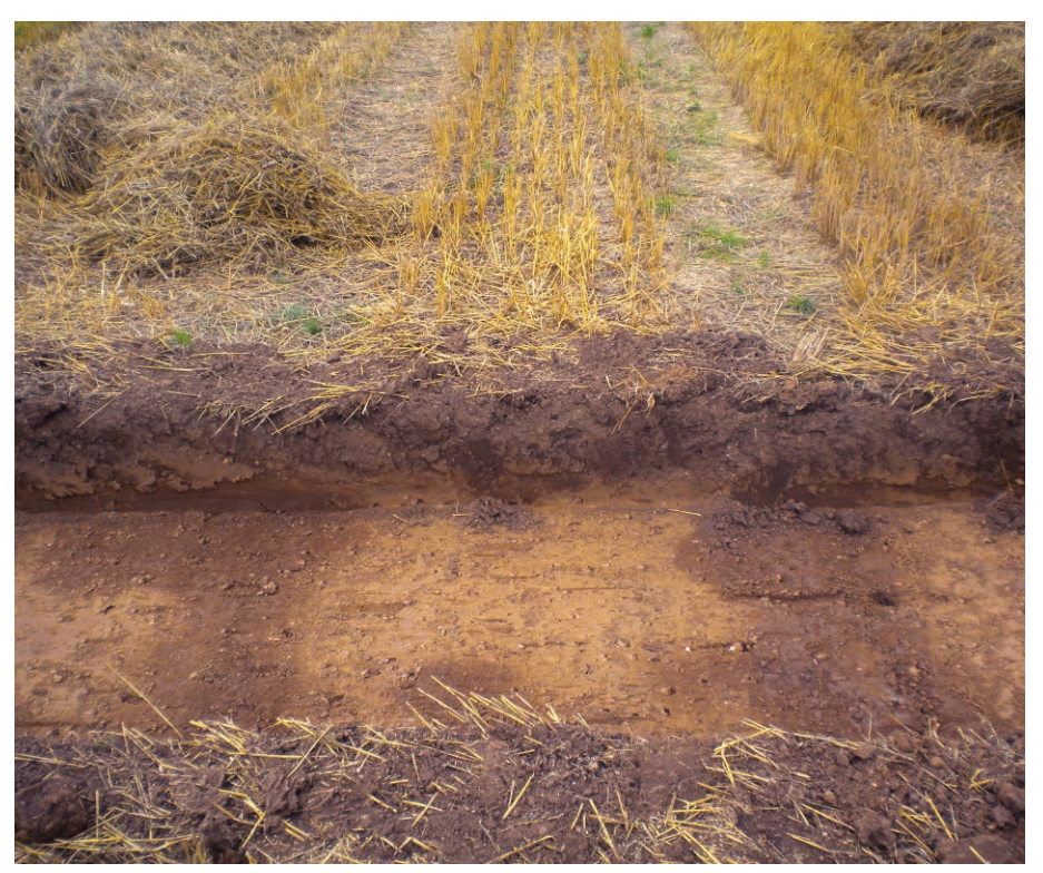
Plate 10: Tramlines through Trench 2, looking east