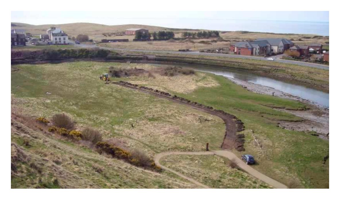
Plate 1: Topsoil stripping in progress