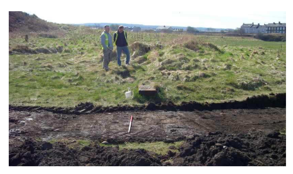
Plate 2: The central section of the proposed cycle path following topsoil stripping