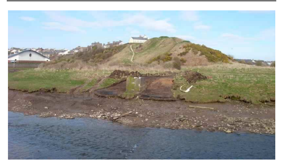
Plate 3: Topsoil stripping adjacent to the River Ellen