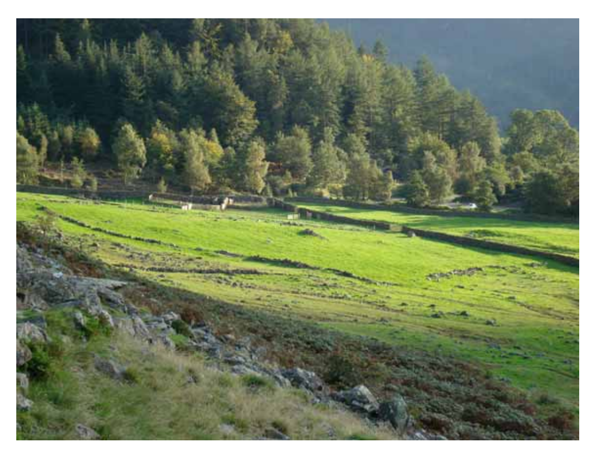
Plate 2: Site 10, looking south