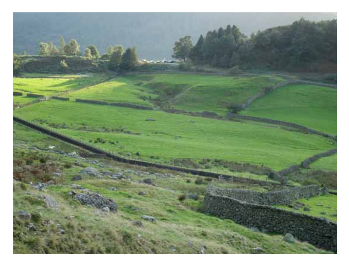
Plate 1: Site 03, looking south-west