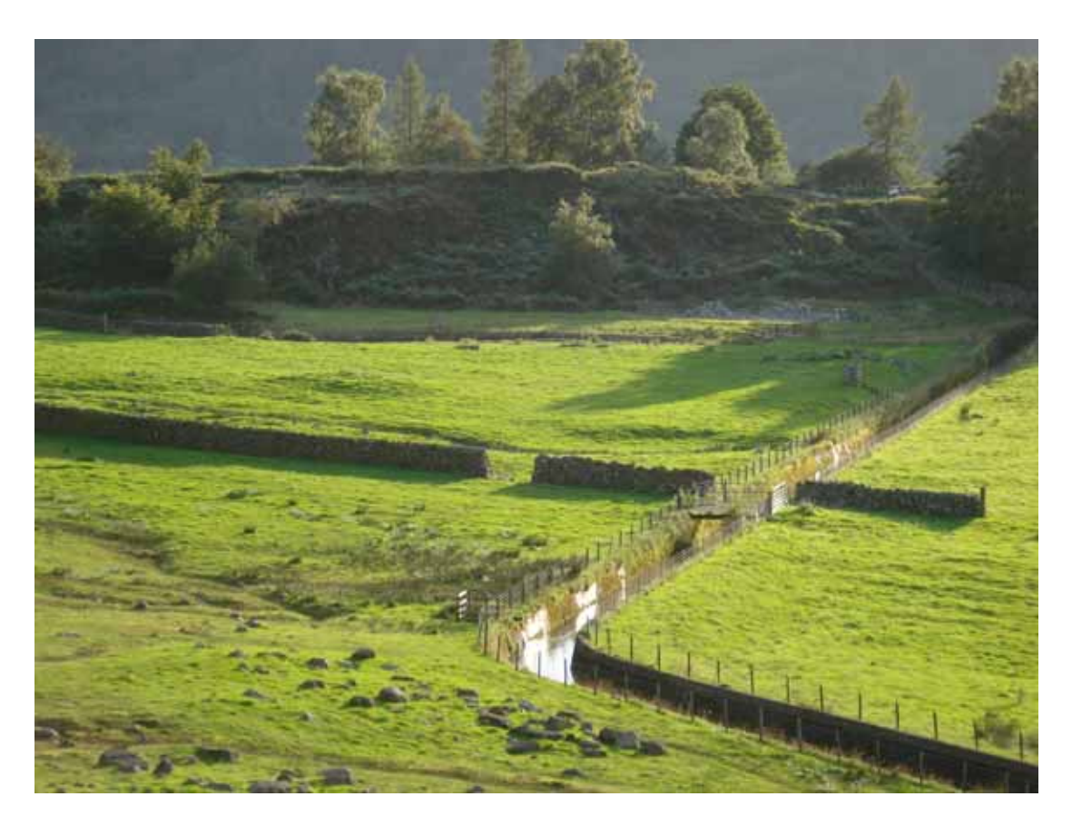
Plate 3: Leat (Site 07) with cairn (Site 09) to the south, looking west