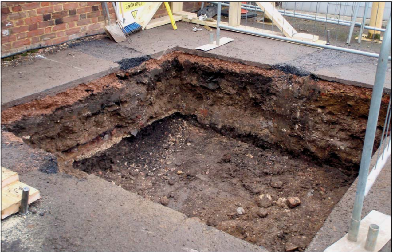
Plate 1: Pumping station trench showing modern make up