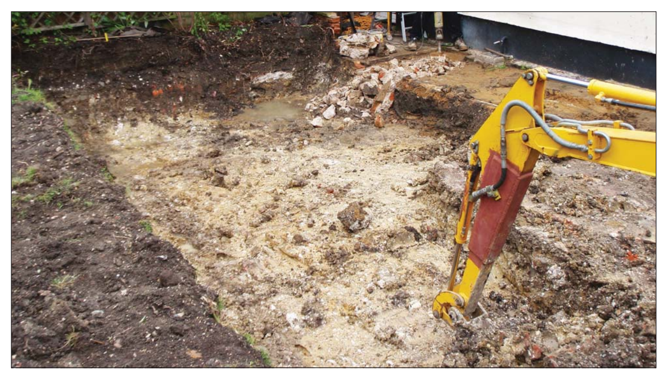
Plate 1: General shot of excavation