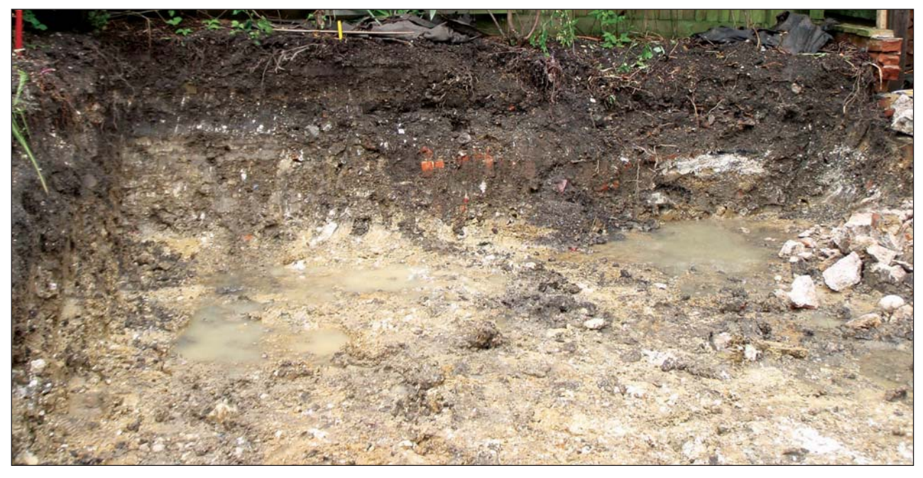
Plate 2: South-east facing soil profile