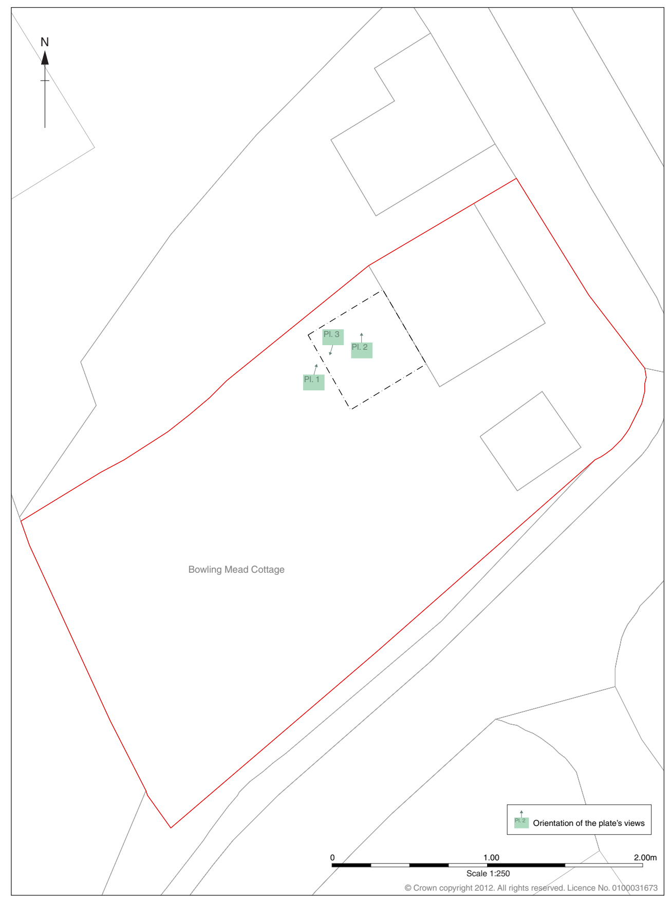
Figure 2: Plan of the sondage (black) with the development area outlined (red)