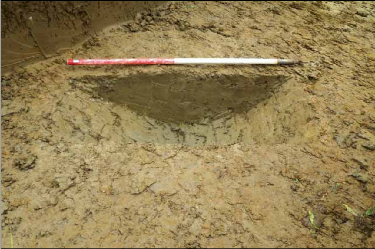
Plate 1: Ditch 4, looking east