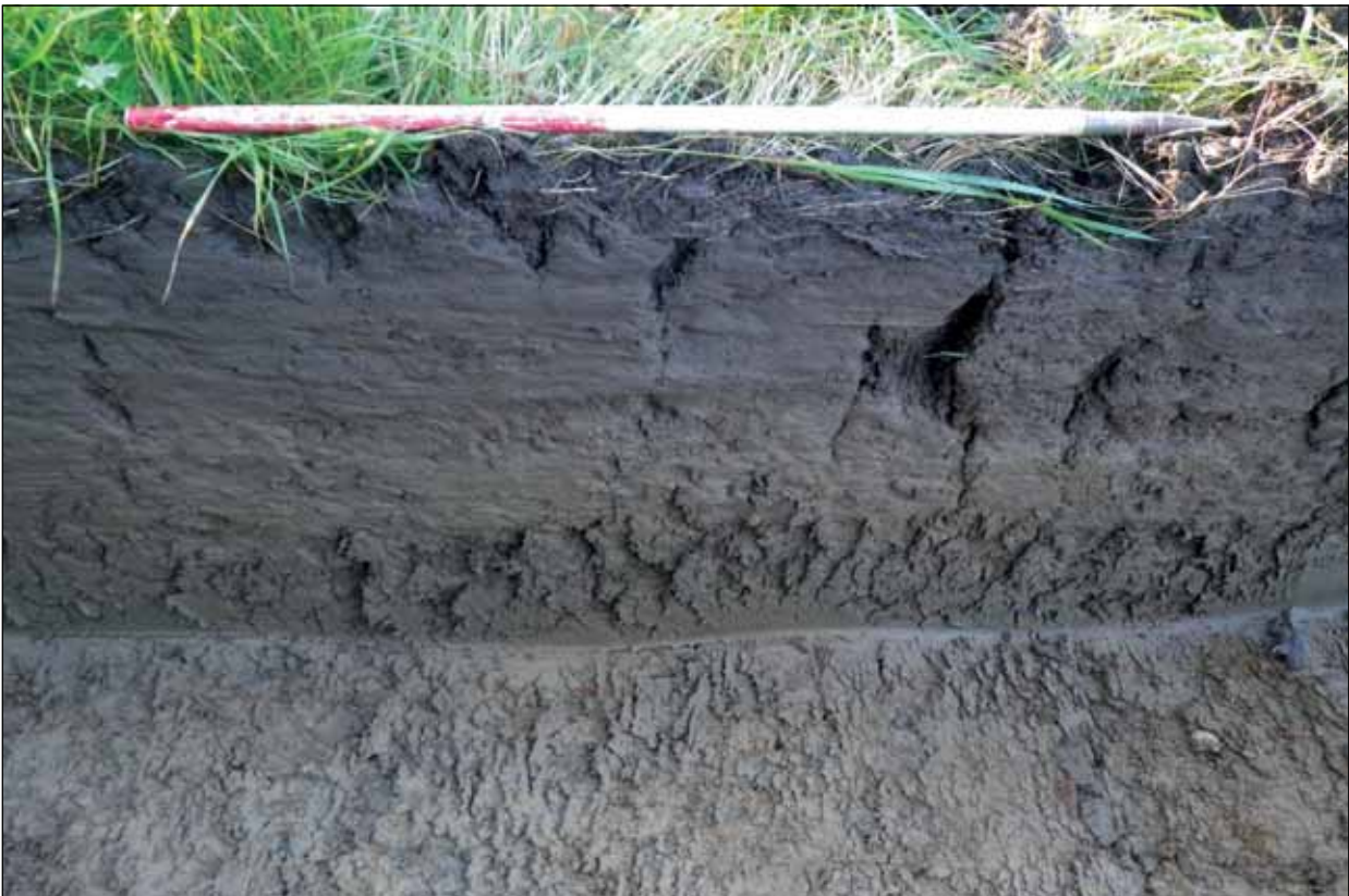
Plate 2: Trench section showing buried soil (8), subsoil (2) and topsoil (1)