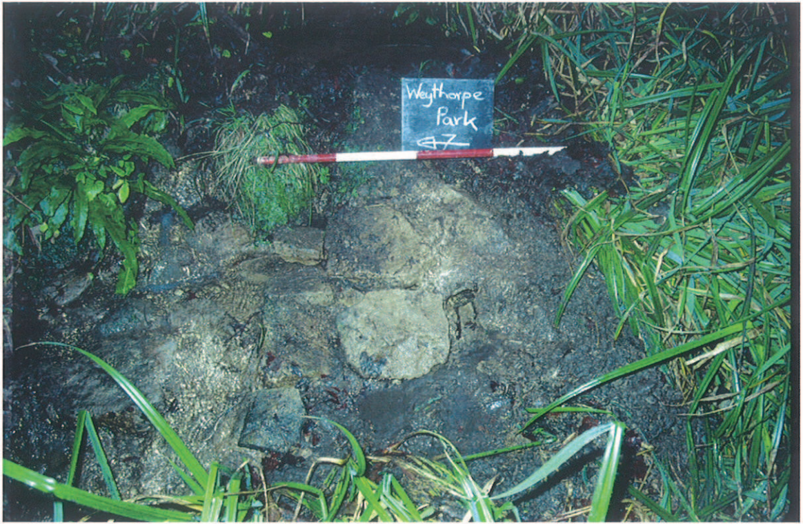
Plate 1: Void/sink amongst stones