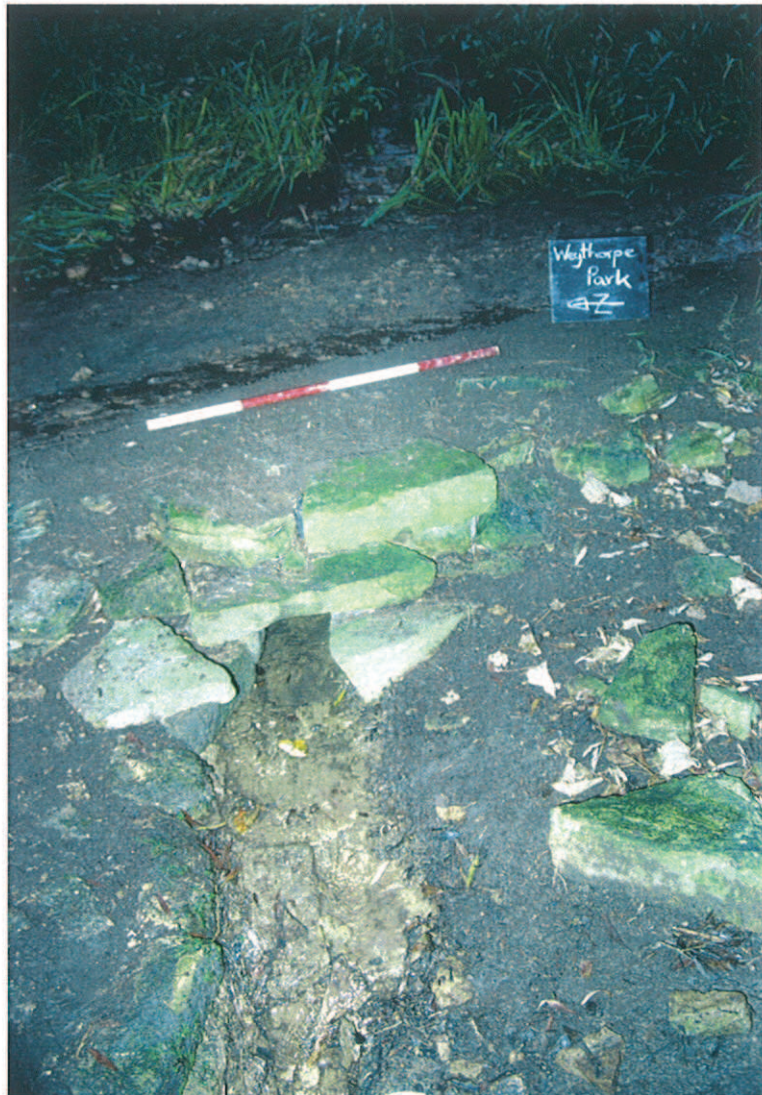
Plate 2: Southern end of culvert