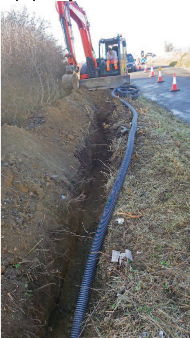
Plate 6: Cable trench working shot