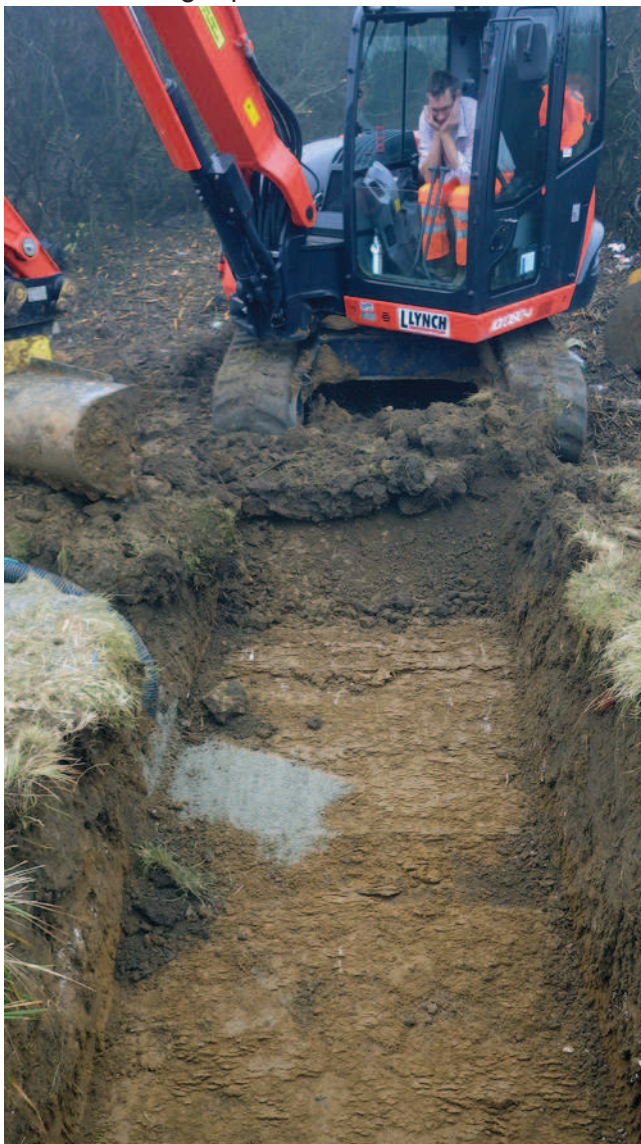
Plate 2: Trench A working shot