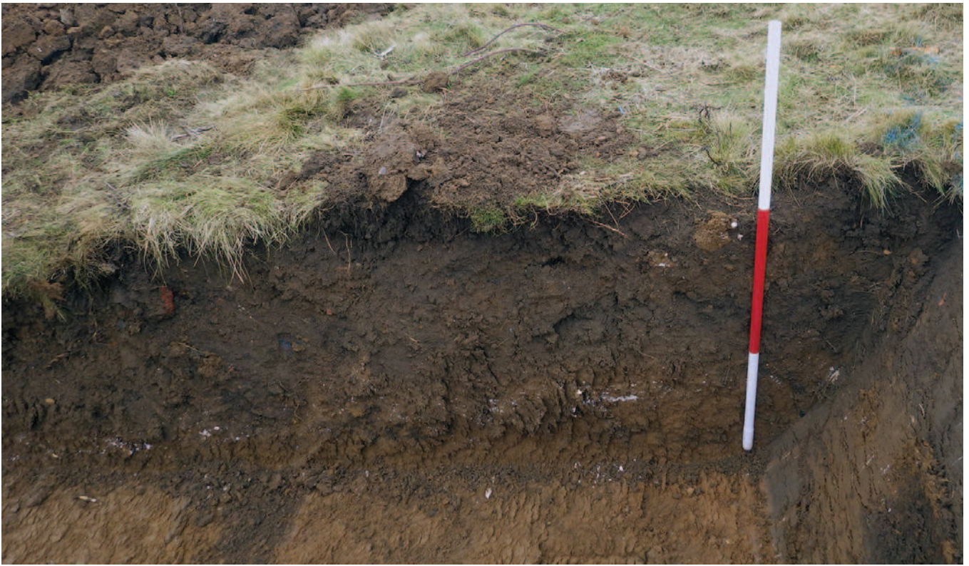
Plate 1: West facing representative section Trench A. Showing archaeological sequence exposed