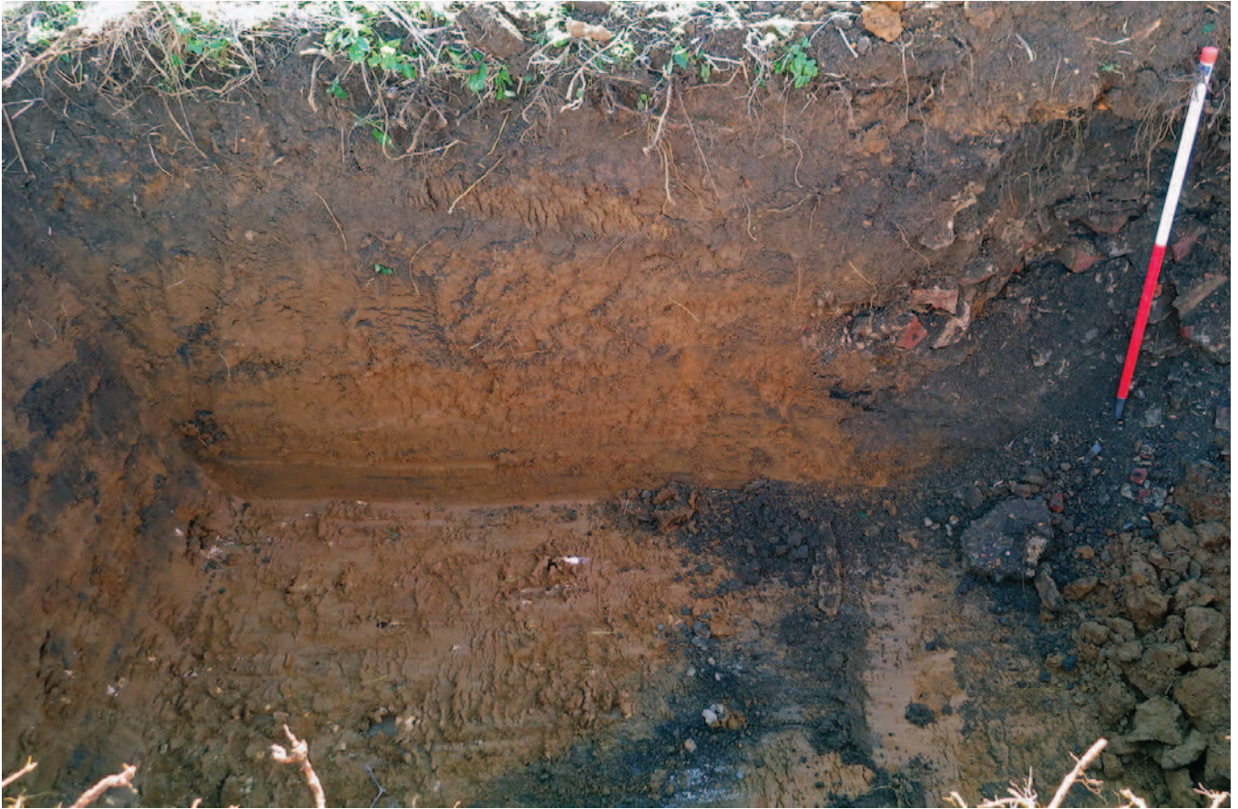
Plate 5: North facing section of data logging chamber showing archaeological sequence with modern cut [103] to the right