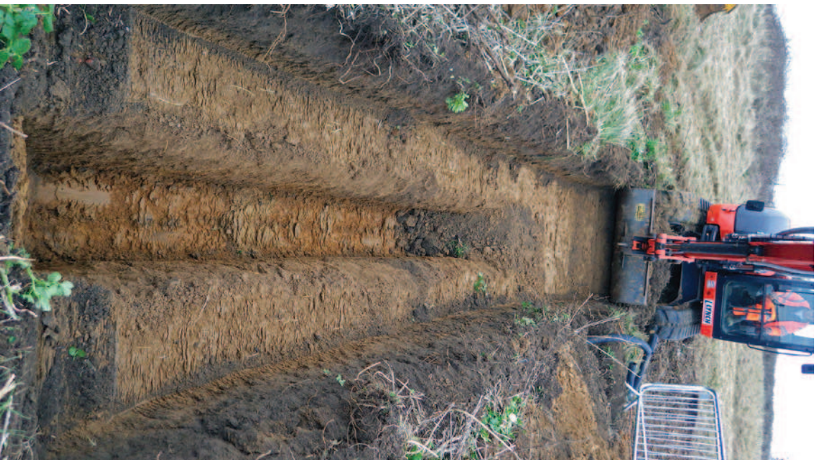
Plate 3: Trench B working shot