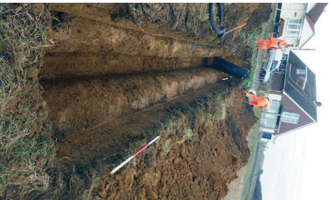
Plate 4: Trench B working shot