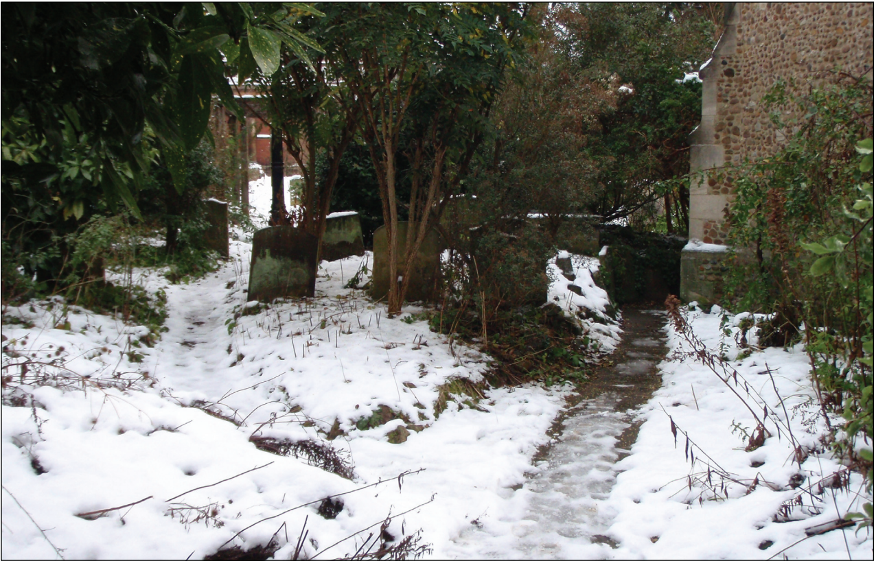
Plate 1: General Site shot