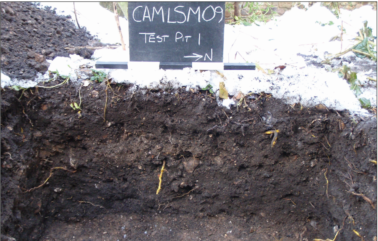
Plate 2: Test Pit 1