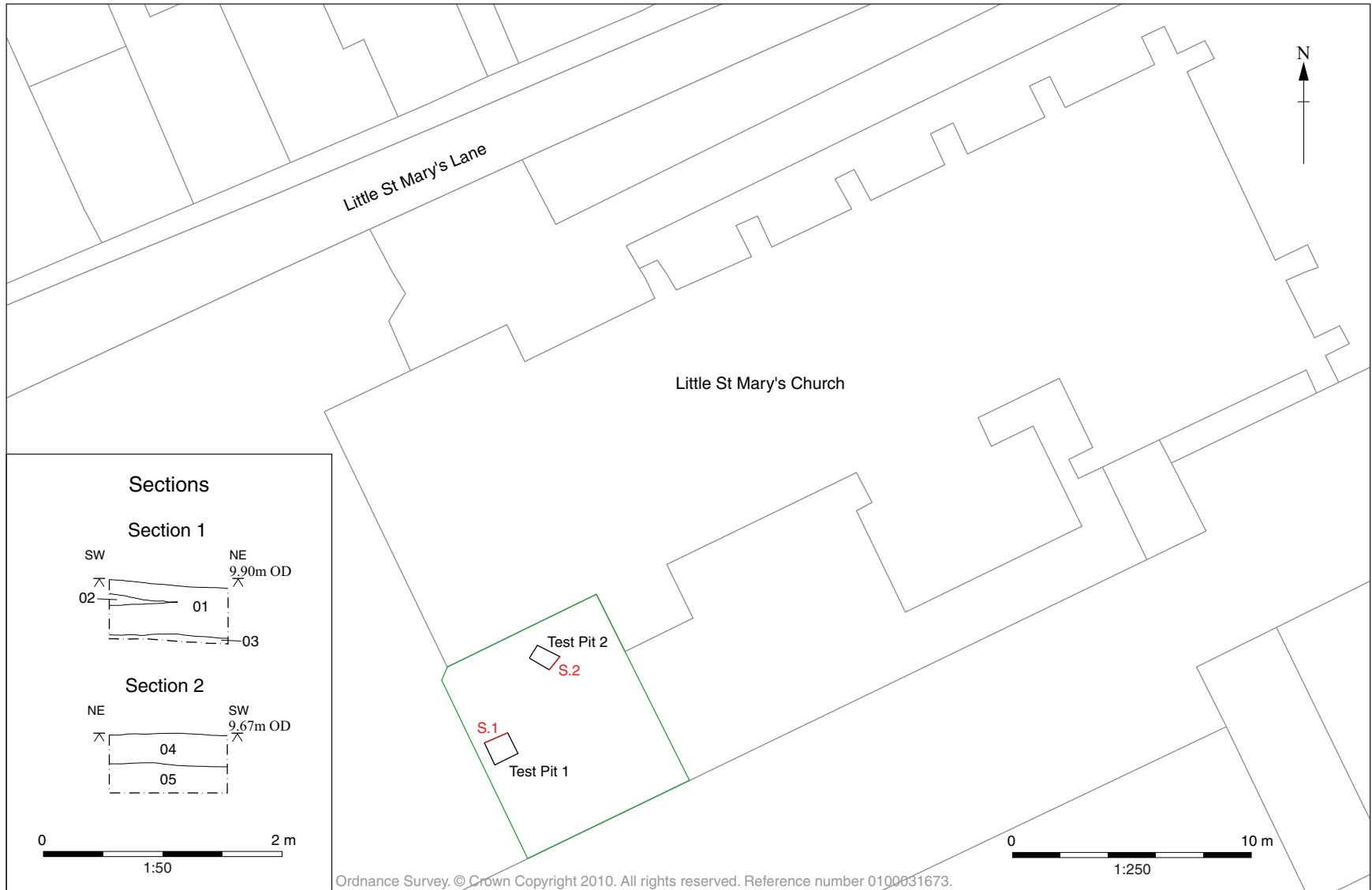
Figure 2: Location of test pits within development area (green) and section drawings