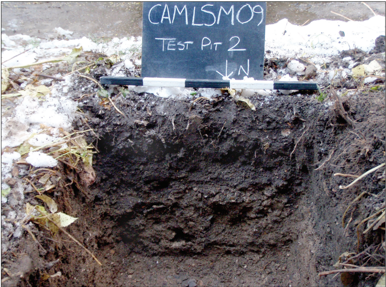
Plate 3: Test Pit 2