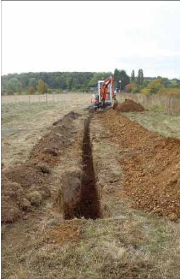
Plate 1: Working shot