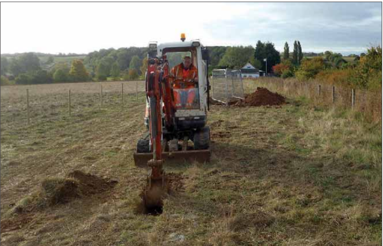
Plate 2: Working shot