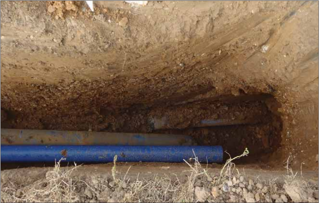
Plate 3: Pipe installation