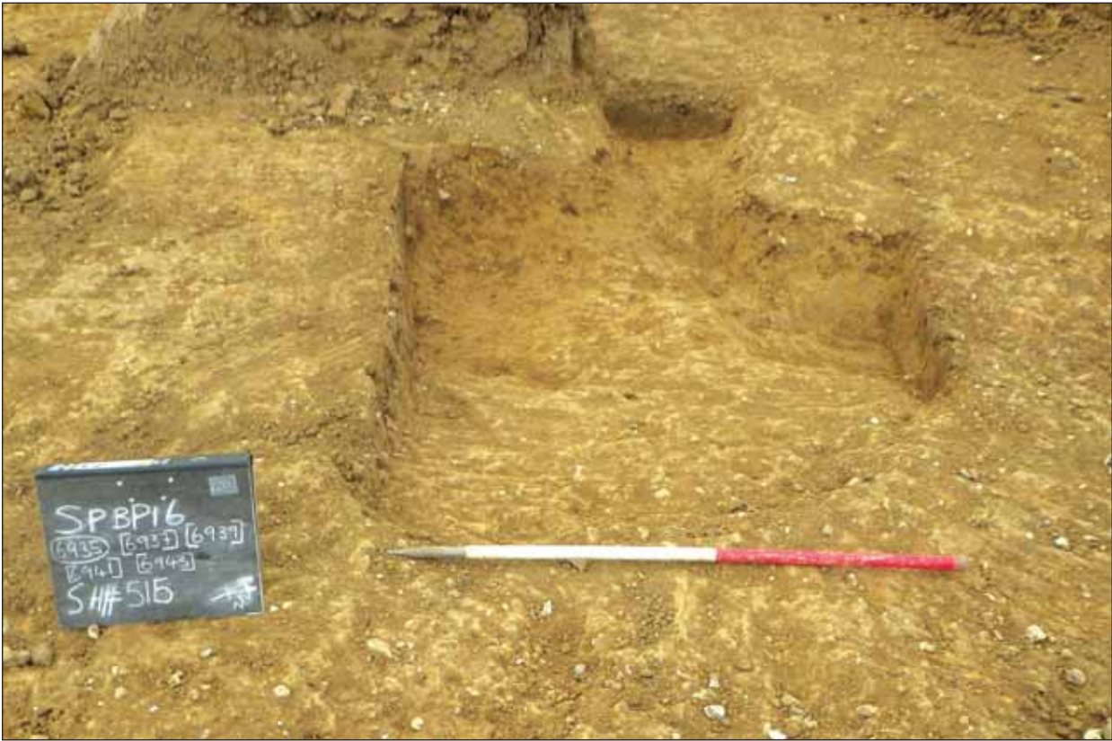
Plate 3: Medieval surface (6935) and ditch 6941, looking north-west