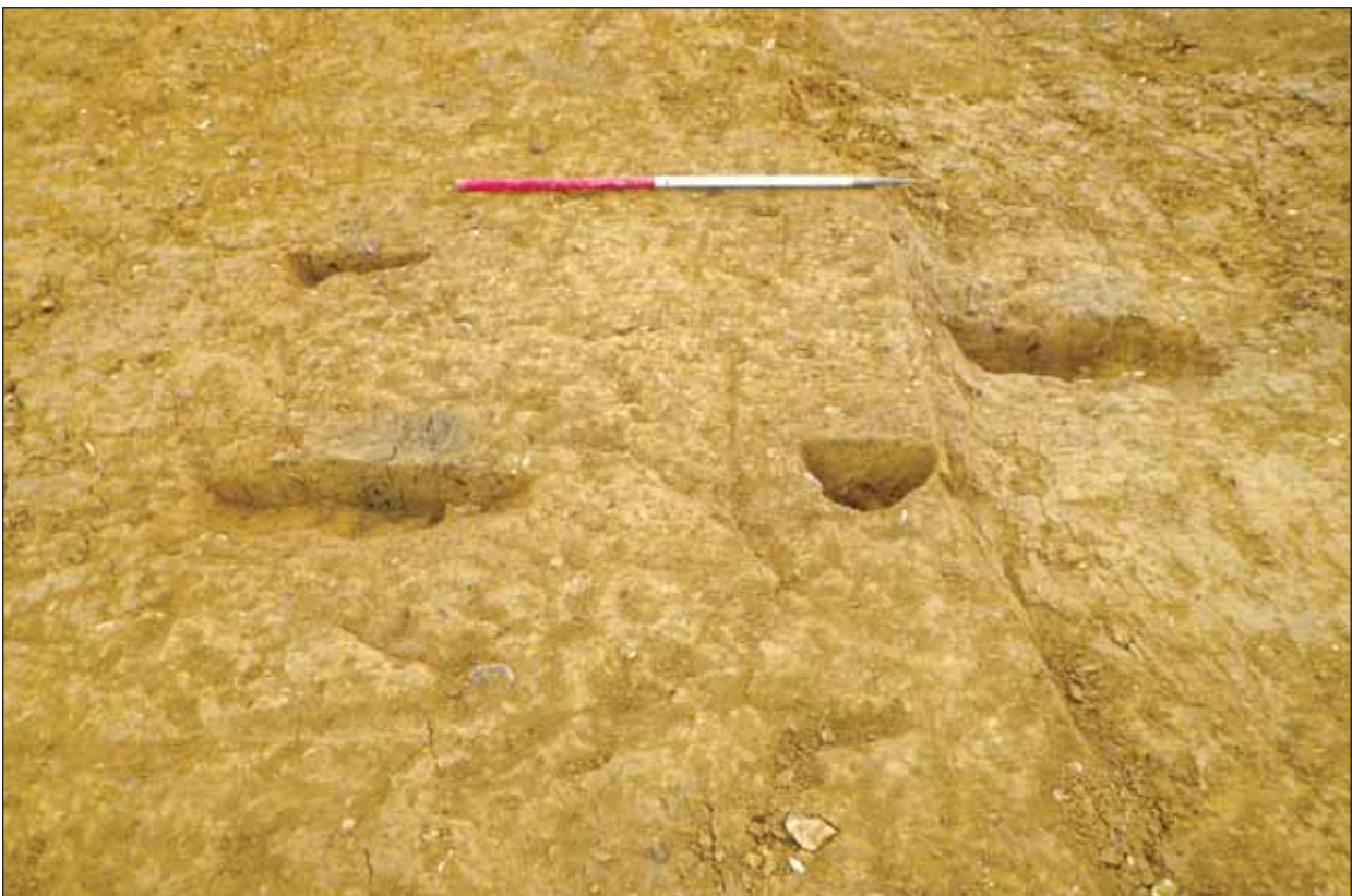
Plate 2: Medieval pits 6906 , 6908 , 6910 and 6912 , looking north