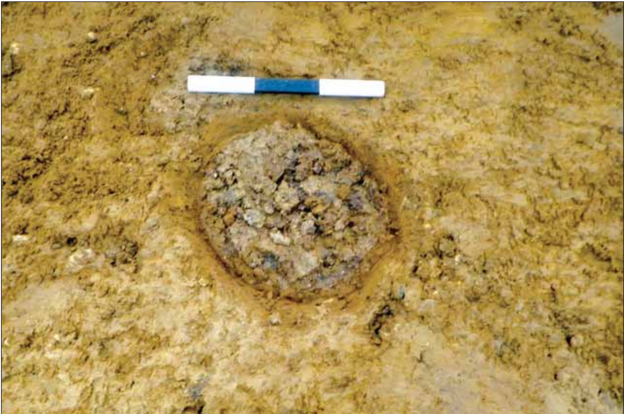
Plate 1: Late Bronze Age pit 7238 , looking north