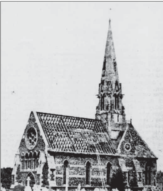
Plate 2: The Mortuary Chapel during demolition, viewed from the south