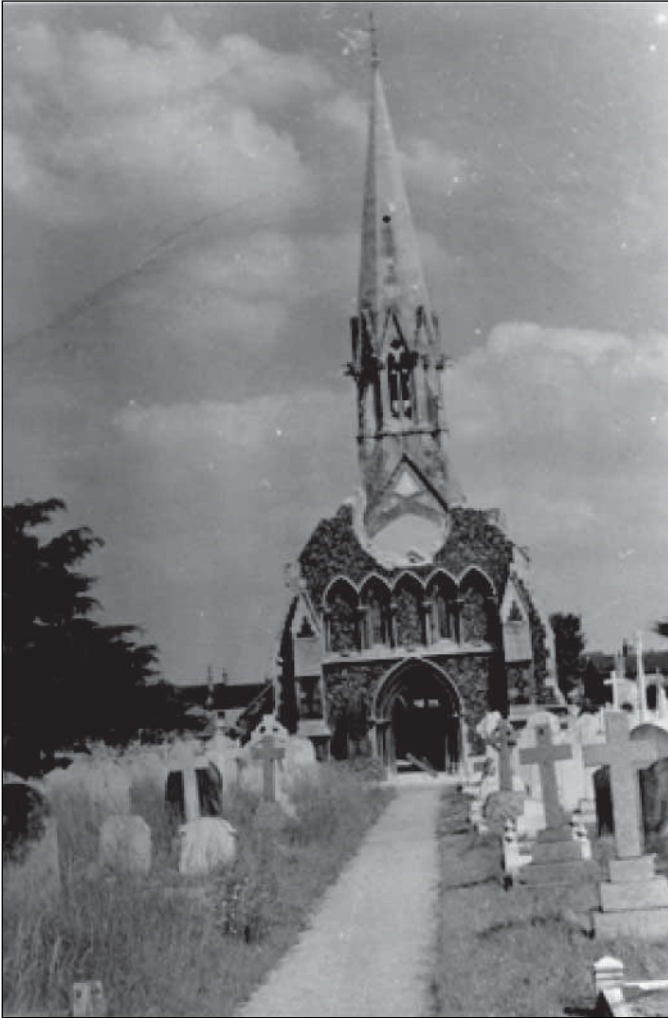
Plate 1: The Mortuary Chapel during demolition, viewed from the west.