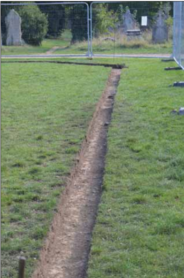
Plate 4: Southern wall foundation. Viewed from the west