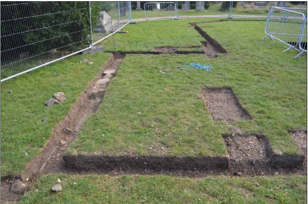
Plate 6: Chapel foundations uncovered. Viewed from the west