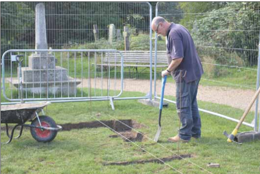
Plate 8: Excavation of the north-western corner of the chapel building