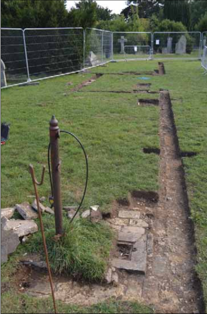
Plate 7: The northern wall foundation. Viewed from the west