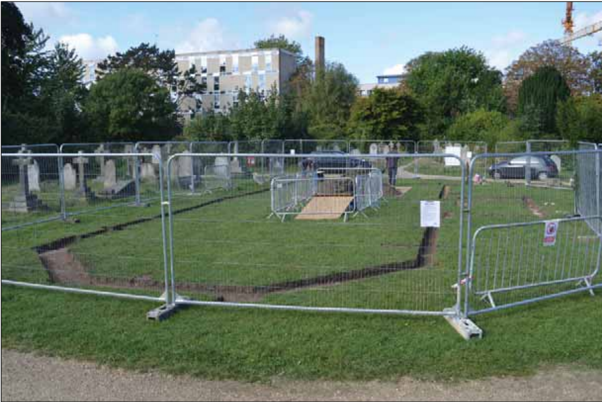
Plate 3: Overview of the chapel foundation trenched. Viewed from the east