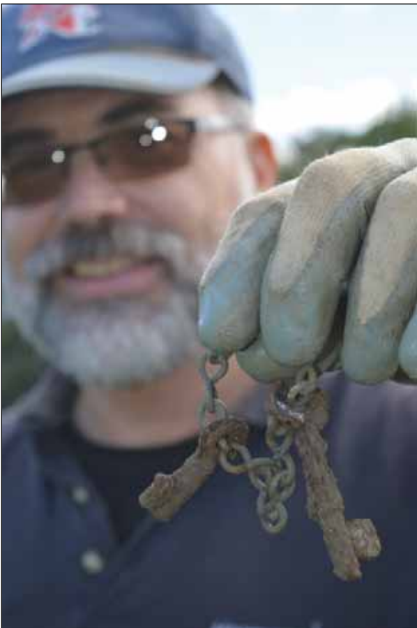
Plate 10: Keys to an internal door of the Mortuary church