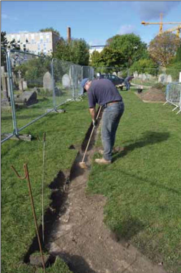
Plate 9: Cleaning the southern wall foundation trench