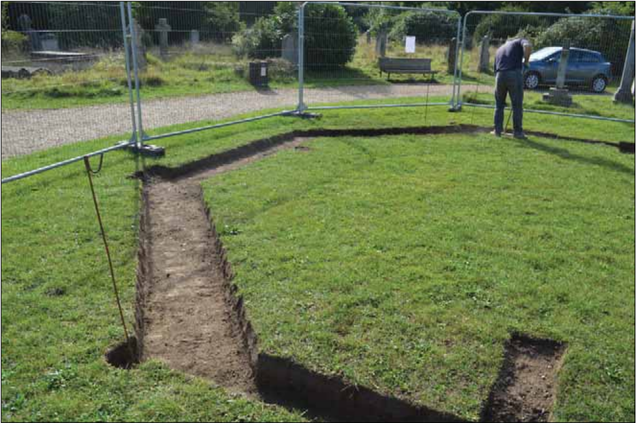
Plate 5: The eastern apsidal end of the chapel. Viewed from the north