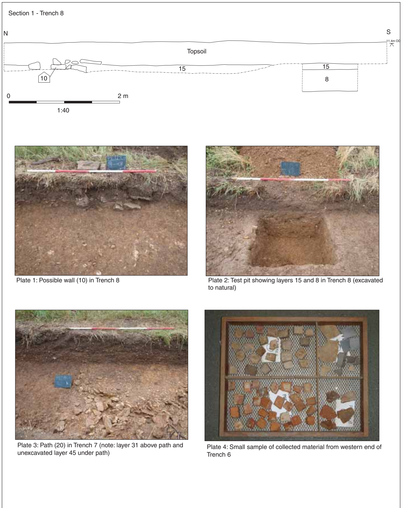
Figure 3: Section 1 and Plates 1-4