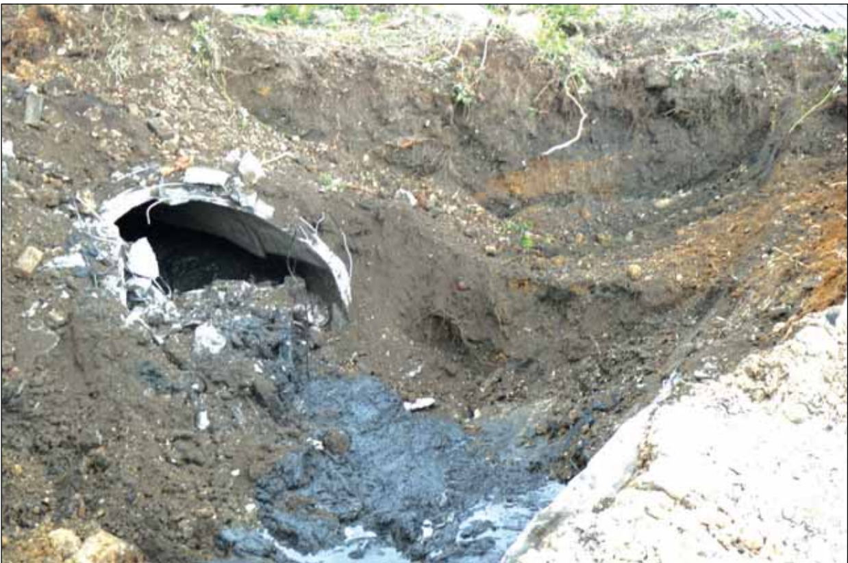
Plate 4: Area B showing concret culvert