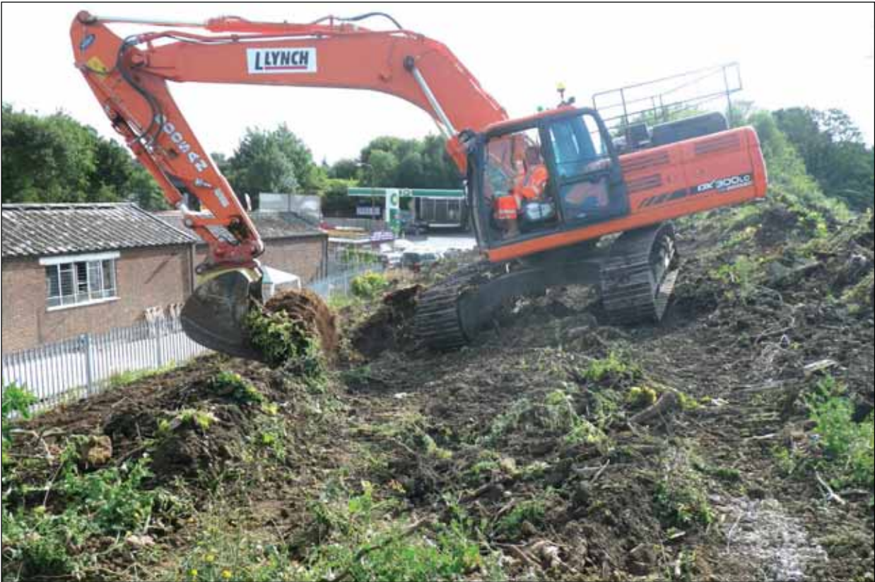
Plate 1: Area B west of Wigenhall Road