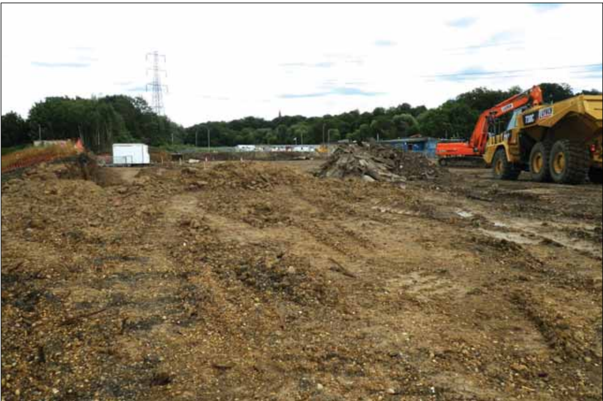
Plate 2: Area B showing limit of excavation depth