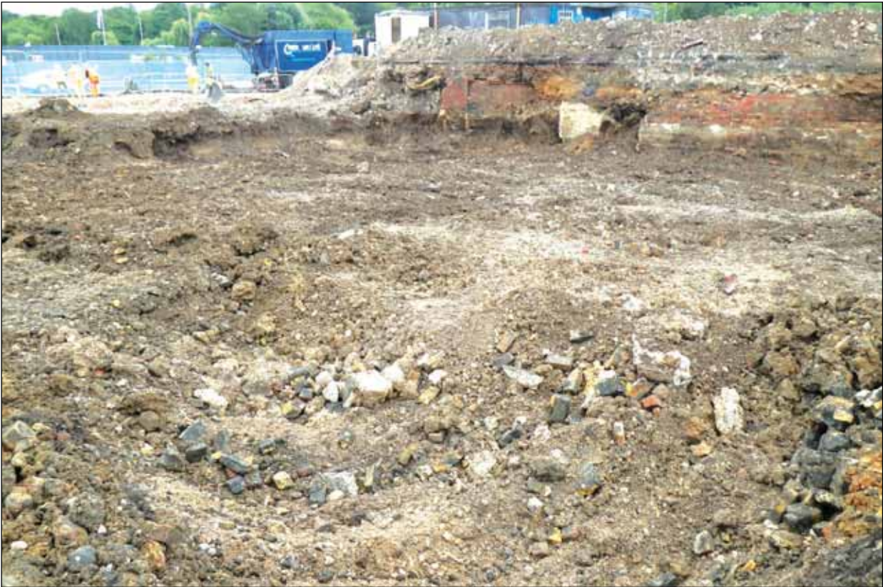
Plate 3: Area B showing limit of excavation depth