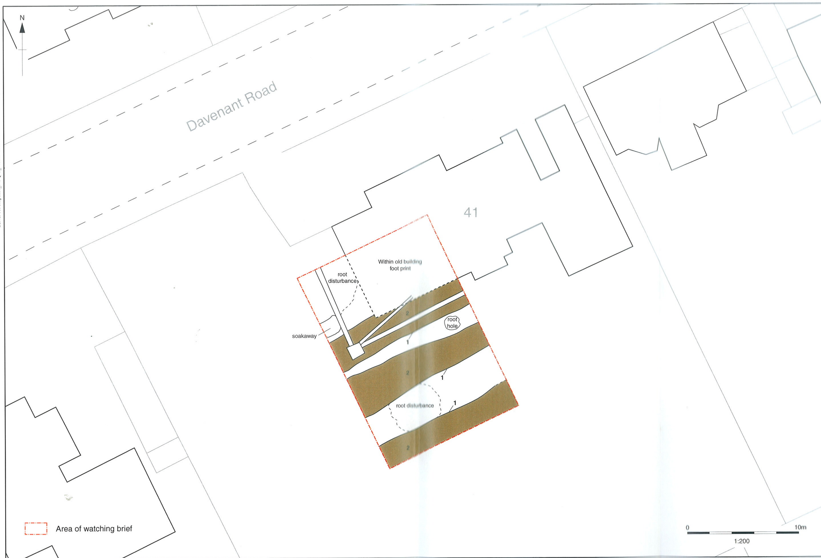
Figure 2 Location of Watching Brief.

Server 10:/oupubs/1 to Q/O_ codes*OXDAVRWB* Rutland House, 41 Davenant Road, Oxford*AMD*16.07.02.