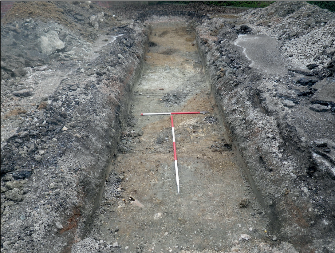
Plate 1: View of Trench from north-west