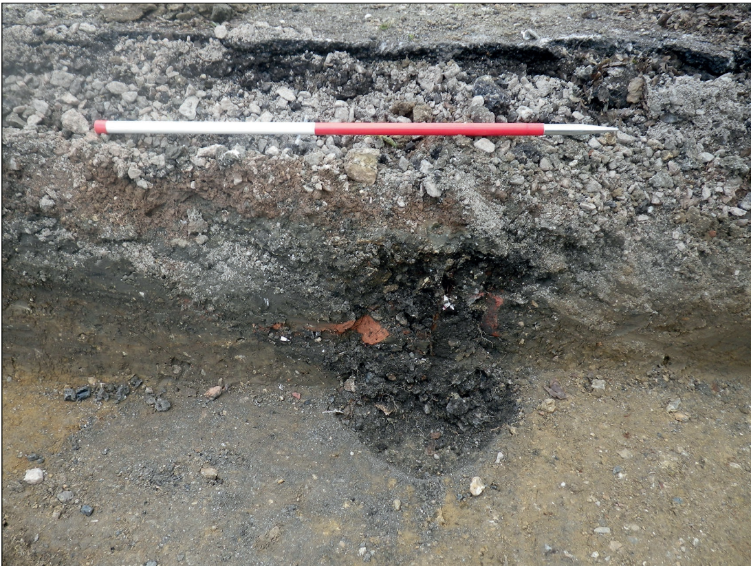
Plate 2: View of post hole 7 and ditch 5 from west