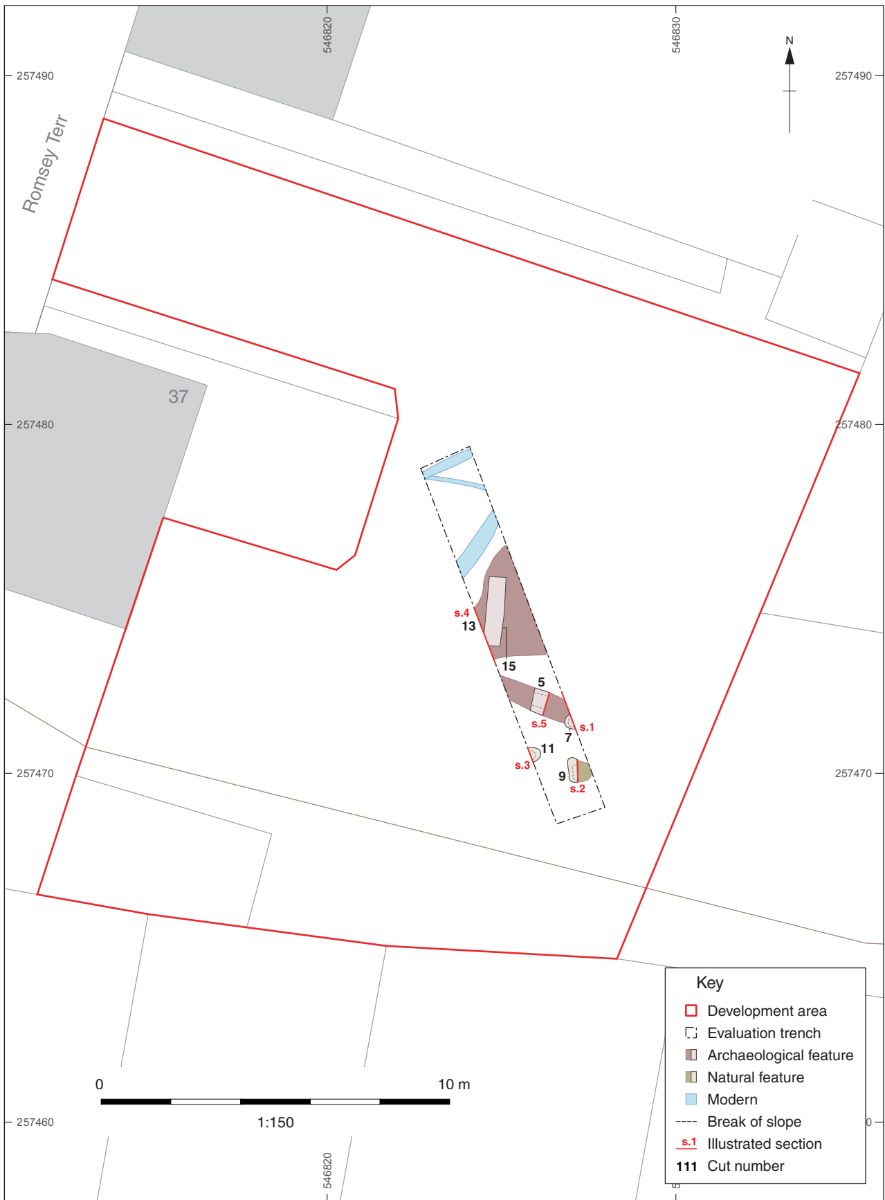
Figure 2: Trench plan