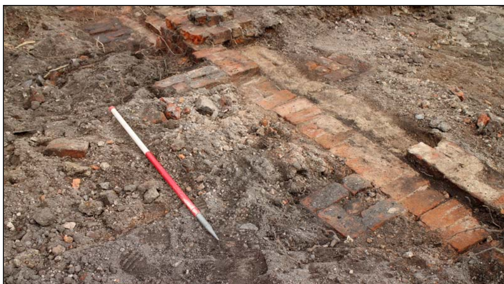
Plate 25: East wall of Building G butting earlier wall of Building F, with stub of internal cross-wall 206 (top) and check of fireplace (right)