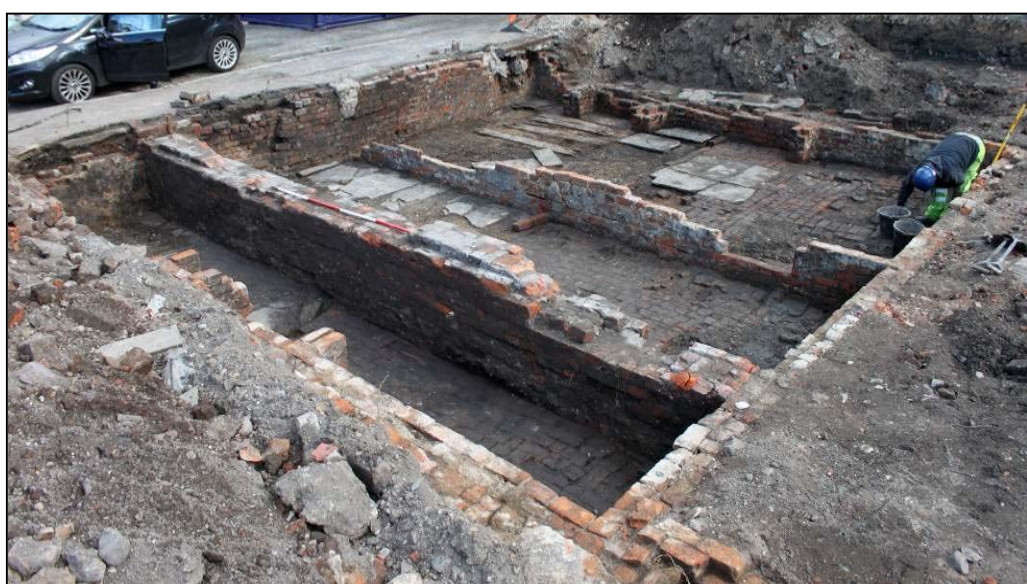
Plate 27: View across properties fronting Sherratt Street following the detailed excavation, looking south-east