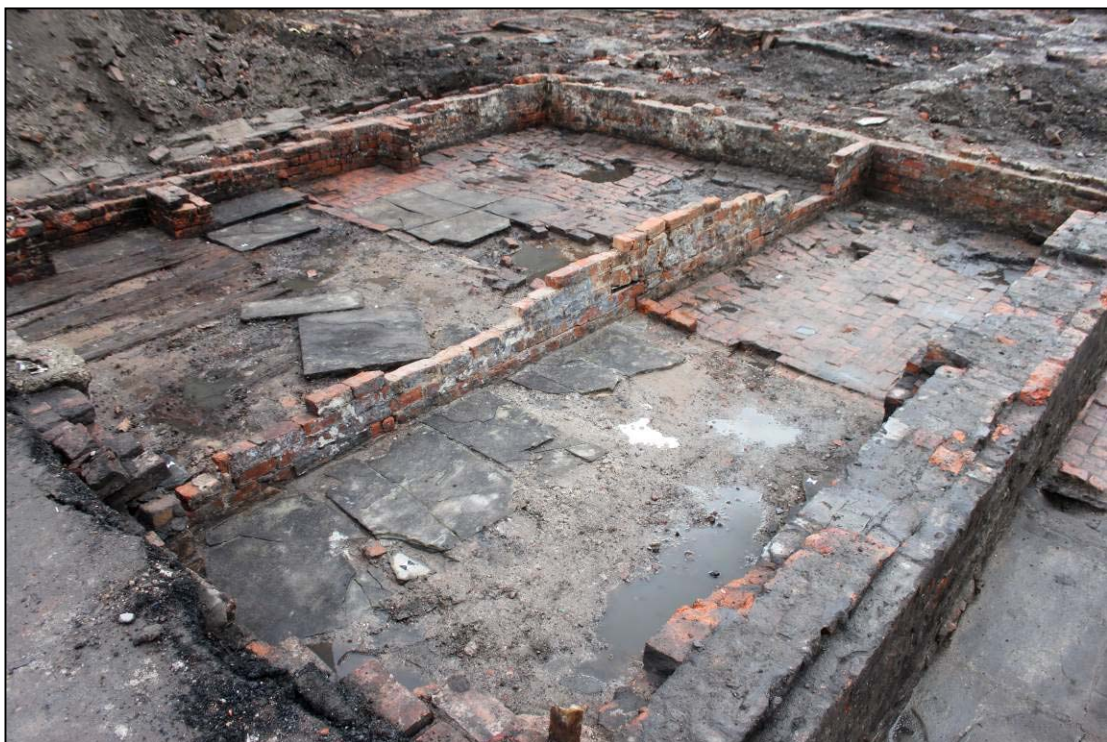
Plate 30: View across excavated Buildings H and I, looking south-west