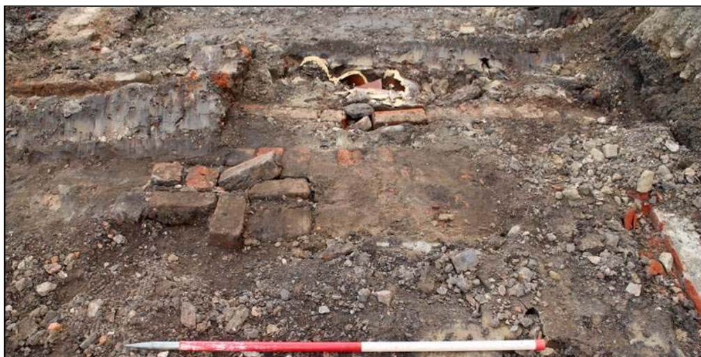
Plate 12: East wall of Building B, with ceramic pipe within the passage beyond, and with partial survival of brick flooring

4.2.3 No evidence for the north wall of Building A was observed, with a passage surviving to the immediate north of the structure, not shown on any of the historic mapping. A further passage survived to the immediate west of Building A, but unlike that to the north, this is depicted on Bancks and Co's plan of 1832 (Plate 5), the Ordnance Survey edition of 1850 (Fig 3), and Adshead's plan of 1851 (Plate 6). It was of 3' (0.91m) width, with the eastern wall being formed by the west wall of Building A, and the west wall, which formed the east wall of Building B at ground floor level, being of only a single-skin thickness (Plate 12). Nothing survived of the flooring of the passage, although one displaced sandstone flag appears to represent a remnant. Sections of broken salt-glazed ceramic pipe were also revealed (Plate 12), demonstrating that the sanitation of the dwellings was improved in the late nineteenth-century, with the passage being used to link the court to the main sewer beneath Loom Street.