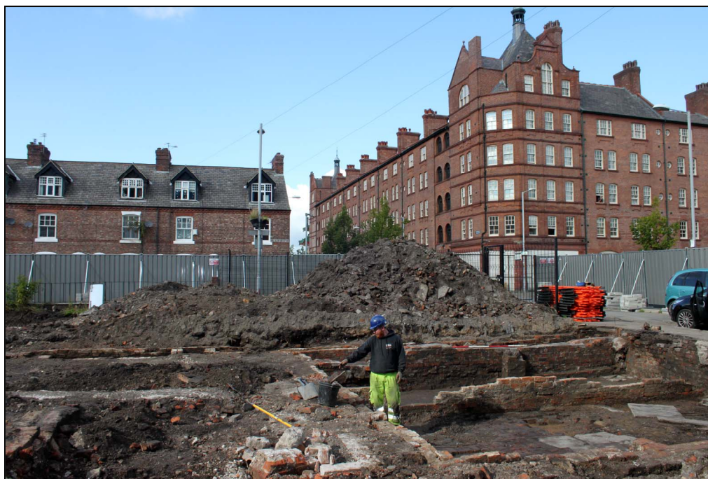
Plate 44: View across excavation site to the Victoria Buildings, and late nineteenth-century dwellings forming part of the Sanitary Street re-development, on the north side of George Leigh Street