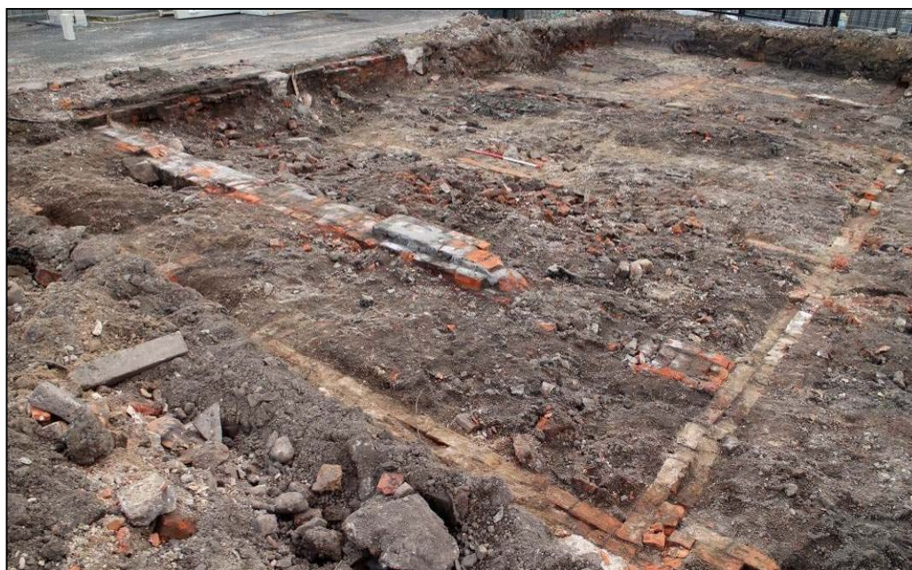
Plate 26: View across properties fronting Sherratt Street following the initial machine strip, looking south-east