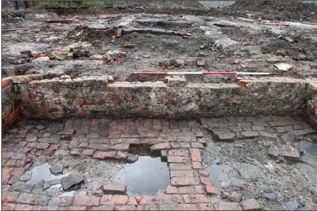
Plate 31: Detail of inner face of Wall 302, within Building I