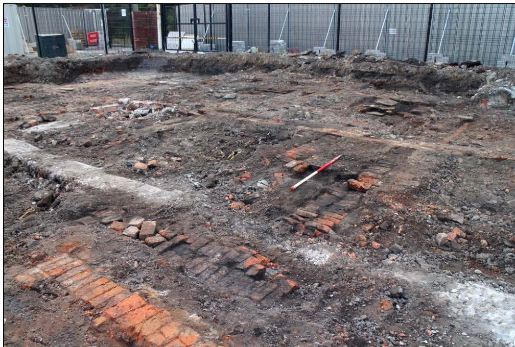
Plate 42: Probable outhouse/privy to the rear of Building C, looking south-east

4.5.10 At the eastern end of the rear of Building C, level with its projection beyond Building B, a length of wall projected into the courtyard to the north (Fig 2). Its southern end comprised a large cracked sandstone step of 4'4" (1.32m) length (Fig 2; Plate 43), which almost certainly formed a threshold step into the yard to the rear of Building C, the Ordnance Survey edition of 1908 showing that Building B had been demolished by this date, to increase the rear access of the remaining properties fronting Loom Street (Plate). To the north of the large threshold step, only a 0.5m length of broken brick wall survived, representing the only survival of the boundary wall to the inserted yard.