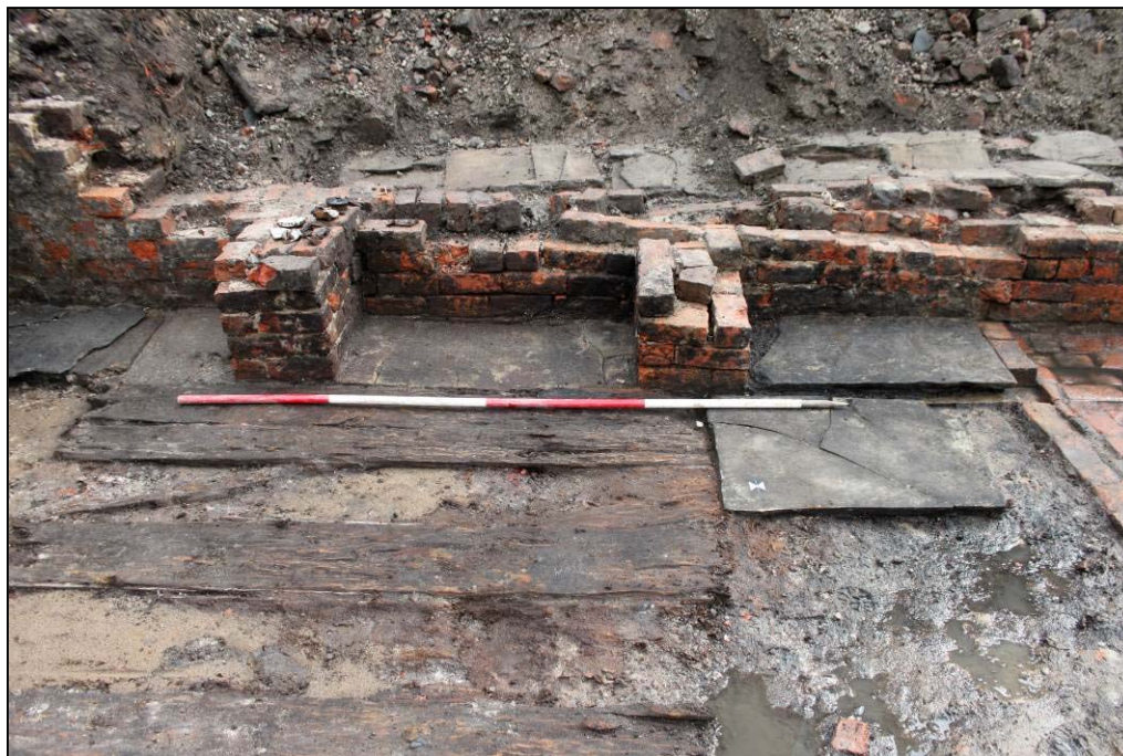
Plate 35: Fireplace in the eastern room of Building I, with partial double layer of flagstone floor and in-situ timber flooring