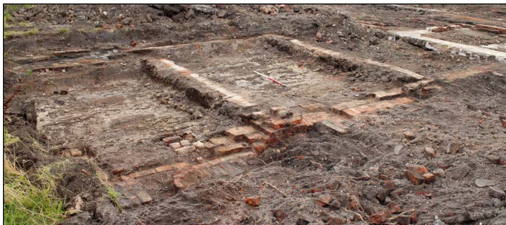
Plate 22: View across the buildings fronting George Leigh Street, from the north-west