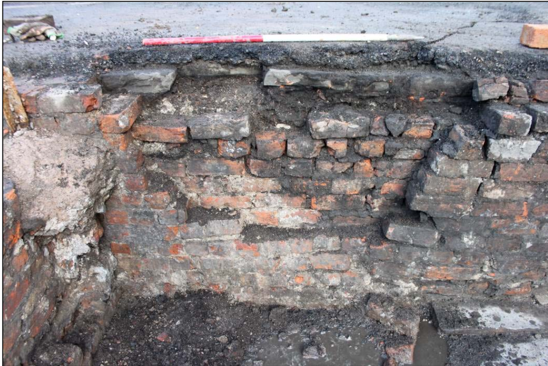
Plate 29: Flagstone pavement of Spittal Street preserved beneath modern asphalt surface