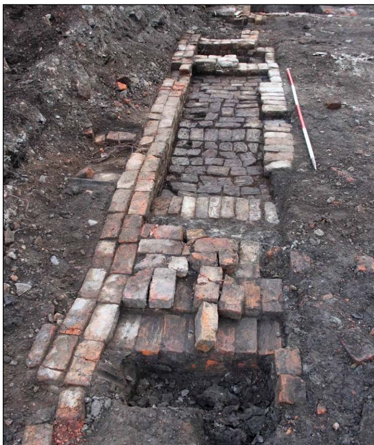
Plate 38: Privy block, Building L, from the west