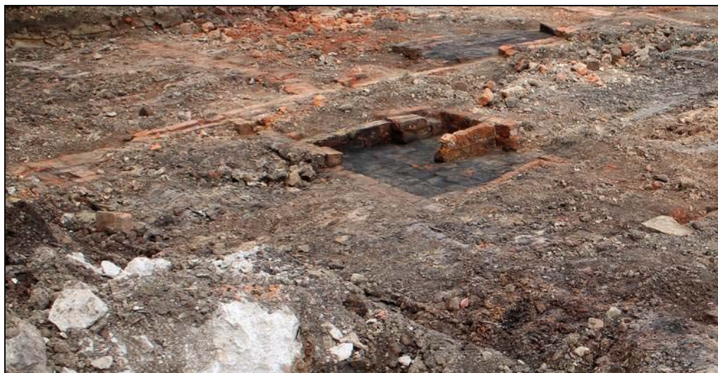
Plate 17: Building D from the east

of a doorway, although preservation was particularly poor in this area (Plate 17). The west wall ( II2 ) differed from that in Building C ( III ), being of full-brick thickness (Plates 17 and 18), demonstrating it to be an original external wall, predating the construction of Building E (Figs 2 and 3). At its northern end it returned to form the continuous north wall ( II4 ) along the rear of Buildings B, C, and D (Figs 2 and 3; Plate 18). As with the two buildings to the east, Building D also had a structure placed against the northern side of the internal cross wall (Fig 2). This was the best-preserved of the three (Plates 17-19), having a complete single-skin around the 5' x 3'6" (1.52 x 1.07m) structure (Fig 2; Plate 19). It also retained a short, single-skin central spine wall, projecting 18" (0.46m) from the north wall (Fig 2; Plate 19). A further L-shaped wall was placed along the internal west face (Fig 2; Plate 19), similar to those observed within Building C. This overlay an extant floor of rough broken bricks (Plate 19), which was heavily sooted, suggesting use as a coal store, although it may have originally housed a steep stair.