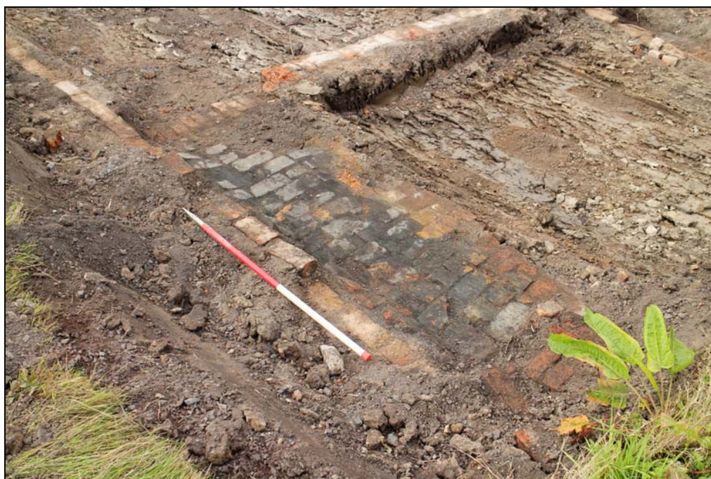
Plate 24: East wall of Building F, 203, with adjacent survival of brick flooring