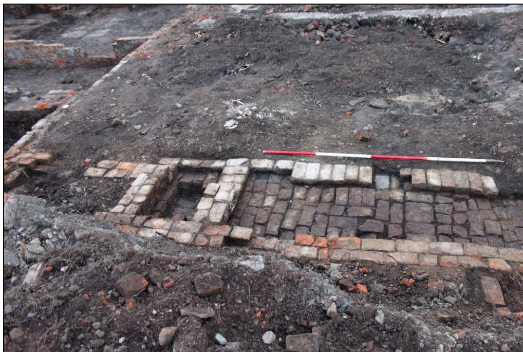
Plate 39: Eastern extension to Building L, looking south, with wall 406 to left

4.5.3 Building L appears to have been extended at either end subsequently, with that at the eastern end being the far better preserved. This comprised an additional L-shaped wall of full-brick thickness ( 407 ), forming an additional closet of 2'6" (0.76m) width, also retaining a partial brick floor (Plate 39), and either representing a further privy or an ash closet for No 1 Court (Fig 3). This was butted on its eastern face by a further wall of full-brick thickness ( 406 ), which appears to have formed the rear wall of an L-shaped structure inserted between Building L and Building H, separating No 1 Court from Radcliffe's Court to the north (Fig 3; Plate 6). At the opposite end of Building L, an area of 3' x 2'6" (0.91 x 0.76m) of up to three courses of brick flooring (Plate 38) appears to have represented a further structure within the block by the early nineteenth-century. Its western edge may have represented the survival of a small section of the east wall of a large rectangular building (Building K) of approximately 16'6" x 13'9" (5.03 x 4.19m), placed in the north-west corner of No 1 Court (Fig 3), prior to 1832 (Plate 5).