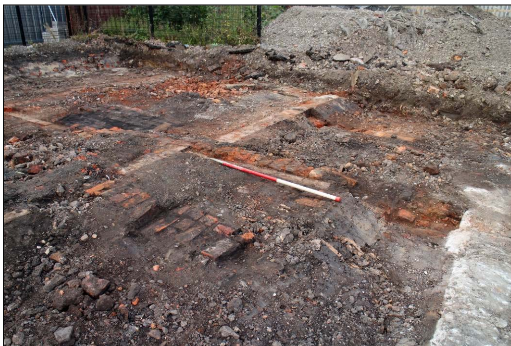
Plate 41: Probable outhouse/privy to the rear of Building D, looking south-west