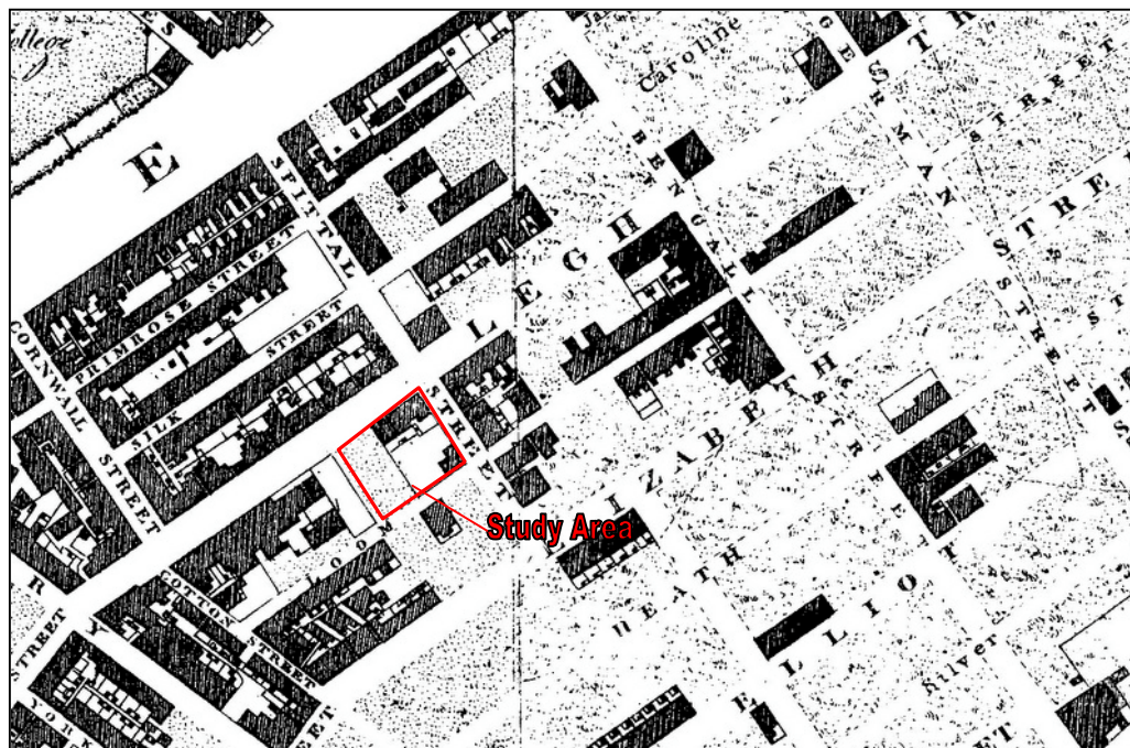
Plate 2: Extract from William Green's map of 1794