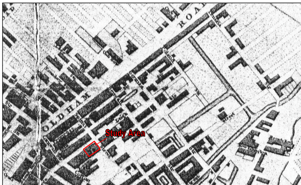
Plate 4: Extract from Pigot's map of 1819

3.5.4 Bancks and Co's Map of Manchester and Salford , published in 1832, provides the first detailed nineteenth-century survey of the study area (Plate 5). This shows four rectangular properties fronting George Leigh Street within the site boundary, with a passage between the western two, and with a block of apparent back-to-back houses extending along the street frontage to the west