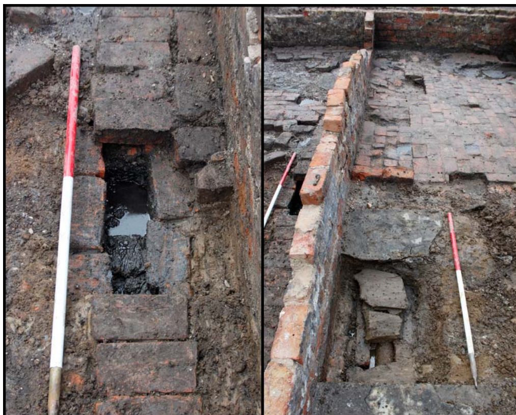
Plate 36: Drains below floor within Buildings H (right) and I (left)