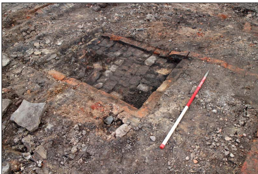
Plate 14: Probable staircase within rear room of Building B, looking south

wall, although the feature is slightly wider than the normal 2-3' width expected for such a structure. A gap in the extant wall foundation at its eastern end probably marks the position of a doorway between front and rear rooms of the dwelling (Fig 2). A further small element of brick flooring, measuring approximately 1.3 x 0.5m survived in the south-eastern corner of Building B (Plate 12), and probably represented a fragment of the original floor surface. The west wall, 107 , also displayed evidence for internal features, with full-brick thickness projections on its eastern face within both 'front' and 'rear' rooms of Building B (Fig 2; Plate 13). These represent single surviving fireplace cheeks, with the southern cheek of the front room possibly surviving beyond the limit of excavation to the south.