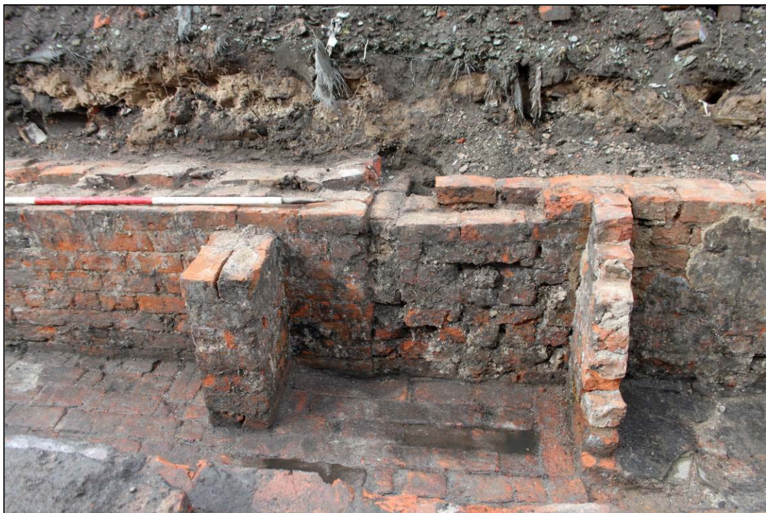
Plate 32: Butt joint in Wall 303,