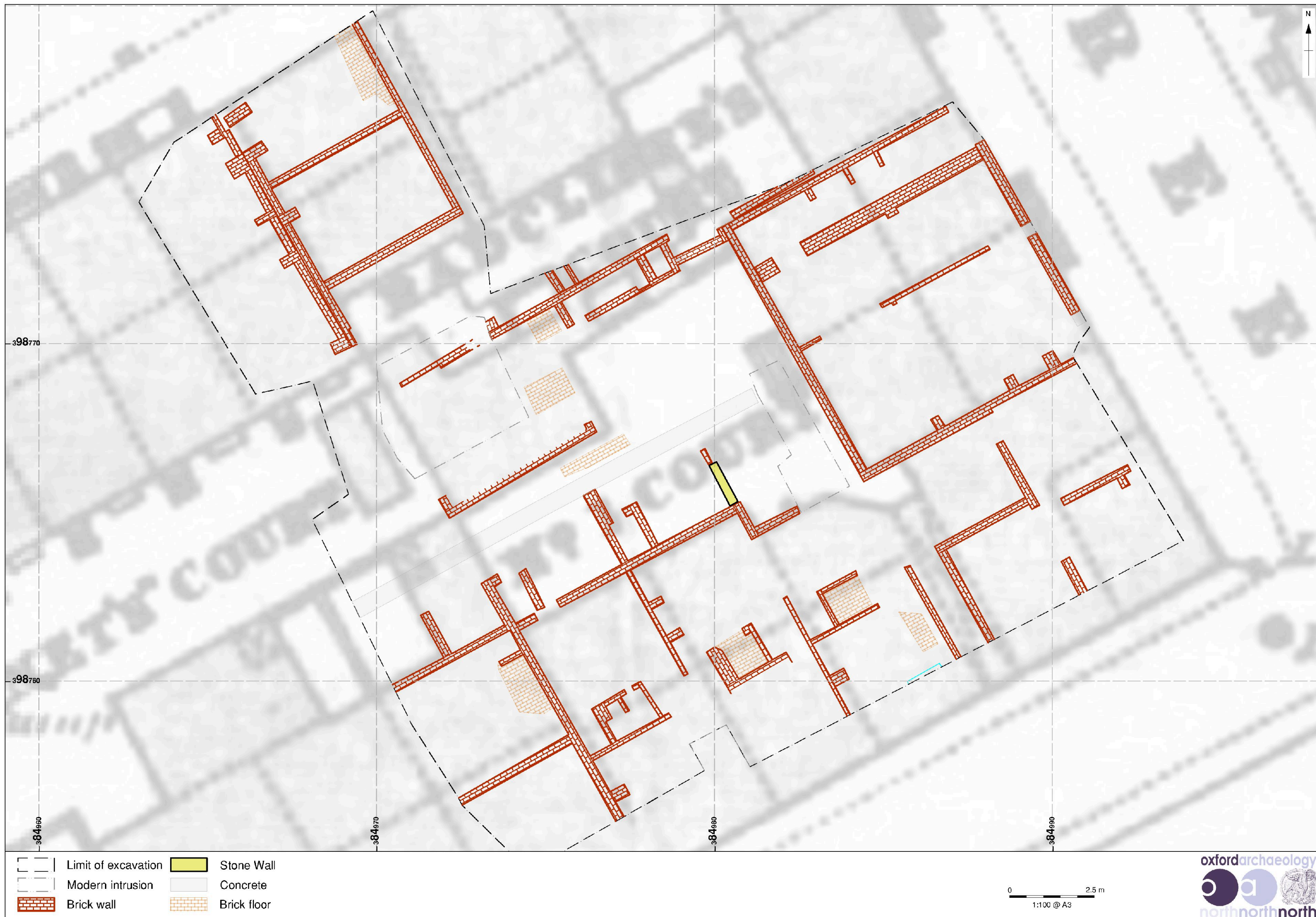
Figure 3: Plan of excavated area superimposed on the Ordnance Survey 60":1 mile map of 1850