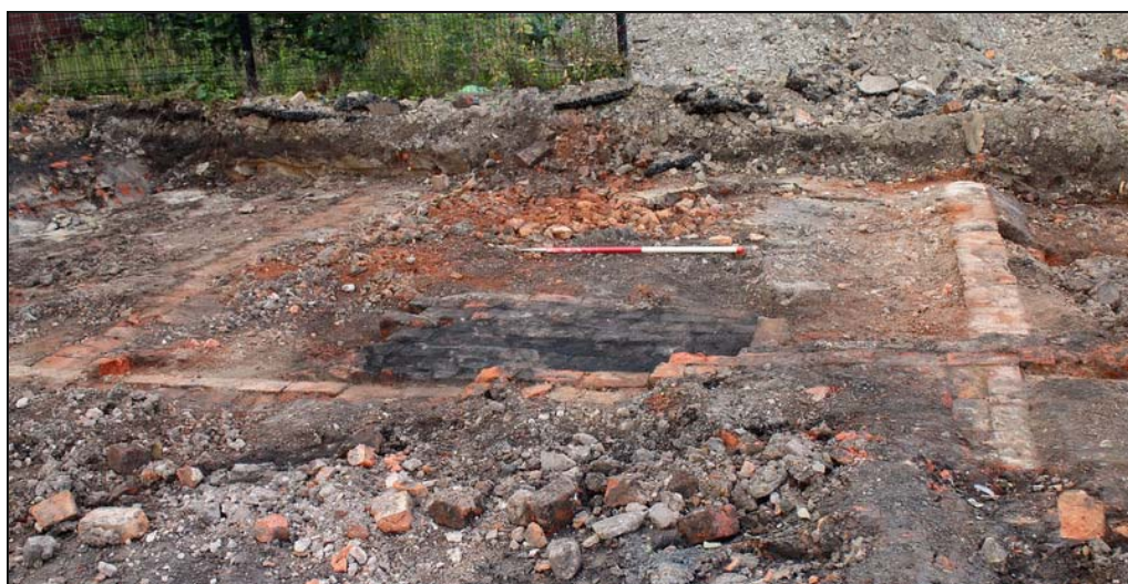
Plate 20: View across Building E, from the east

4.2.8 Building E was the westernmost structure observed along the Loom Street frontage within the excavation area (Fig 2). Most of the structure lay beyond the limit of excavation (Fig 3), but structural internal features were revealed, alluding to its original form. Its eastern wall ( I12 ) was formed by the external wall of Building D, which was butted by a full-brick thickness cross wall ( I13 ), placed 2'6" to the north of the single-skin cross-wall in Buildings B-D (Fig 2; Plate 20), and creating a front room of approximately 14'6" (4.42m) depth, again in slight contrast to that shown on the Ordnance Survey plan of 1850 (Fig 3). The wall was continuous across the trench, suggesting that any doorway between front and rear rooms either lay at the very western end, beyond the limit of excavation, was placed above the level of the survival of the wall, or more probably, given the full-brick thickness of the wall, was not included in the original construction.