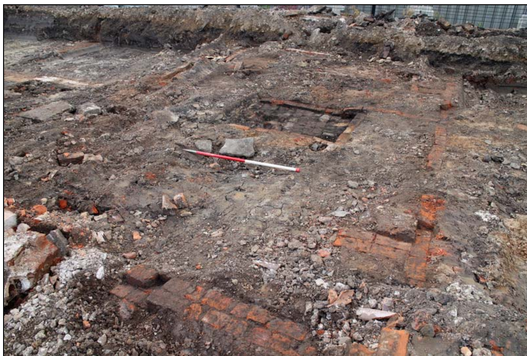
Plate 13: Building B from the north,

4.2.5 An L-shaped, single-skin wall, of similar orangey-red, hand-made brick construction to the other walls of Building B, butted the north face of cross-wall 108 (Fig 2; Plate 13). It formed an open-ended area of 3'6" x 4'2" (1.07 x 1.27m) which retained elements of a rough floor of broken brick (Plate 14). This probably represents the position of a staircase, placed against the cross-