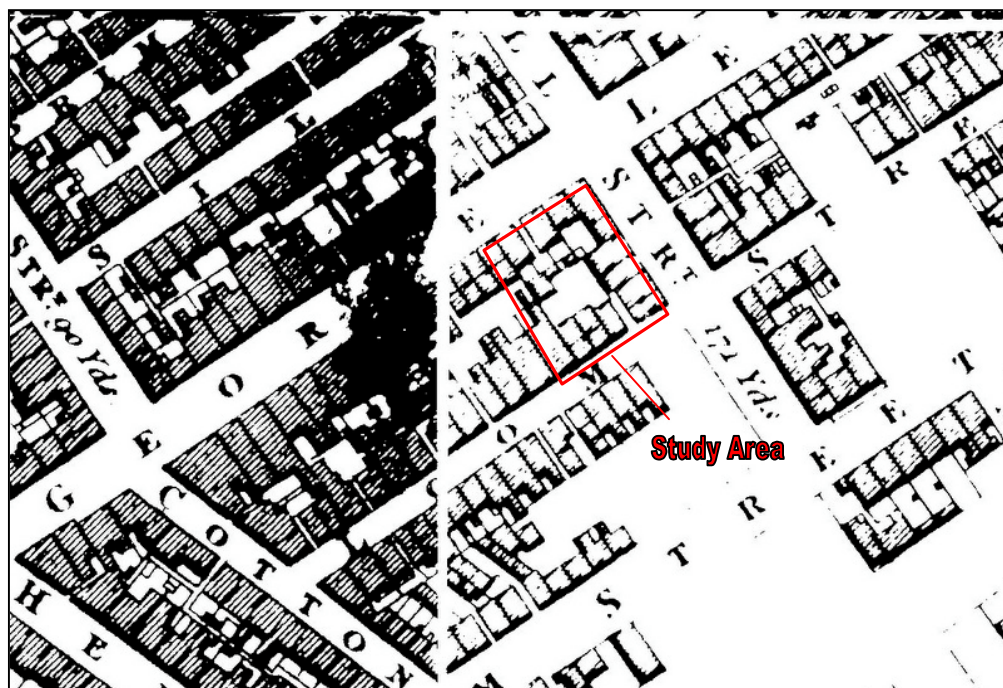
Plate 5: Extract from Bancks and Co's map of 1832

(Plate 5). It also shows a series of small yards and small buildings, probably privies and ash pits, within these yards to the rear of the George Leigh Street frontage. Six rectangular properties are depicted along Spittal Street (Plate 5), with a passageway between the building on its junction with Loom Street, and four further properties along the Loom Street frontage within the site boundary (Plate 5). The western of these is shown as a large building with a rear extension, adjacent to a block of four apparent back-to-back houses, with a small rectangular structure at the eastern end. The passage lead to a large enclosed courtyard to the rear (Plate 5).