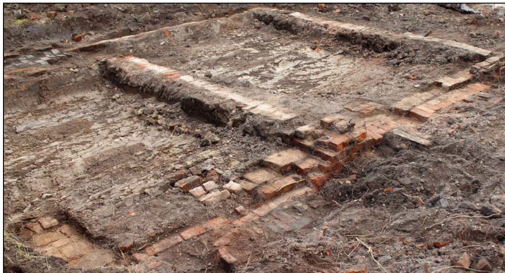
Plate 23: West wall of Building F, butted on its external face by the east wall of Building G

the property. This appears to have formed a boundary wall to a yard to the rear of the properties fronting George Leigh Street, as shown on Green's plan (Plate 2), and which later became the western boundary wall of Radcliffe's Court (Fig 3).