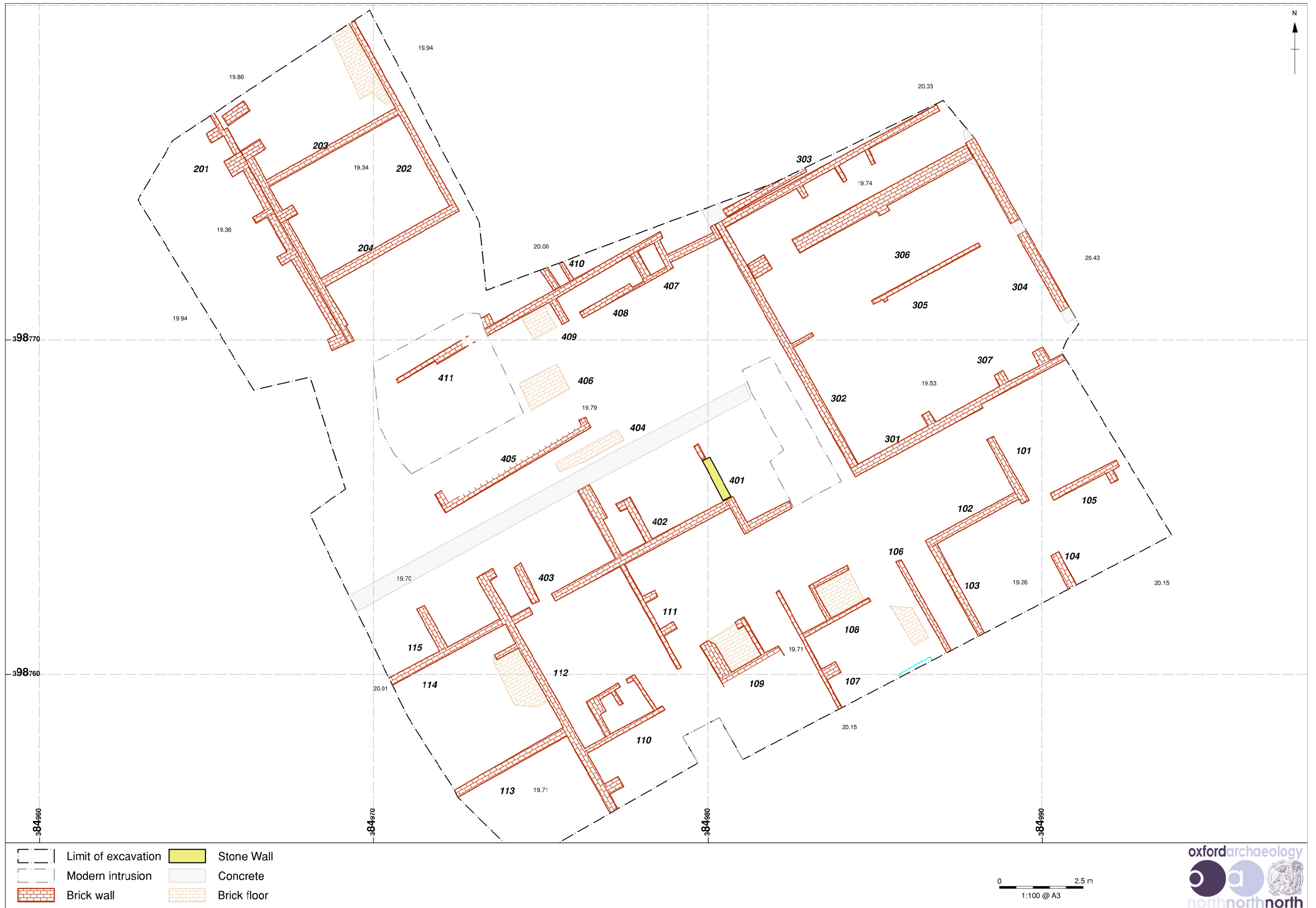
Figure 2: Plan of excavated area