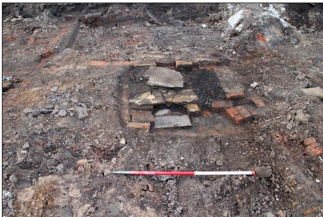
Plate 16: Probable staircase within rear room of Building C, looking south

4.2.7 Building D, to the immediate west, was of similar proportions to Building C, and formed part of a contemporary construction of a pair of similar single-fronted cottages (Fig 3). Its cross-wall (I10) was again of single-skin construction, and with an apparent gap at its eastern end marking the position