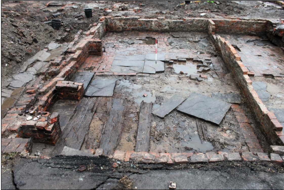
Plate 33: Excavated remains of Building I, from the east