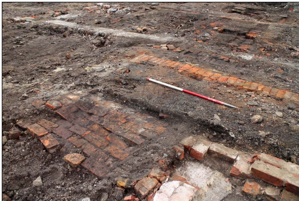
Plate 40: Wall 405, with associated brick floors, and late-twentieth century brick structure in foreground