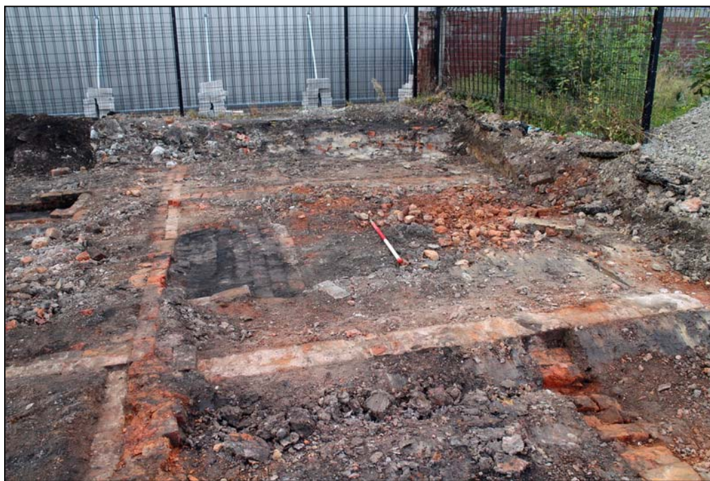
Plate 21: Rear room of Building E, from the north

4.2.9 The rear room of Building E was also bounded on its northern side by a wall of full-brick thickness, 115 (Fig 2; Plate 20). This had an offset butt joint with the north wall of the adjacent building ( 114 ), overlapping its northern side by half a brick (Fig 2; Plates 20 and 21). The wall returned to the north, to form part of a building within No 1 Court to the north (Fig 3), comprising a wall of 1½-brick thickness (Fig 2; Plate 21). The inner brick width of this return is of darker red brick, with a darker bond than the original pale lime bond and orangey brick of the north wall of Building E (Plate 21), suggesting that it represented an addition, but the outer skin of the wall is of similar fabric and bond to the wall to the west, suggesting that it may represent a single-skin return of Wall 115 , forming the structure within No 1 Court, shown on the Ordnance Survey plan of 1850 (Fig 3). The rear room measured approximately 13'9" x 11'8" (4.18 x 3.55m), and had a feature of some similarity to those in Buildings B-D against its eastern, rather than rear, wall (Fig 2; Plates 20 and 21). This comprised a single-skin wall of 2'6" (0.76m) length forming the northern edge of a sooted area of broken brick floor (Plates 20 and 21), measuring 6' x 2'6" (1.83 x 0.76m).