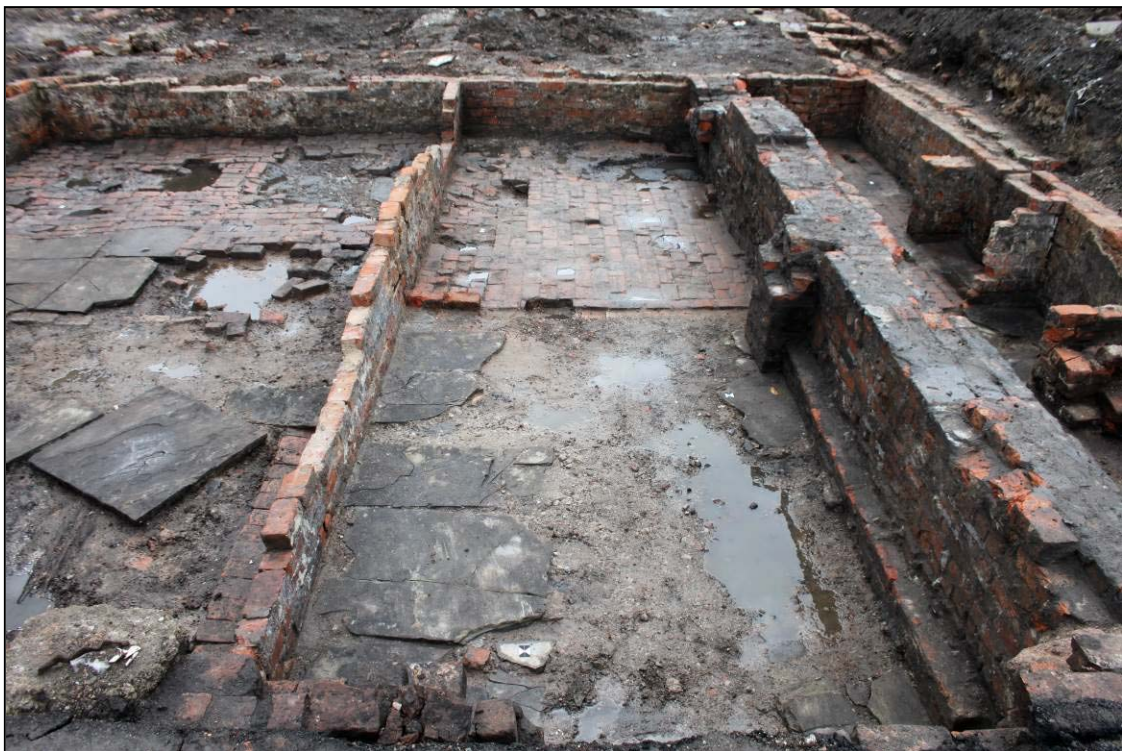
Plate 34: Excavated remains of Building H, from the east