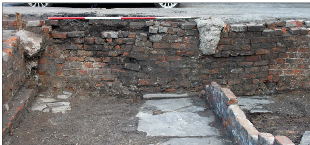
Plate 28: Front wall of Buildings H and I, 304 , with blocked doorways either side of cross-wall 305