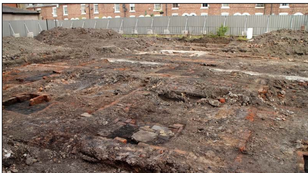
Plate 8: View looking east across the excavated area