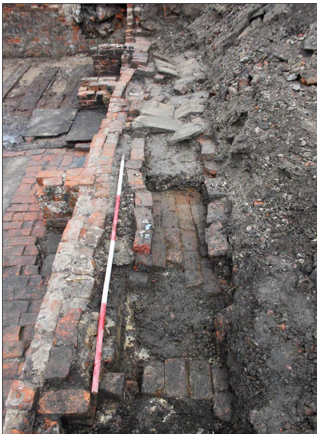
Plate 37: Passage to the south of Building I, looking east

were set on two single-skin unbonded sleeper walls of only a single course height (Plate 37). These were placed on a surface of bricks, observed to the full width of the passage, and of high enough quality to possibly represent an original floor surface within Building A, possibly suggesting that the Building was remodelled prior to, or during the construction of the properties fronting Spittal Street. The plan form of Building A shown on the 1850 Ordnance Survey plan (Fig 3) differs significantly from that shown on Greens map of 1794 (Plate 2, although none of the historic plans show a passage in this position.