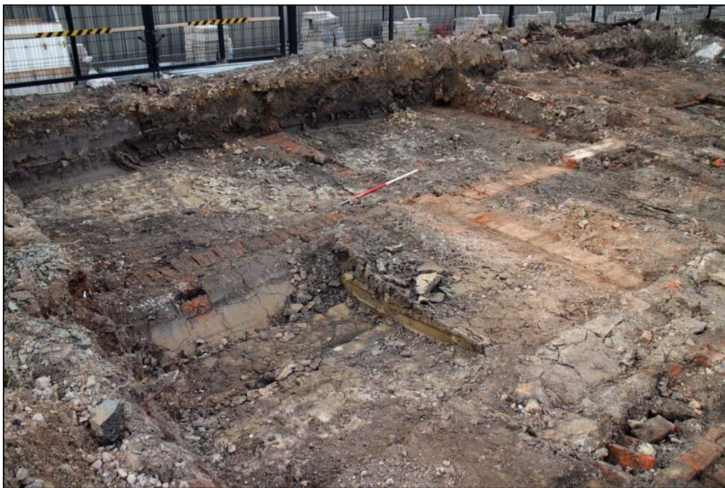
Plate 10: Building A from the north-east, with darker internal partitions 104 and 105