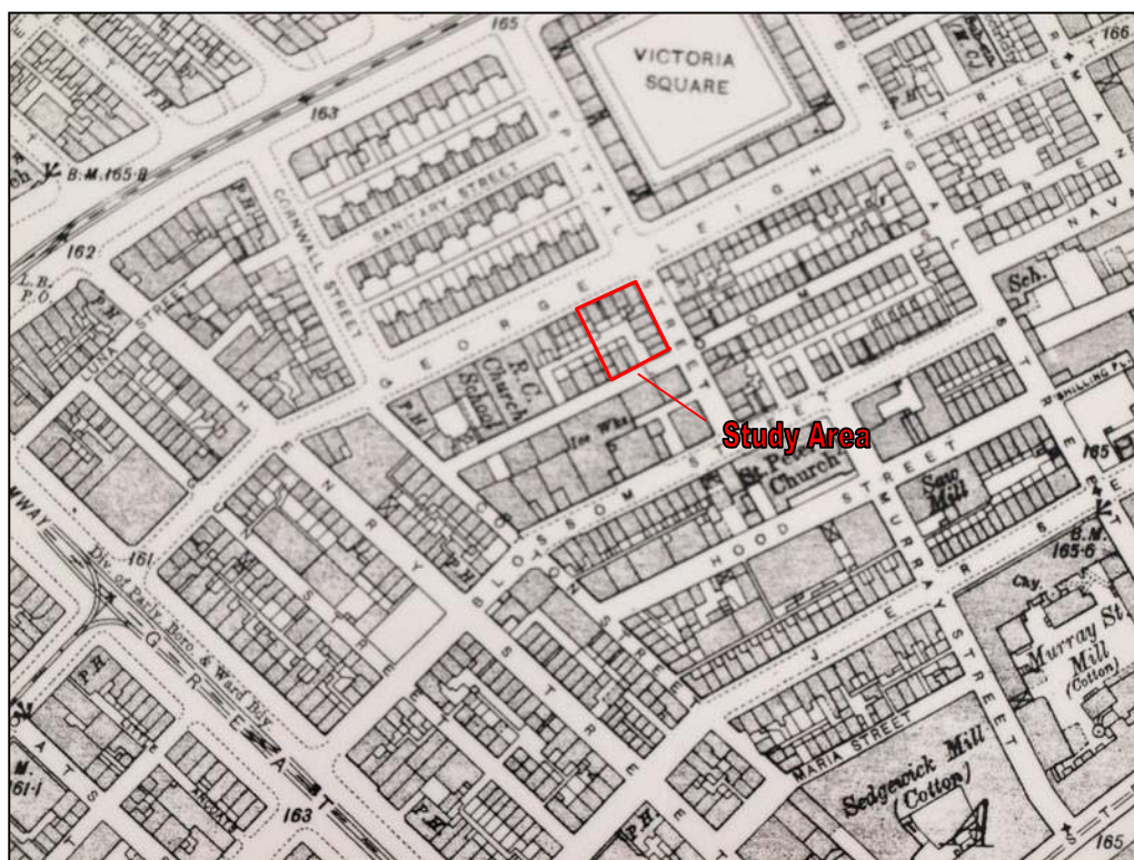
Plate 7: Extract from the 1908 Ordnance Survey map

3.5.7 The Ordnance Survey map of the area published in 1931 shows that all properties apart from those fronting George Leigh Street had been demolished, with a large rectangular school building erected centrally within the block, recessed slightly from the Loom Street frontage (Price 2014). An associated small rectangular structure was also placed at its north-eastern corner, adjacent to Sherratt Street.