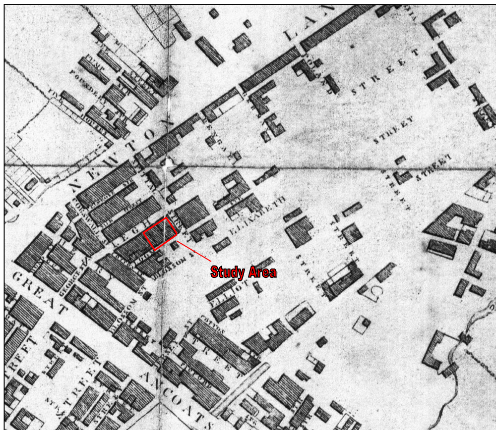
Plate 3: Extract from Bancks and Thornton's map of 1800