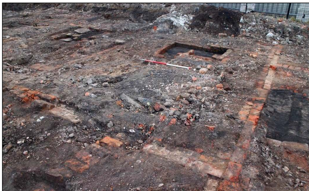
Plate 18: Building D from the north-west