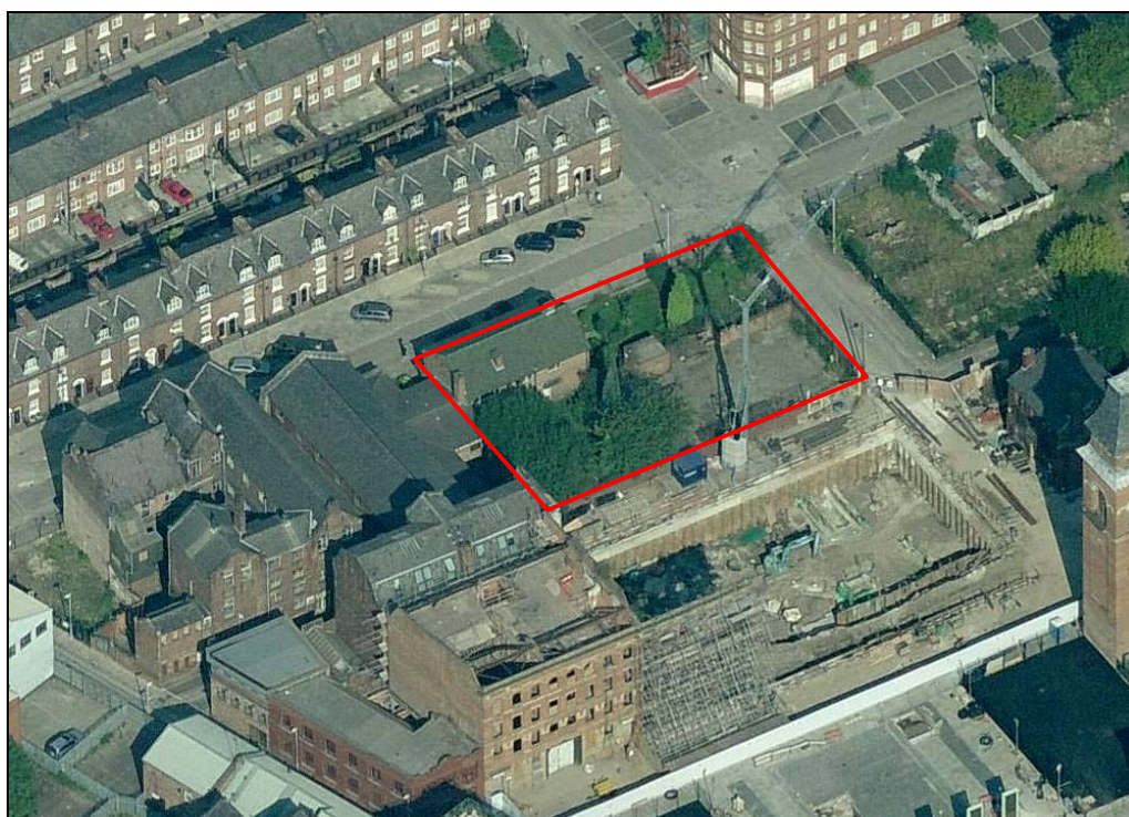
Figure 1: Recent aerial view of the development site

1.1.2 The site is currently occupied by a modern two-storey building (Figure 1), although it previously contained several back-to-back houses dating to the late eighteenth and early nineteenth centuries. The archaeological interest in these former buildings has been highlighted in a desk-based assessment that was produced to support the planning application (Price 2014).