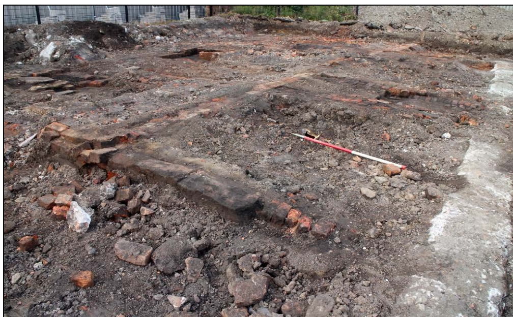
Plate 43: Probable outhouse/privy to the rear of Building B, looking south-west

4.5.10 At the eastern end of the rear of Building C, level with its projection beyond Building B, a length of wall projected into the courtyard to the north (Fig 2). Its southern end comprised a large cracked sandstone step of 4'4" (1.32m) length (Fig 2; Plate 43), which almost certainly formed a threshold step into the yard to the rear of Building C, the Ordnance Survey edition of 1908 showing that Building B had been demolished by this date, to increase the rear access of the remaining properties fronting Loom Street (Plate). To the north of the large threshold step, only a 0.5m length of broken brick wall survived, representing the only survival of the boundary wall to the inserted yard.