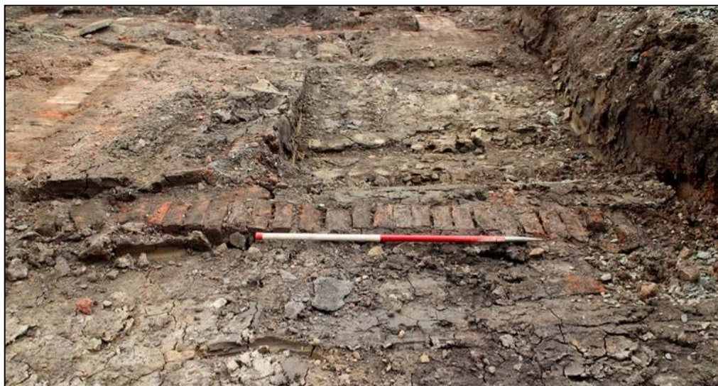
Plate 11: Probable footing of internal wall 105, with projecting fireplace cheek

4.2.3 No evidence for the north wall of Building A was observed, with a passage surviving to the immediate north of the structure, not shown on any of the historic mapping. A further passage survived to the immediate west of Building A, but unlike that to the north, this is depicted on Bancks and Co's plan of 1832 (Plate 5), the Ordnance Survey edition of 1850 (Fig 3), and Adshead's plan of 1851 (Plate 6). It was of 3' (0.91m) width, with the eastern wall being formed by the west wall of Building A, and the west wall, which formed the east wall of Building B at ground floor level, being of only a single-skin thickness (Plate 12). Nothing survived of the flooring of the passage, although one displaced sandstone flag appears to represent a remnant. Sections of broken salt-glazed ceramic pipe were also revealed (Plate 12), demonstrating that the sanitation of the dwellings was improved in the late nineteenth-century, with the passage being used to link the court to the main sewer beneath Loom Street.