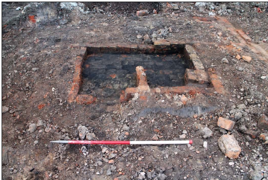
Plate 19: Probable staircase within rear room of Building D, looking south

4.2.8 Building E was the westernmost structure observed along the Loom Street frontage within the excavation area (Fig 2). Most of the structure lay beyond the limit of excavation (Fig 3), but structural internal features were revealed, alluding to its original form. Its eastern wall ( I12 ) was formed by the external wall of Building D, which was butted by a full-brick thickness cross wall ( I13 ), placed 2'6" to the north of the single-skin cross-wall in Buildings B-D (Fig 2; Plate 20), and creating a front room of approximately 14'6" (4.42m) depth, again in slight contrast to that shown on the Ordnance Survey plan of 1850 (Fig 3). The wall was continuous across the trench, suggesting that any doorway between front and rear rooms either lay at the very western end, beyond the limit of excavation, was placed above the level of the survival of the wall, or more probably, given the full-brick thickness of the wall, was not included in the original construction.