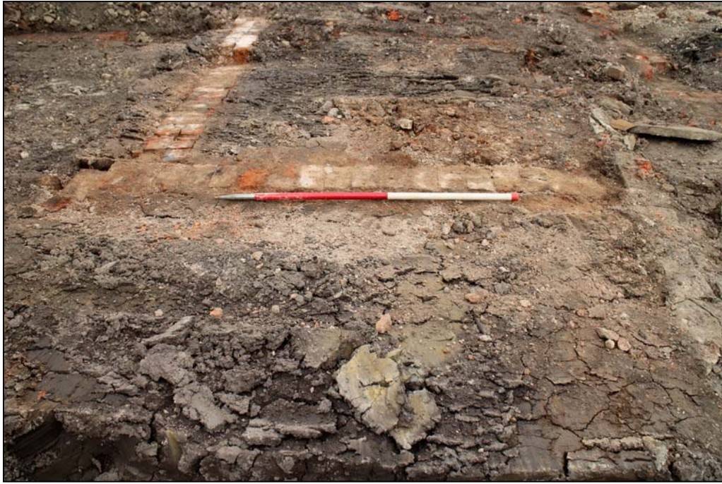
Plate 9: Walls 101 (centre) and 102 (left) forming the original external walls of Building A