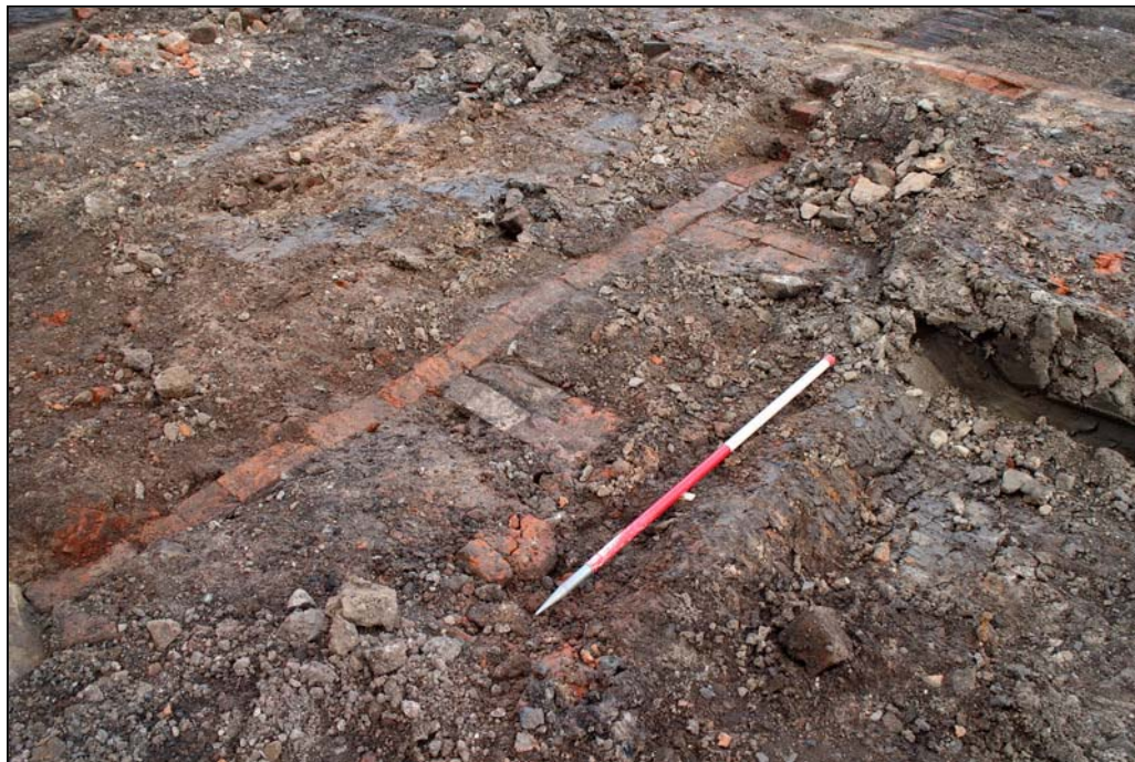
Plate 15: Wall III, with fireplace cheeks in rear room of Building C

supported on their western side by a further course of bricks (Plate 16), with a further course of flags set at a lower level to the north, forming a shallow step (Plate 16). This overlay a rough broken brick floor against the northern opening, which presumably formed part the original floor of within the structure.