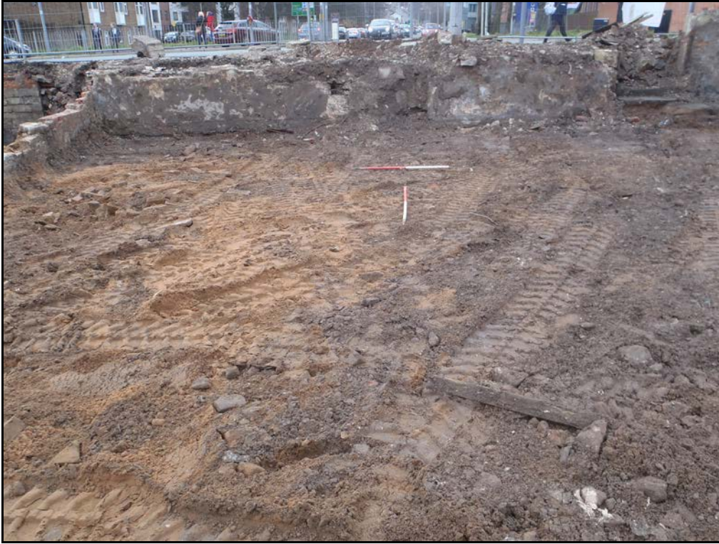
Plate 3: North-west-facing view of building 1016, formerly 53 King Street