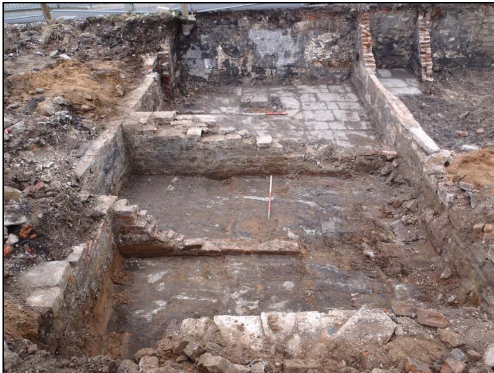
Plate 1: North-west-facing view of cellar 1014, formally 57 King Street