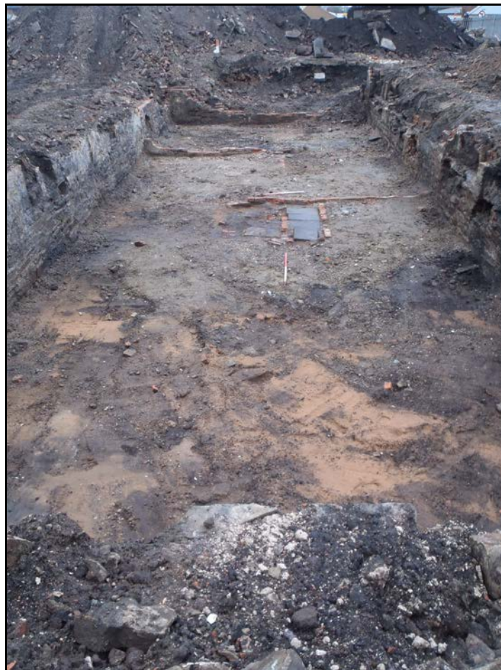
Plate 6: South-west-facing view of cellars 1009, 1010, 1011 and 1012