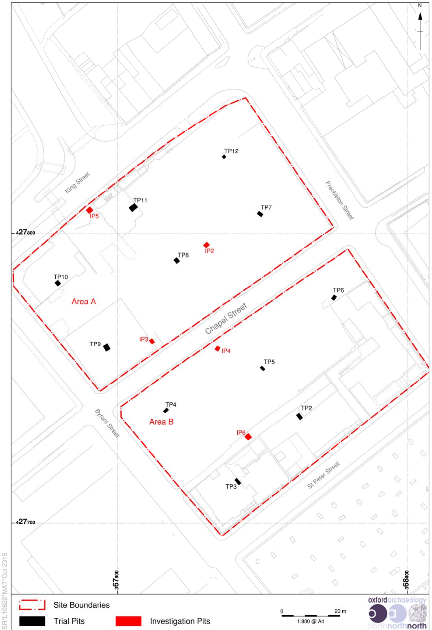
Figure 2: Location of trial pits and investigation pits