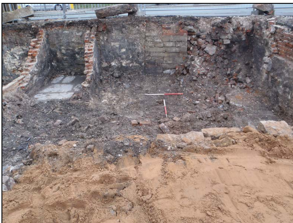
Plate 2: North-west-facing view of cellar 1015, formally 55 King Street