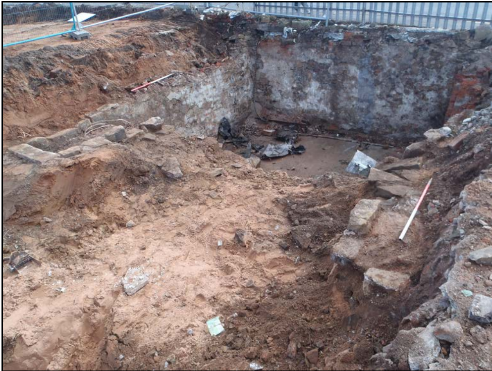
Plate 5: East-facing view of cellars 1006 and 1007