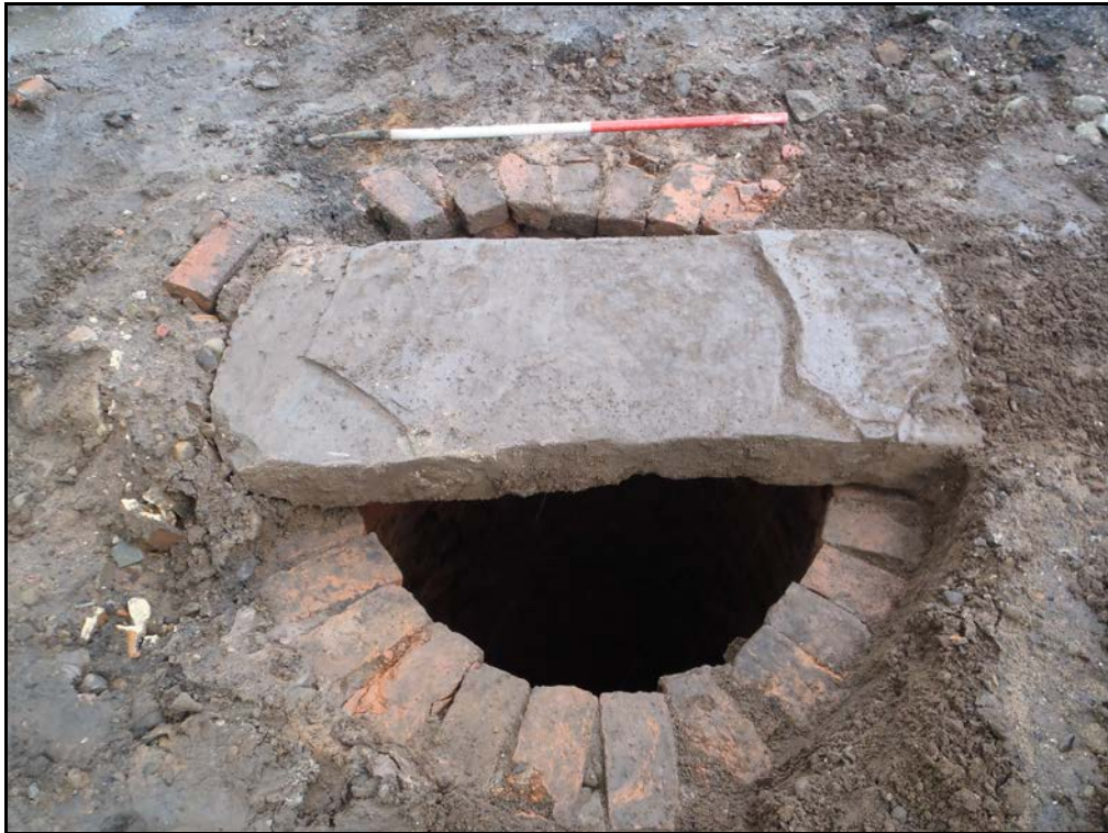
Plate 7: West-facing view of well 1013