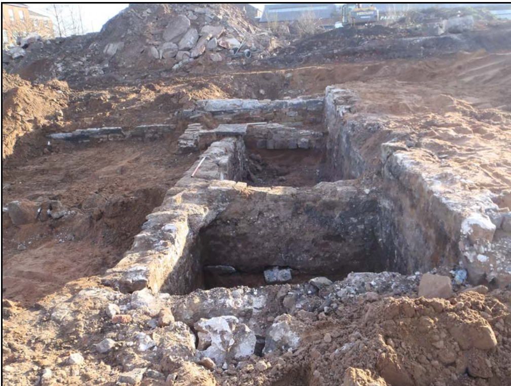
Plate 4: North-east-facing view of cellars 1017