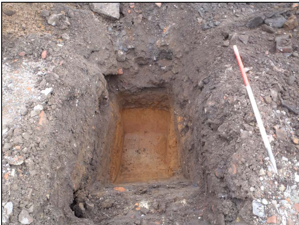
Plate 8: South-east-facing view of Test Pit 02