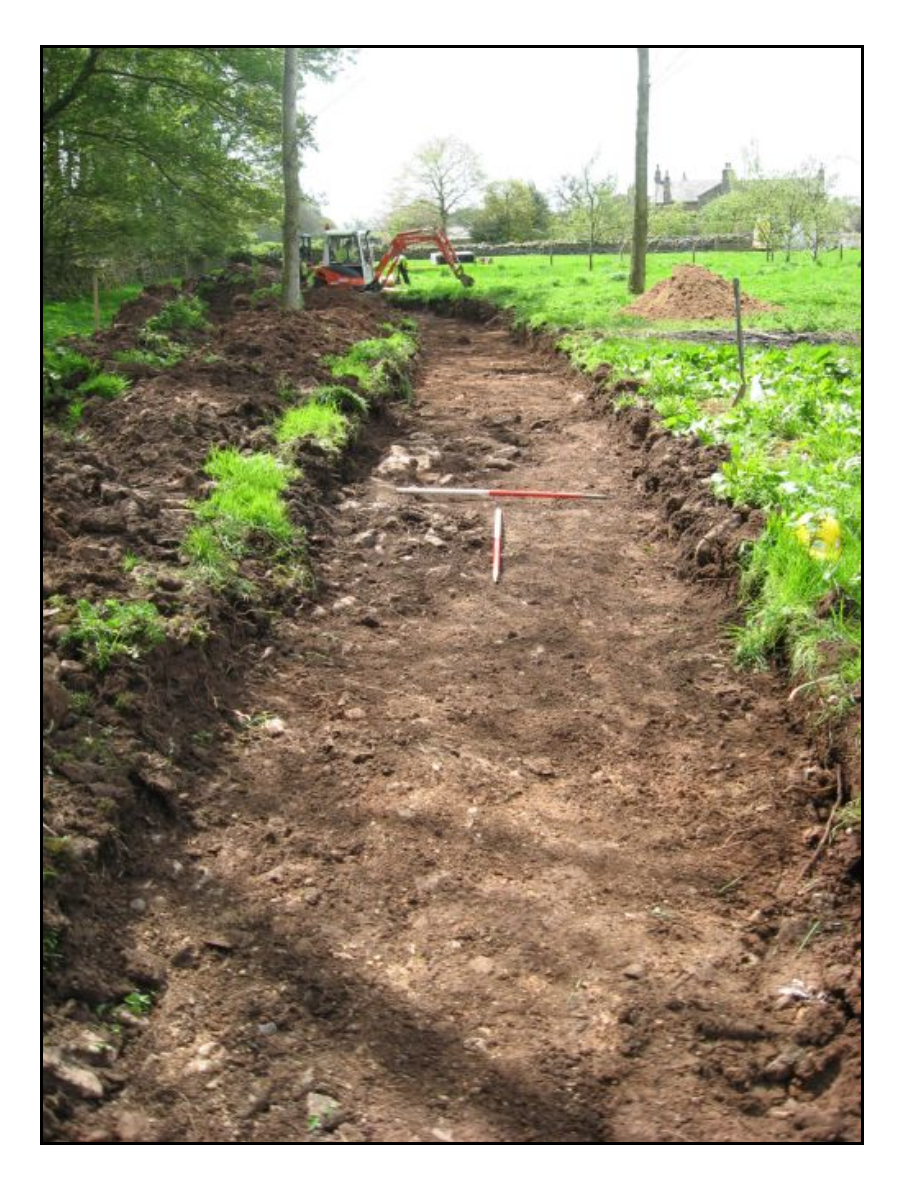
Plate 1: General shot of putative Roman Road, looking south-west. Septic tank cut runs eastwest across the shot