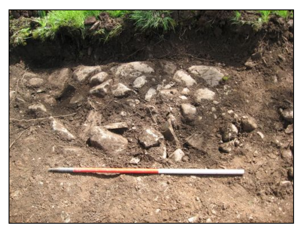
Plate 2: Detail of putative Roman Road, looking south-east. Septic tank cut is in the foreground