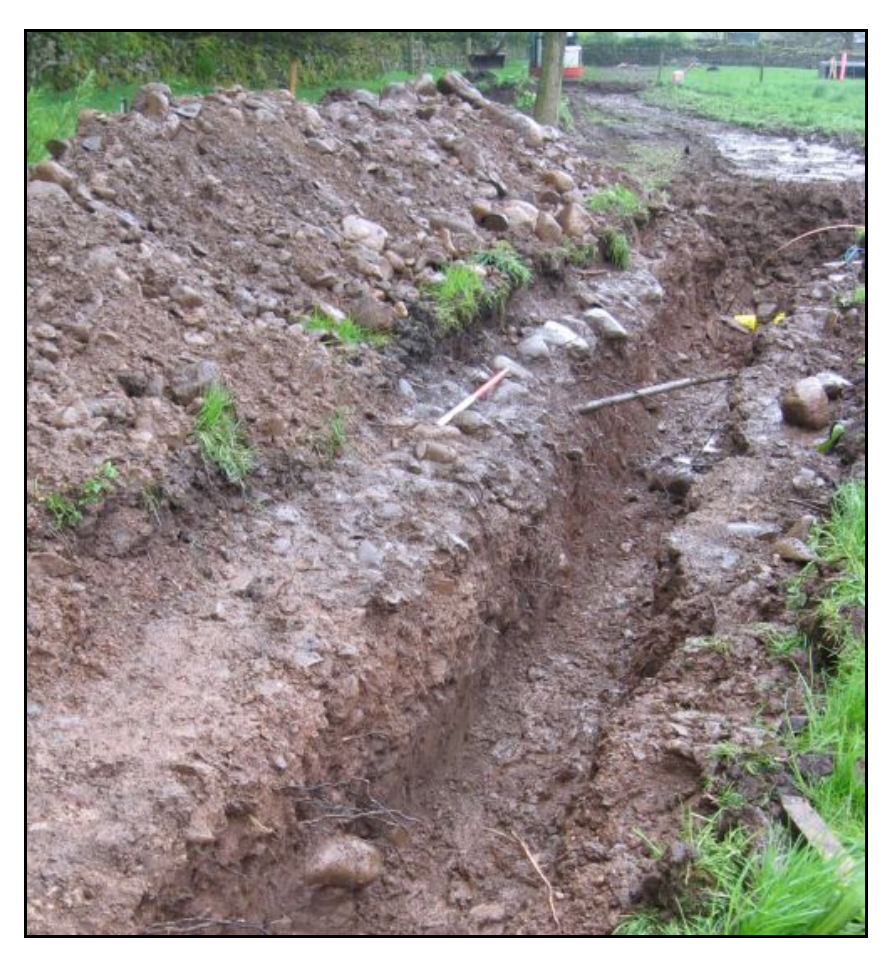
Plate 3: Oblique section through putative Road, with the septic tank cut to the fore