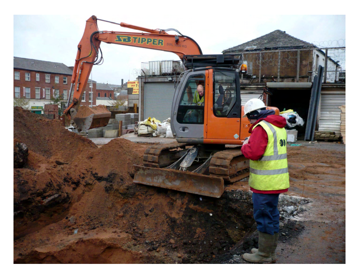
Plate 4: The excavation of Trench 1, looking north