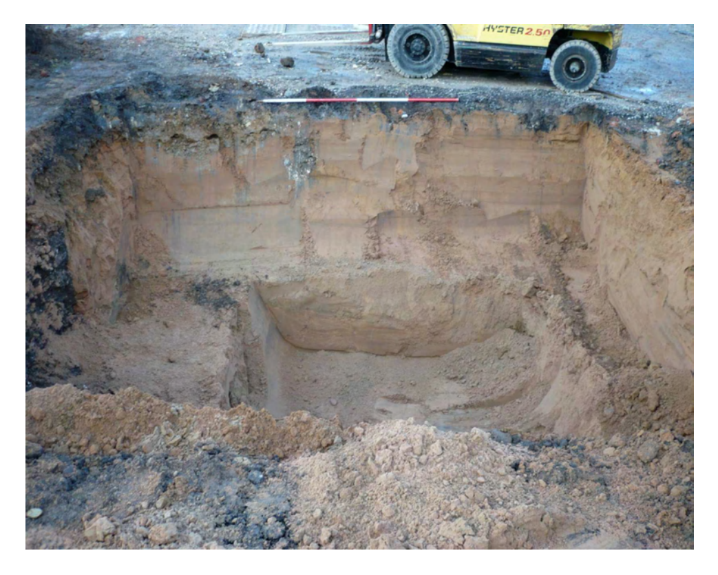
Plate 2: Trench 2 looking north-west