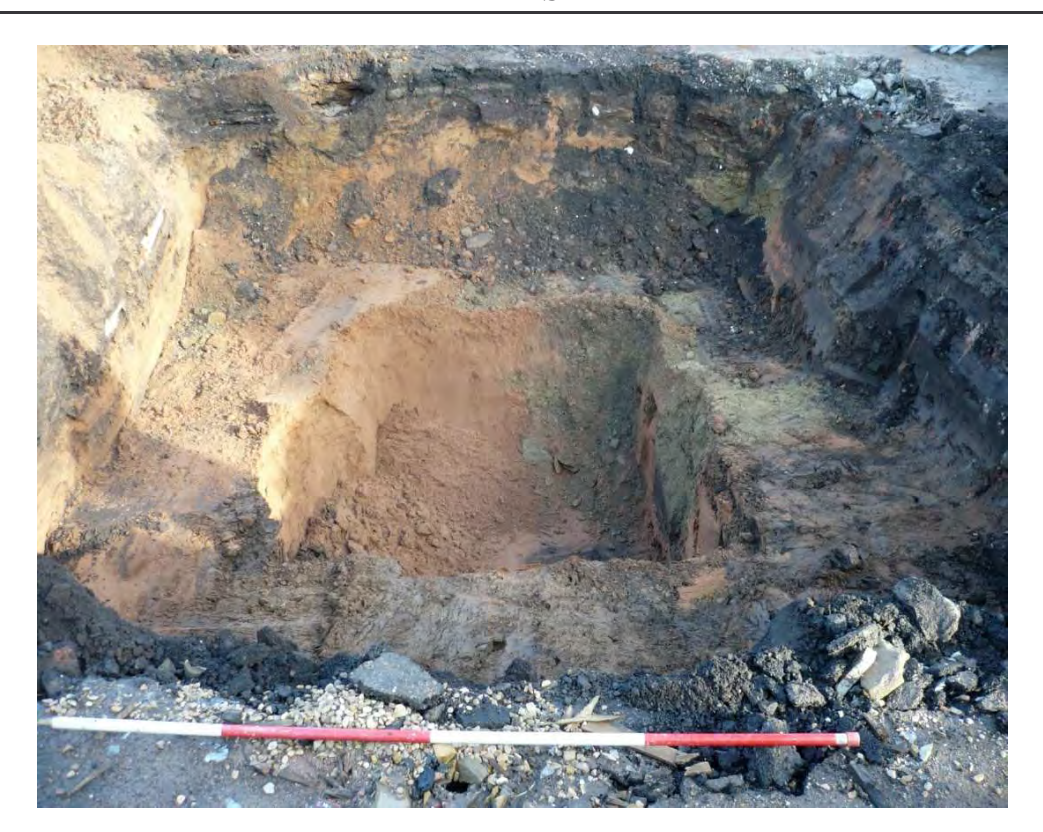
Plate 1: Trench 1 looking north-east