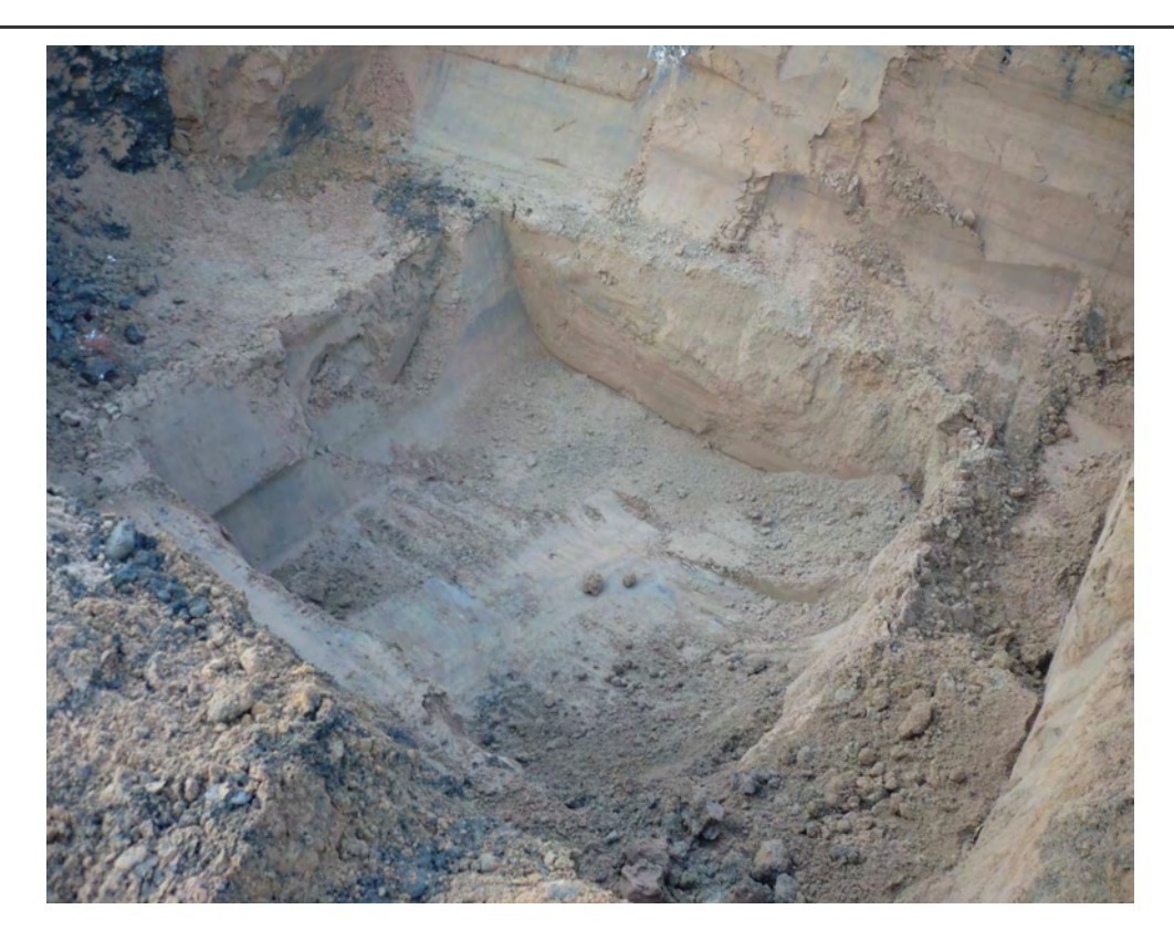
Plate 3: Base of Trench 2 showing natural sands 203